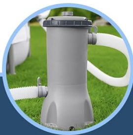
2 Hoses Included