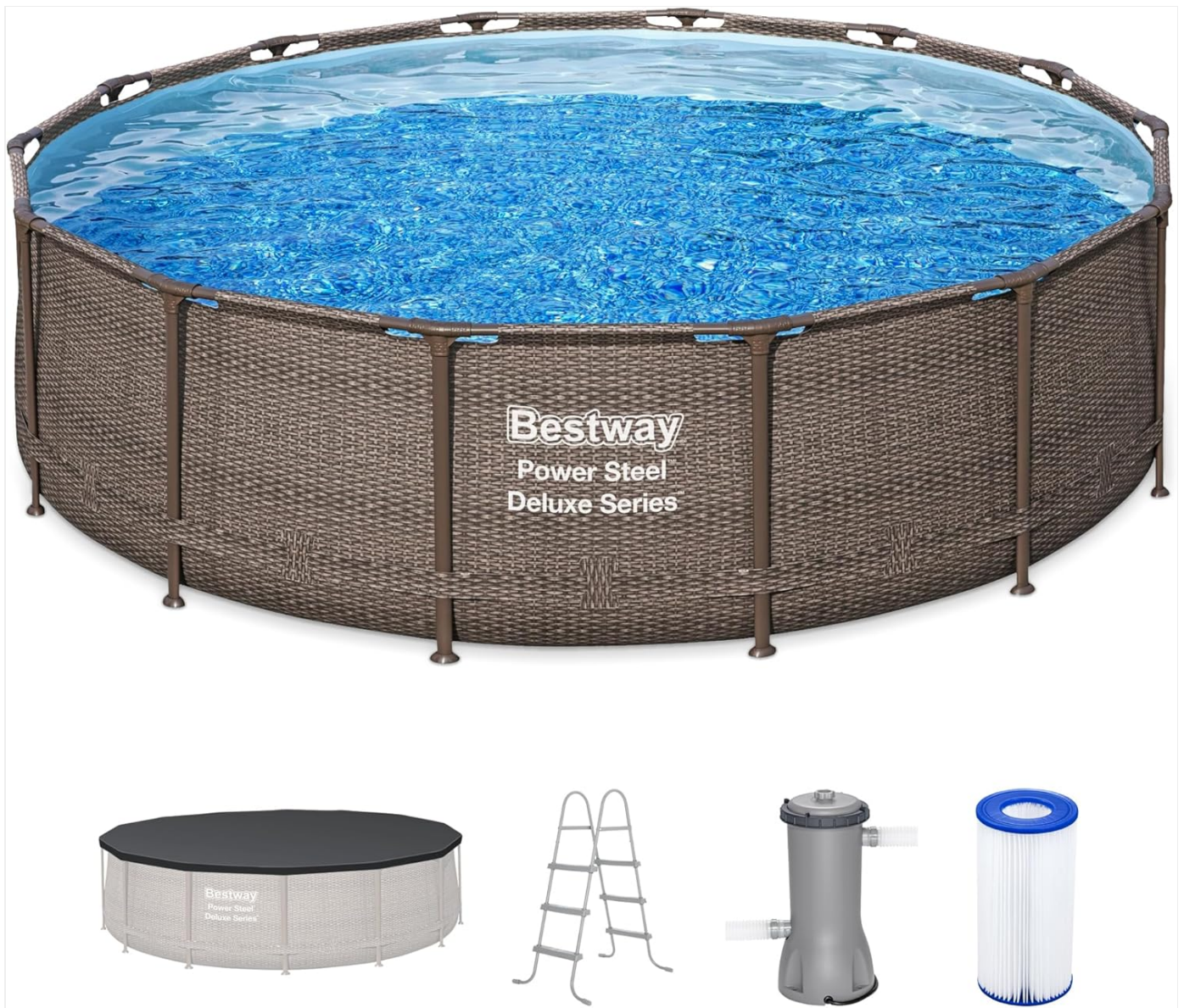
Image: The complete Bestway Power Steel pool set, including the pool, filter pump, ladder, and cover.