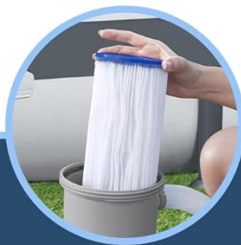
Uses Type III-A/C Filter Cartridges