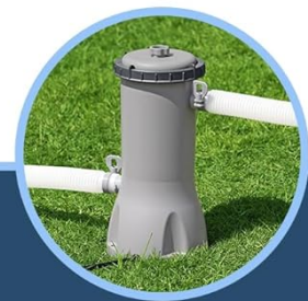
Energy-Saving On/Off Timer

Image: Details of the 1,000 Gallon Filter Pump, showing its dimensions, included hoses, use of Type III-A/C filter cartridges, and energy-saving timer.