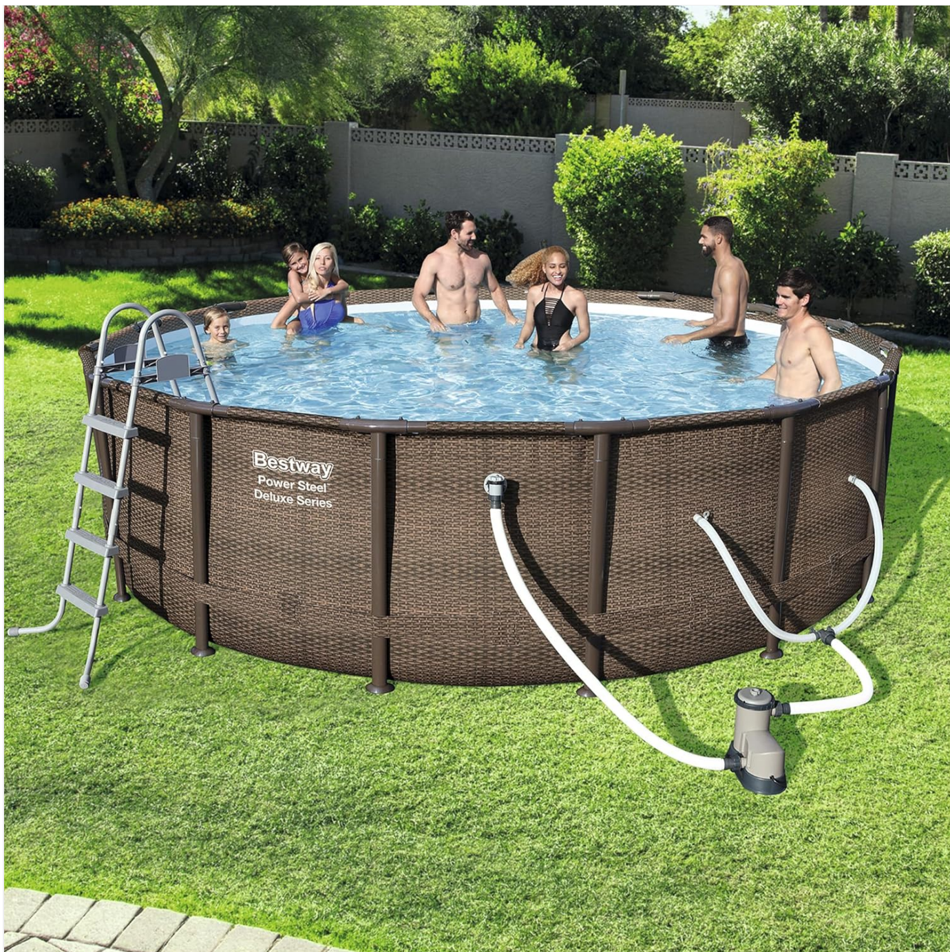
Image: Several people enjoying the Bestway Power Steel pool, with the external filter pump and hoses clearly visible.