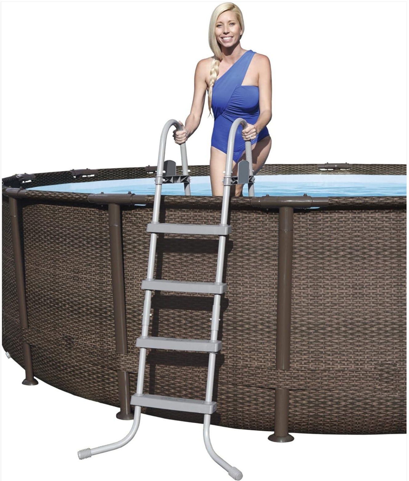
Image: A woman demonstrating the use of the pool ladder for entry and exit.