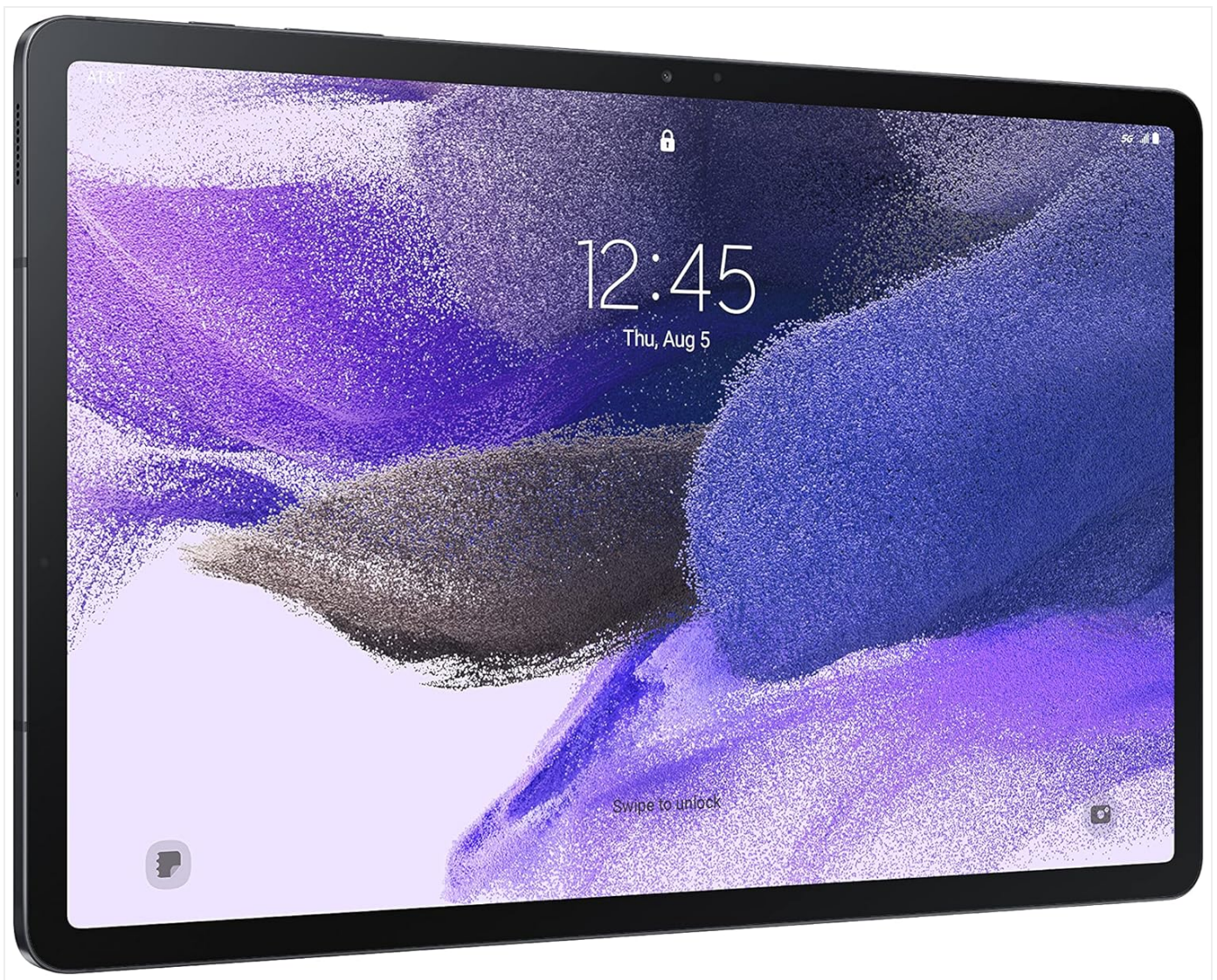
Front view of the Samsung Galaxy Tab S7 FE, showcasing its large 12.4-inch display. The screen displays the time and date, indicating a typical lock screen or home screen appearance.