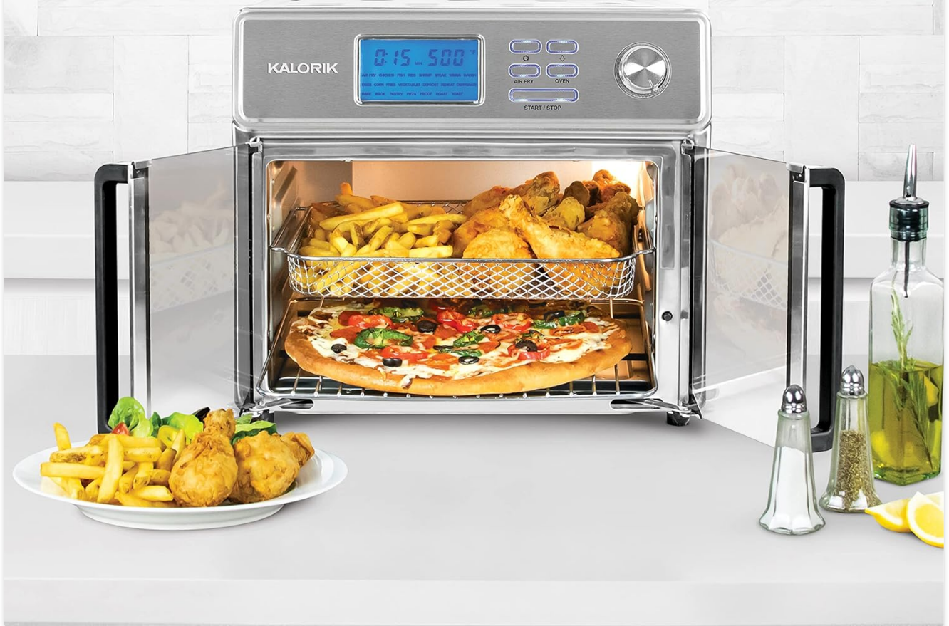
Image 5.2: Air frying French fries and a pizza simultaneously using the included accessories.

UP TO 500°F FOR PERFECT SEARING AND BROWNING ON MEAT, FISH, AND VEGGIES