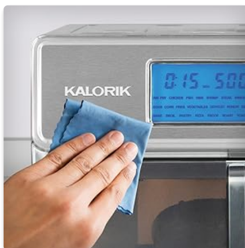
Image 6.1: A hand wiping the exterior of the Kalorik MAXX Plus, demonstrating ease of cleaning.