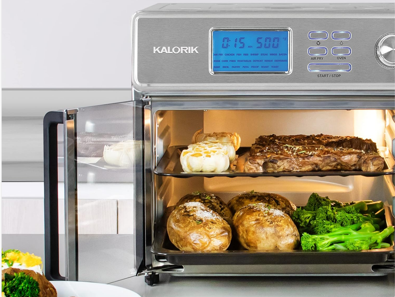
Image 5.3: Roasting various foods, including meat, baked potatoes, and broccoli, on different racks.

Your browser does not support the video tag.