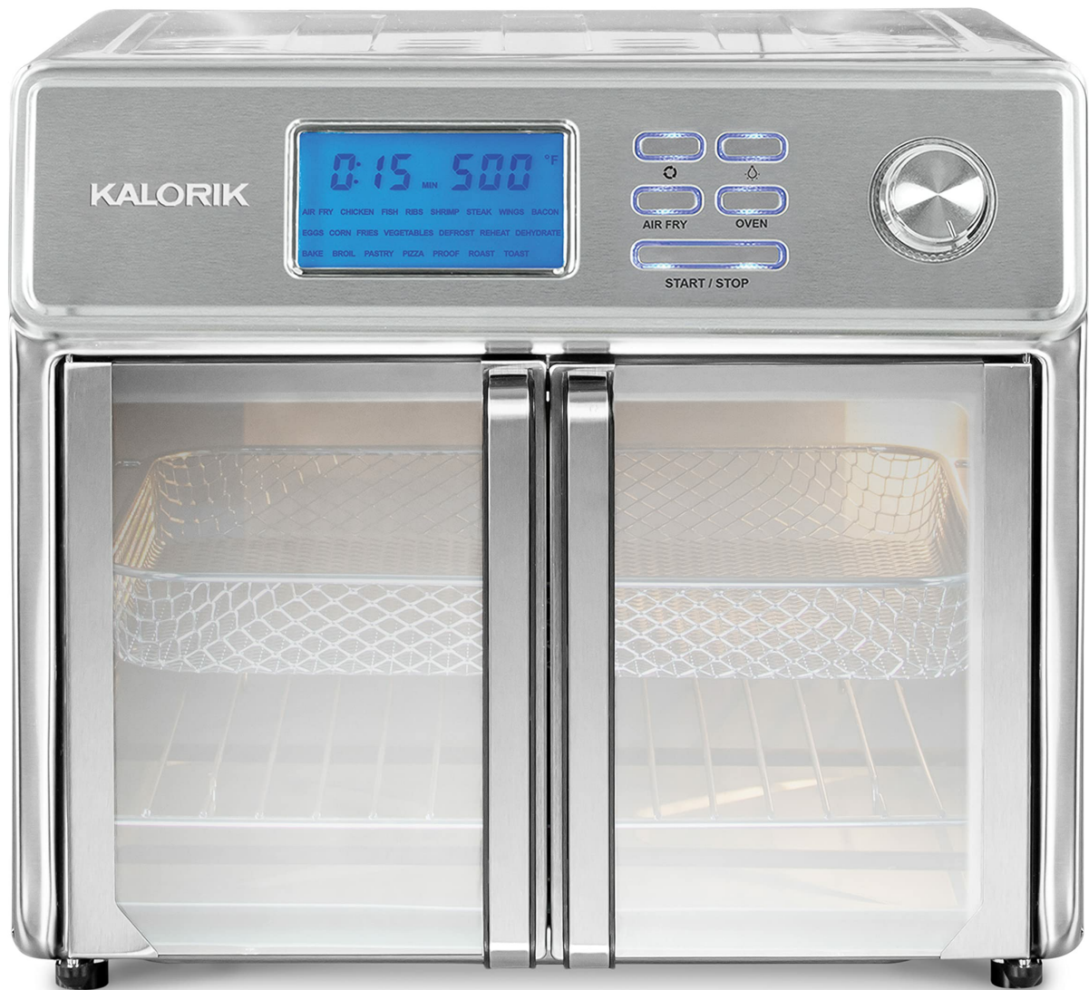
Image 1.1: The Kalorik MAXX Plus Digital Air Fryer Oven, a versatile 10-in-1 kitchen appliance.