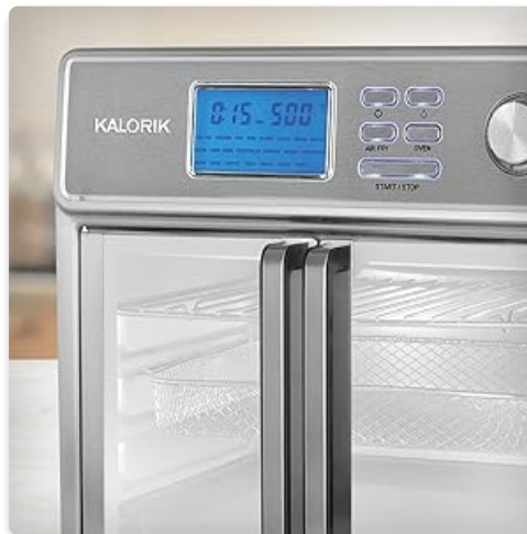
Image 5.1: Close-up of the digital control panel with time, temperature, and preset options.

The digital control panel allows for precise temperature and time adjustments, as well as selection from 22 smart presets.