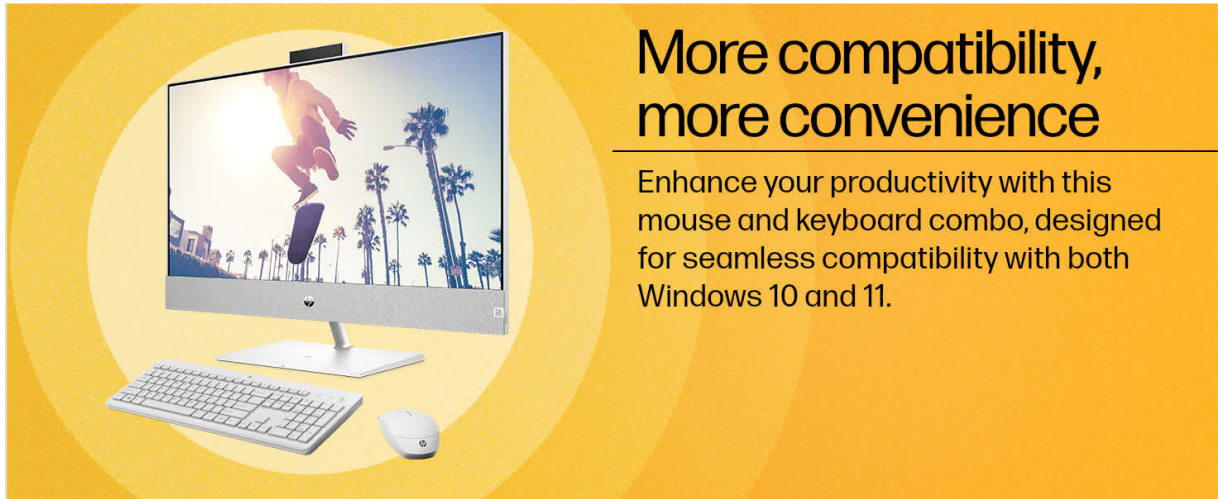
Image 3.2: Visual representation highlighting the compatibility of the HP 230 combo with Windows 10 and 11 for enhanced convenience.