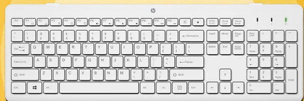
Image 4.2: Illustrates the quiet keystrokes and comfortable typing experience provided by the full-size chiclet keyboard with its 3-zone layout.

This full-size chiclet keyboard features quiet clicks and a 3-zone layout, ensuring a silent and efficient typing experience, ideal for late-night productivity or shared workspaces.