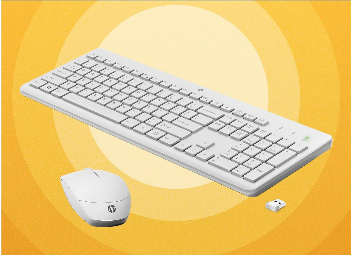
Image 4.1: The HP 230 Wireless Keyboard, emphasizing its stylish, comfortable, quiet chiclet design, full-size layout, and 3-zone arrangement.

Seamlessly switch between devices with a Windows 10/11 compatible combo.