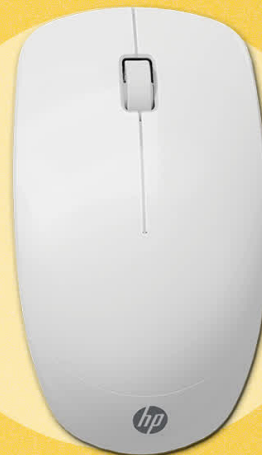
Image 4.4: Demonstrates the smooth and accurate cursor movements achievable with the 1600 dpi mouse and its red optical tracking.

Achieve smooth and accurate cursor movements for detailed graphic design or office work with this 1600 dpi mouse featuring red optical tracking.