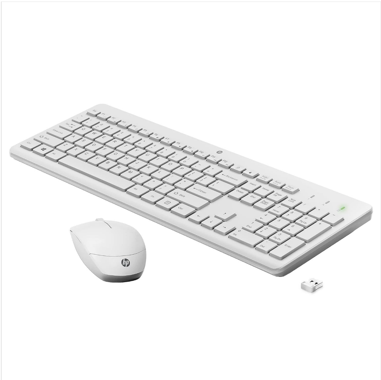
Image 1.1: The HP 230 Wireless Keyboard and Mouse Combo, showcasing the white keyboard, mouse, and the compact USB receiver.