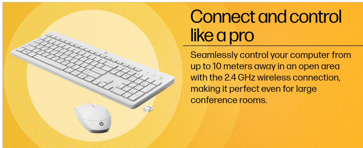
Image 4.5: Illustrates the ability to connect and control your computer from up to 10 meters away using the 2.4 GHz wireless connection.

The 2.4GHz wireless connection offers a reliable operating range of up to 10 meters (approximately 33 feet) in an open area, providing flexibility for your workspace.