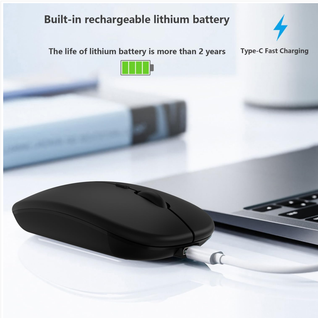
Image: The Xukinroy M660 mouse being charged via its USB-C port, highlighting its built-in rechargeable lithium battery and fast charging capability.