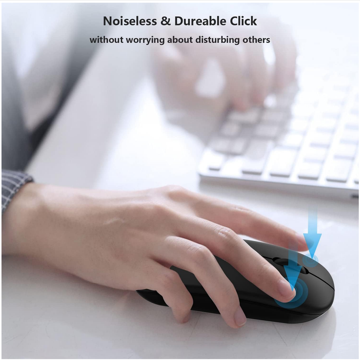
Image: A hand operating the Xukinroy M660 mouse, with visual cues indicating its noiseless and durable click functionality.