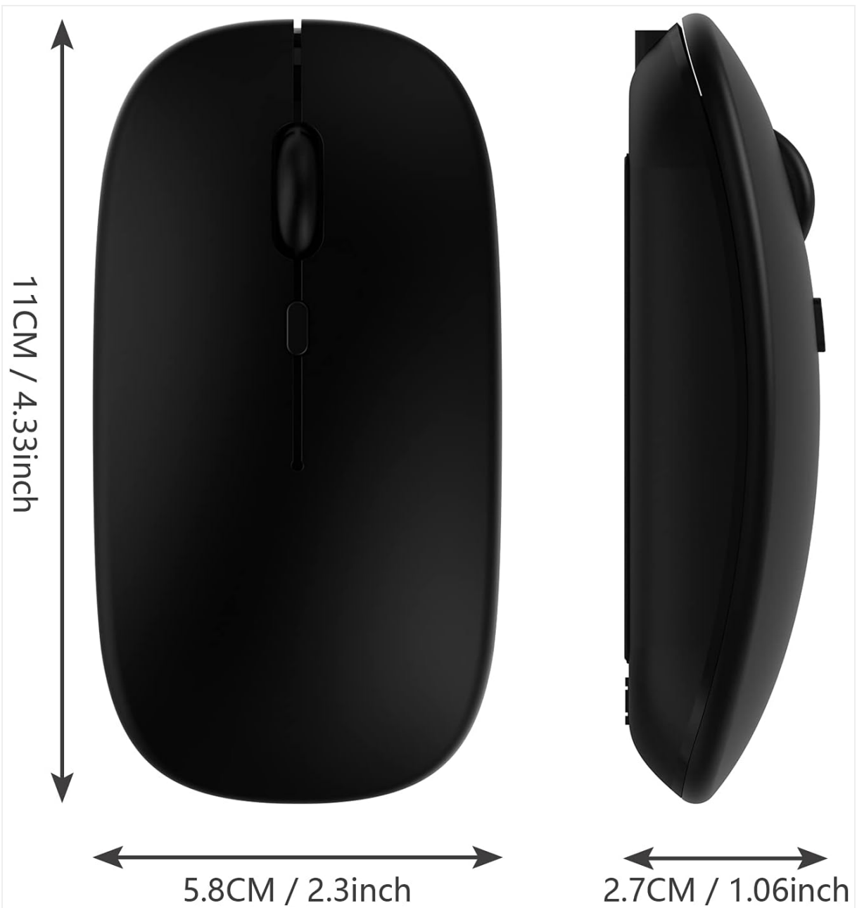
Image: Detailed dimensions of the Xukinroy M660 mouse, showing its length (11cm / 4.33inch), width (5.8cm / 2.3inch), and height (2.7cm / 1.06inch).