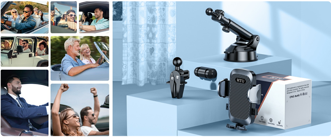
Figure 2.1: Included Components