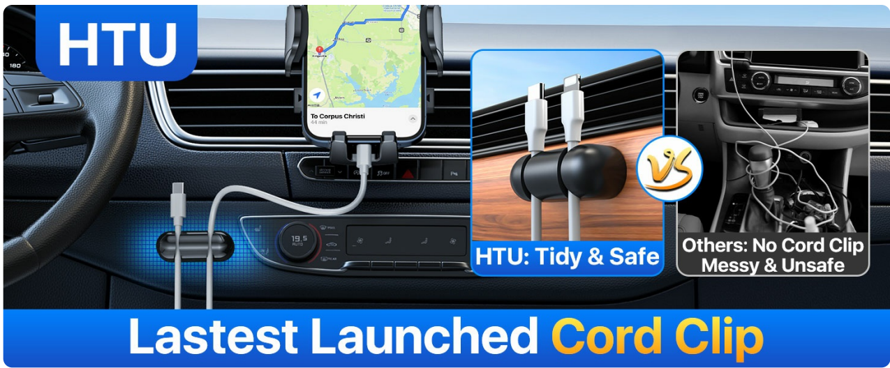
Figure 4.3: Cable Manager in Use