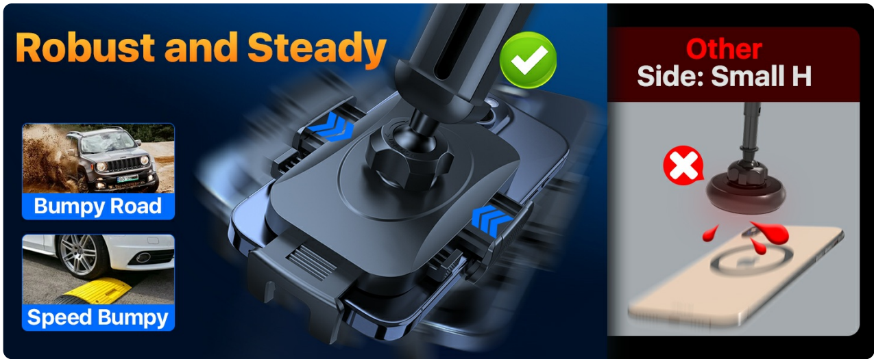
Figure 6.1: Stable Design for Various Road Conditions