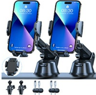
Figure 4.1: Phone Compatibility and Insertion

Your browser does not support the video tag.