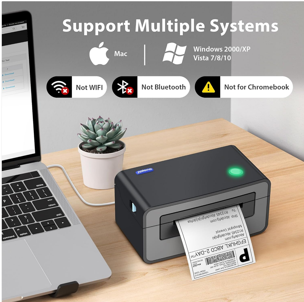
Image: The POLONO PL60 printer connected to a laptop, indicating compatibility with Mac and Windows systems.