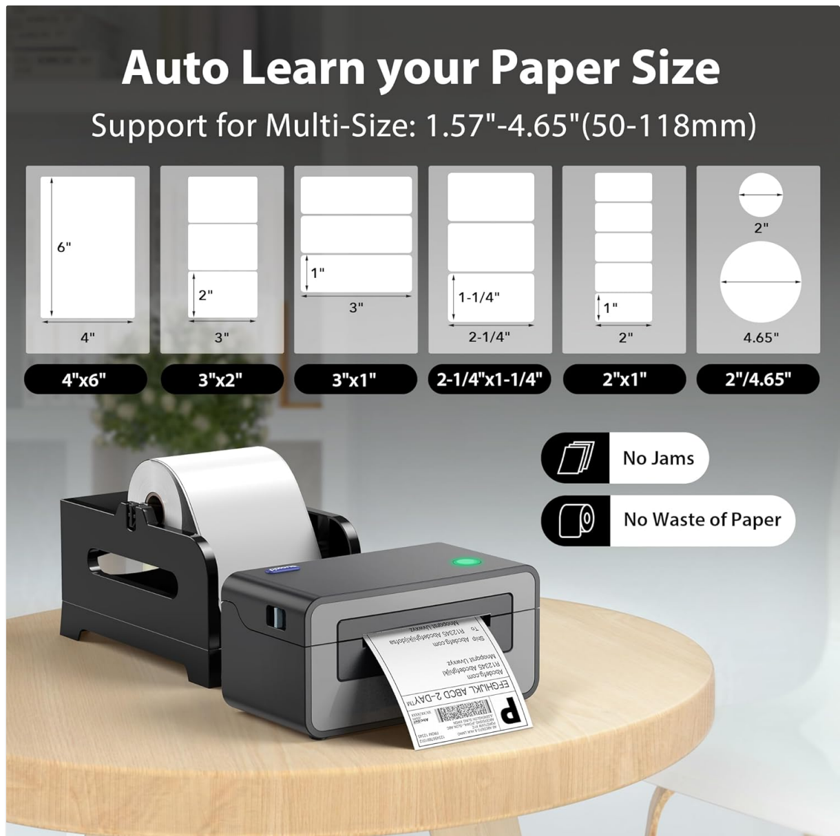
Image: Visual representation of different label sizes that the POLONO PL60 printer can automatically detect and print.