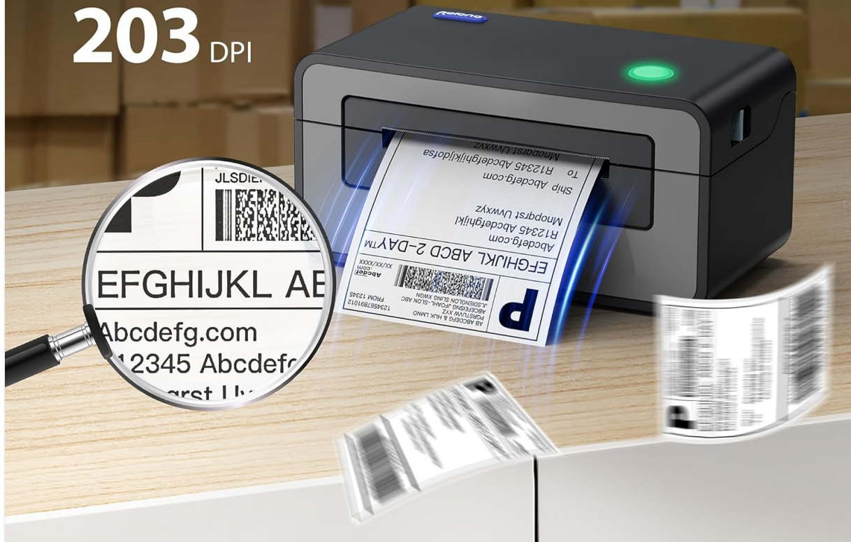
Image: The POLONO PL60 printer printing a label, highlighting its high efficiency and print quality.