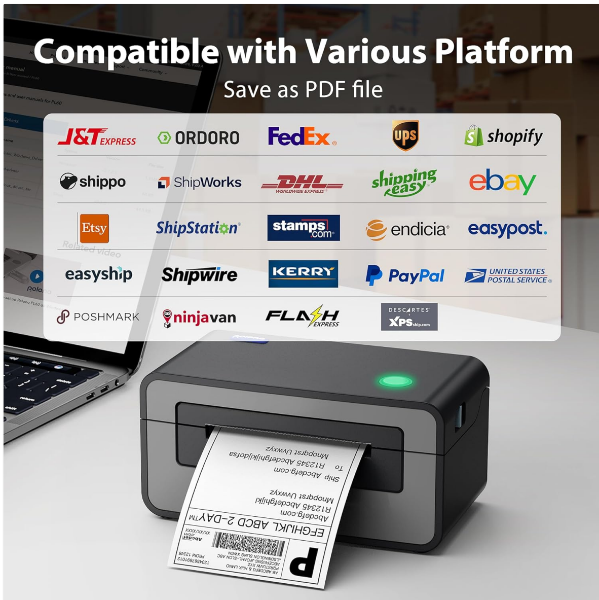
Image: The POLONO PL60 printer with labels loaded, showing the automatic label detection feature.