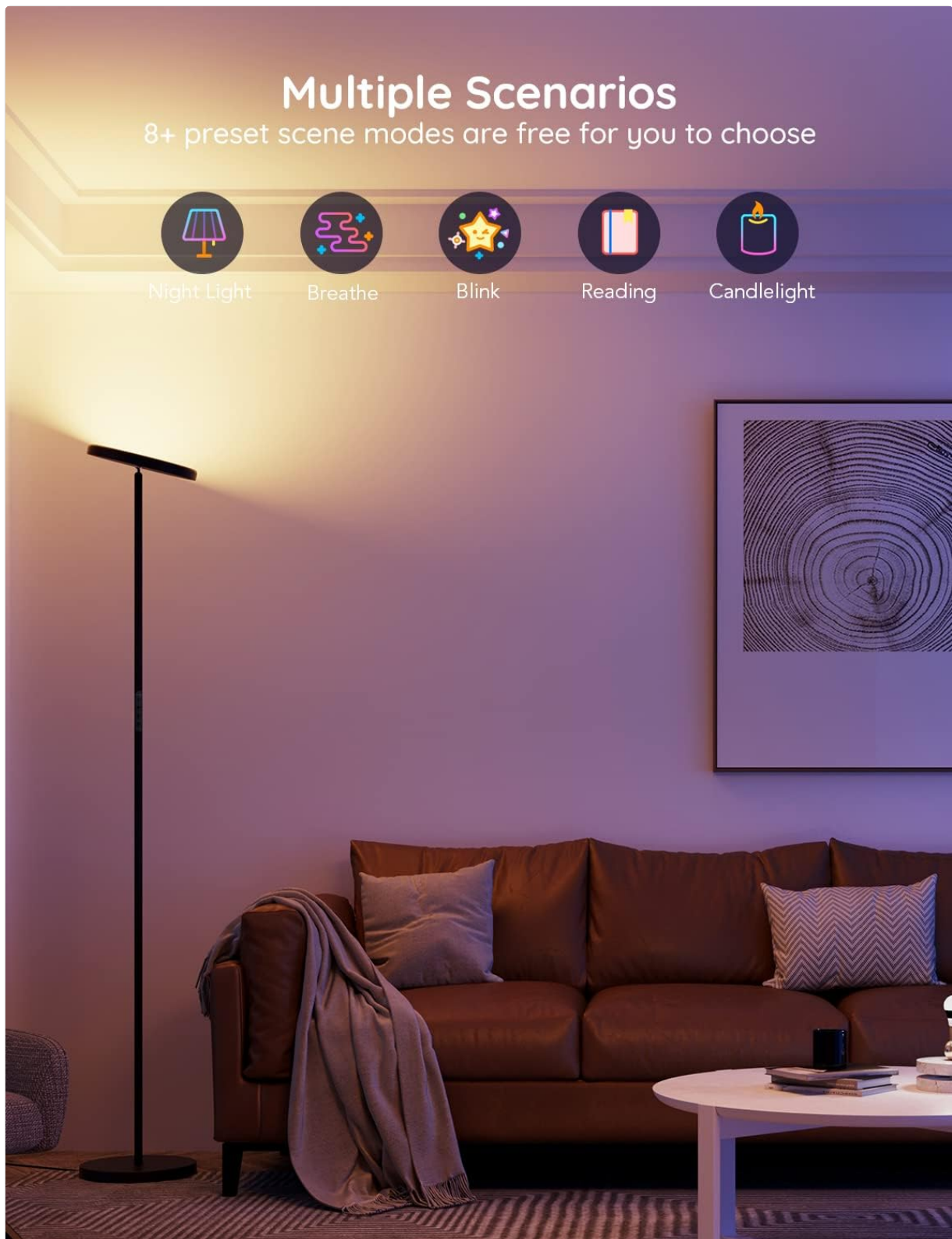
Examples of multiple preset scene modes available through the Govee Home App.