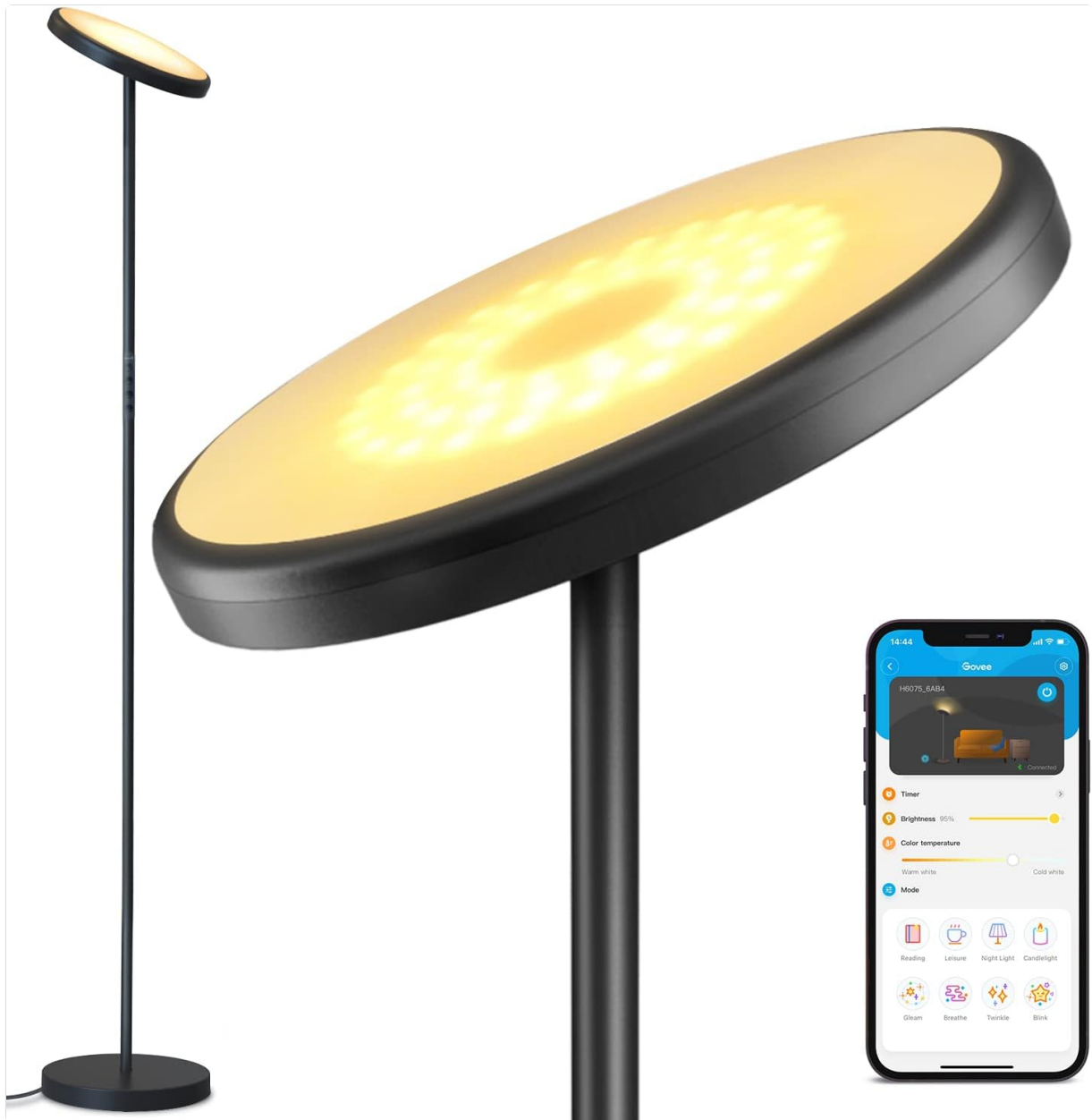
The Govee LED Floor Lamp (Model H6075) showcasing its sleek design and the accompanying mobile application for smart control.