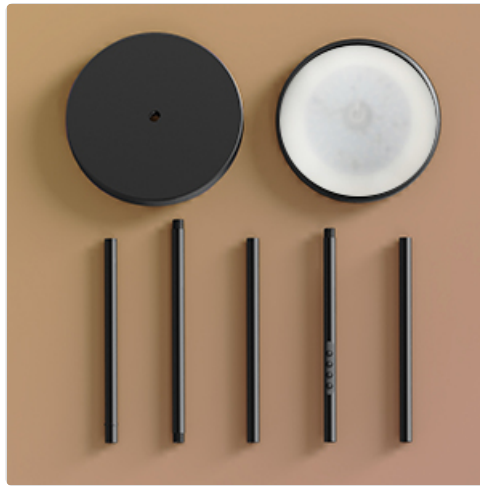
All components included in the Govee LED Floor Lamp package.