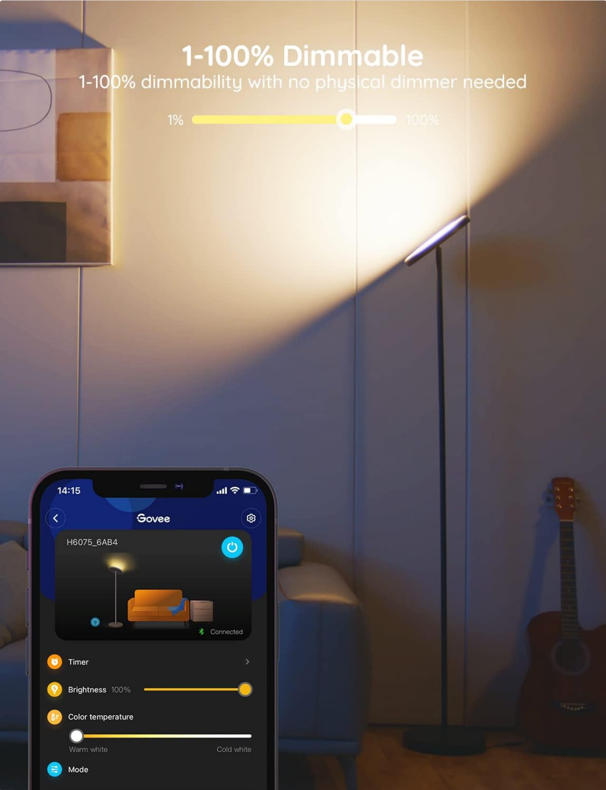
The Govee Home App provides comprehensive control over brightness and color temperature.