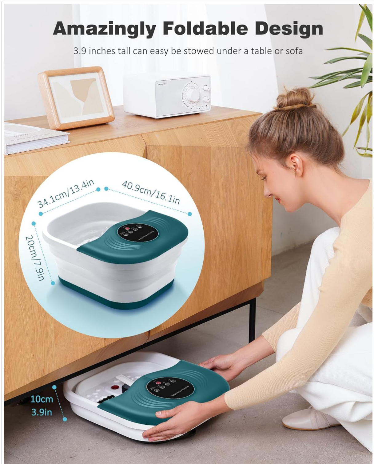
An image illustrating the foot spa's foldable design, showing a person easily collapsing the unit and storing it under a low cabinet, highlighting its compact storage capability.