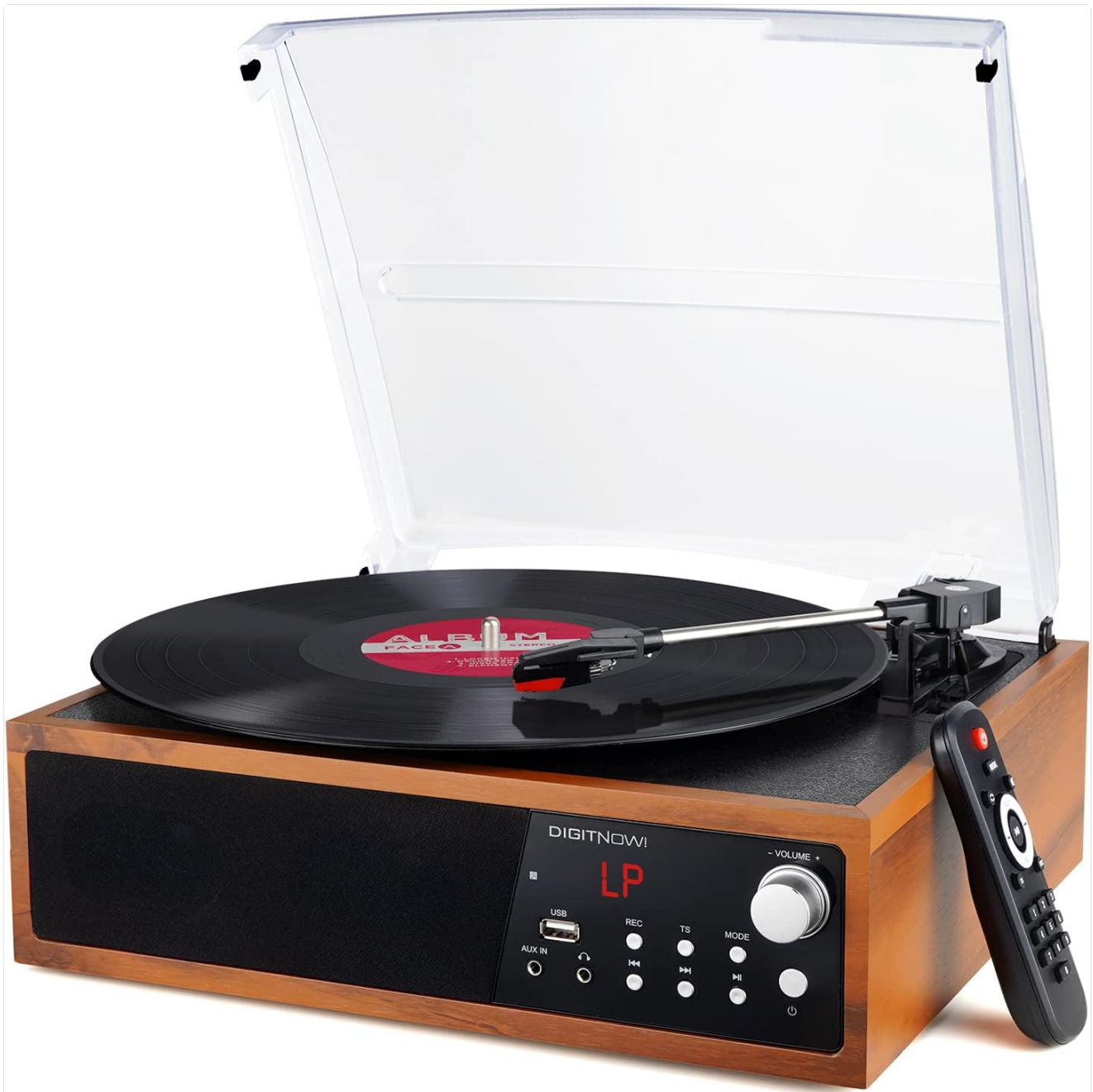
Figure 6.7.1: The record player comes with a remote control for ease of use.