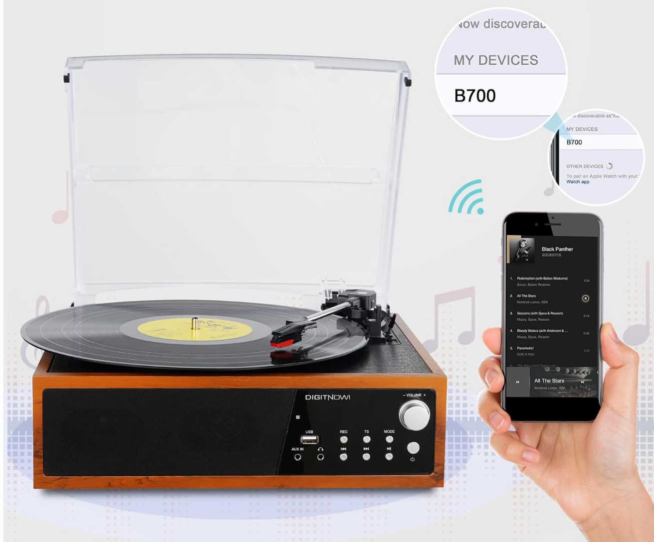
Figure 6.2.1: Easily pair your smartphone via Bluetooth to stream music wirelessly.