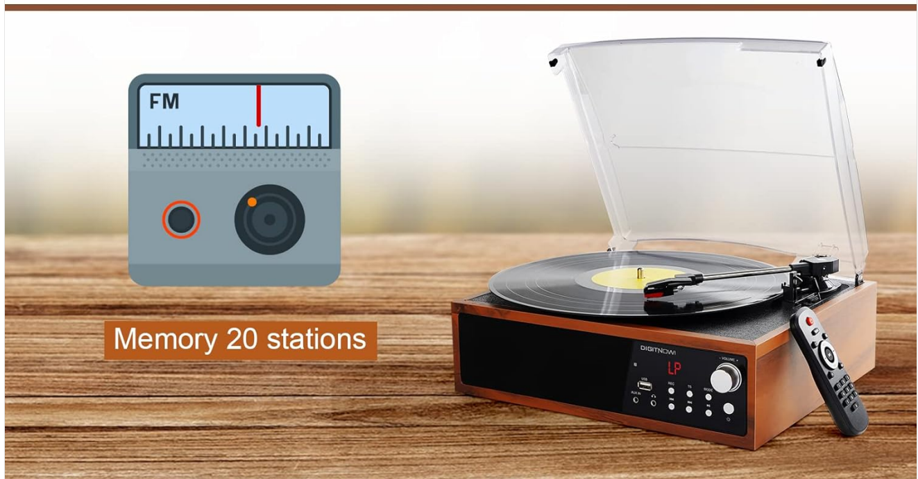
Figure 6.3.1: Convert your vinyl collection to MP3 digital files and store them on a USB drive.