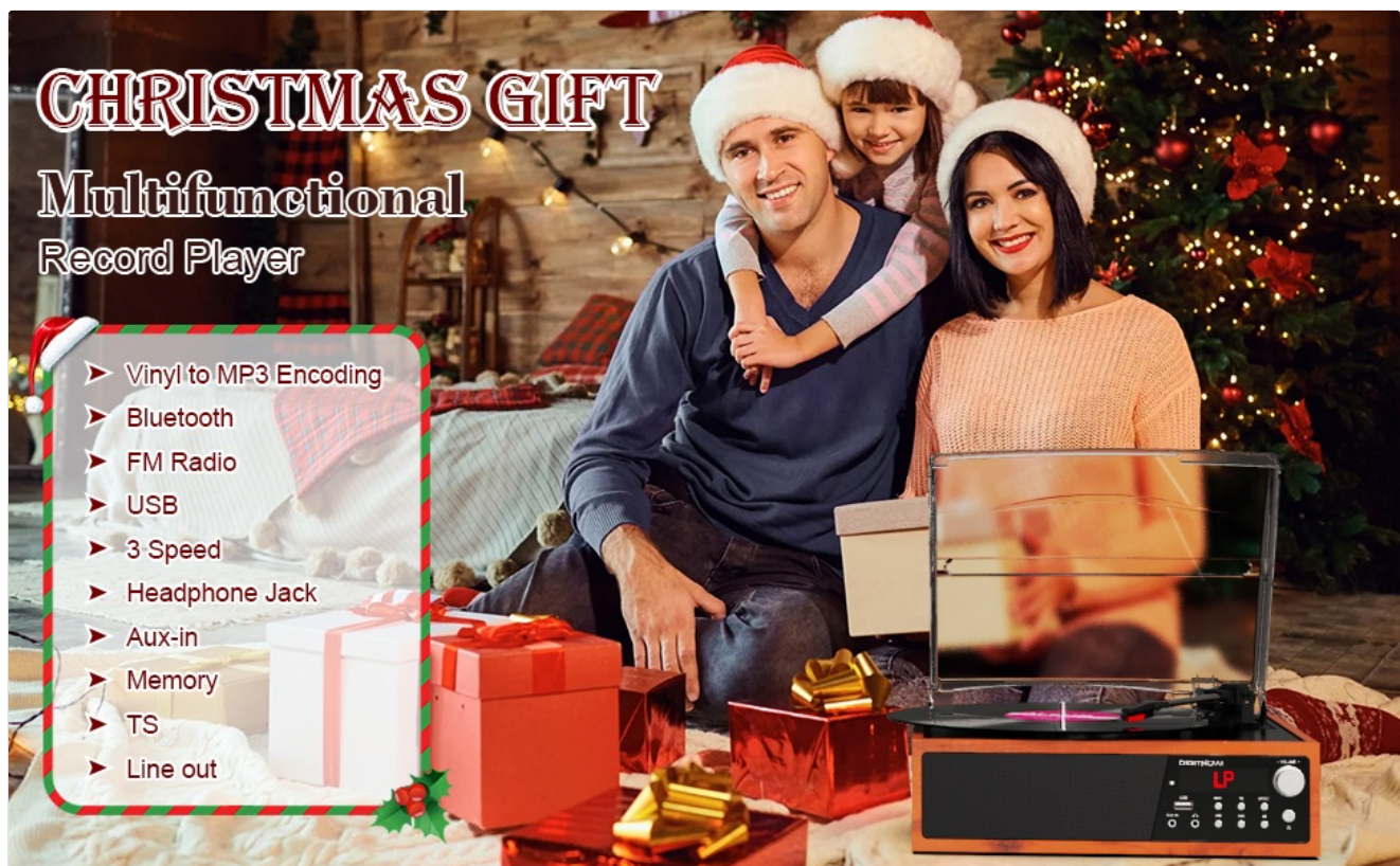
Figure 1.2: The DIGITNOW record player with its dust cover open, revealing the turntable and control panel.