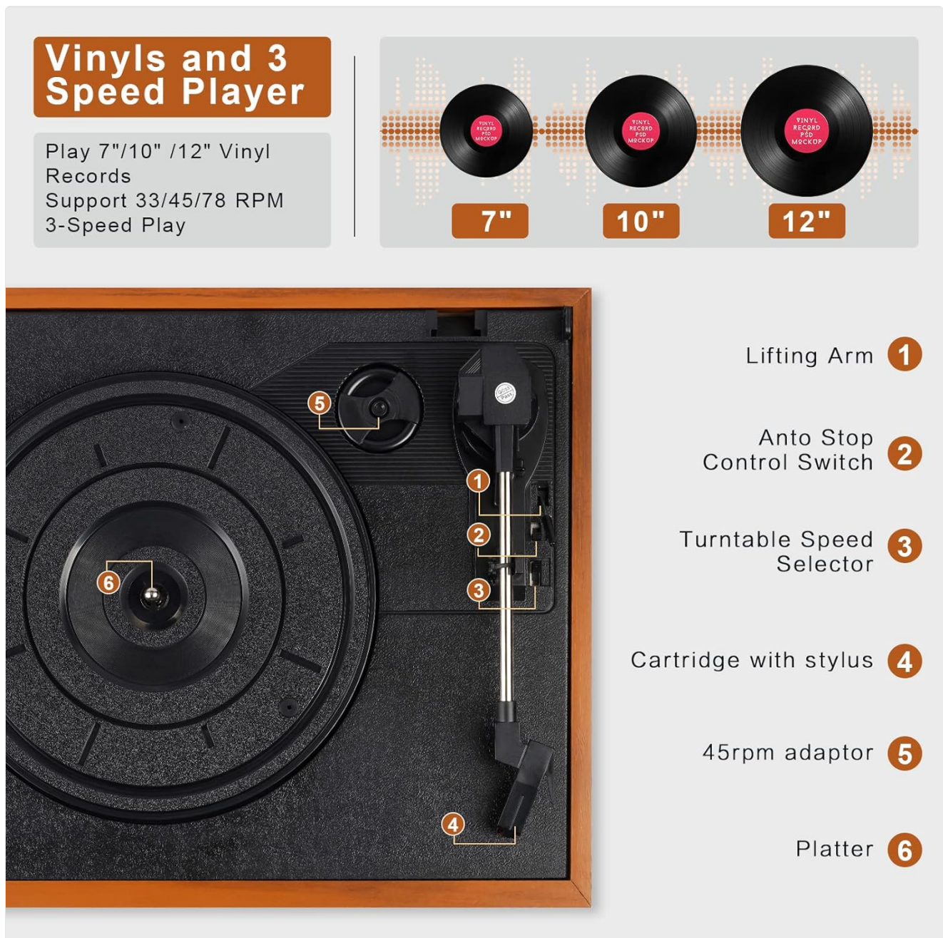
Figure 4.1: Top view diagram of the turntable components.

Familiarize yourself with the various parts of your record player: