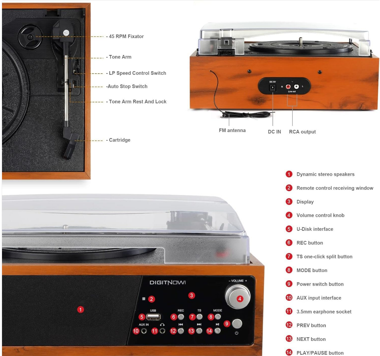
Figure 4.2: Front control panel of the record player.