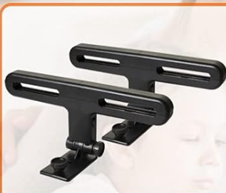
Mounting Bracket x2