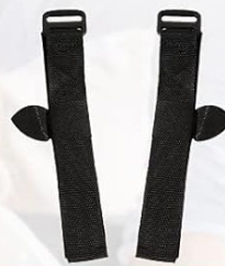
Headrest Straps x2