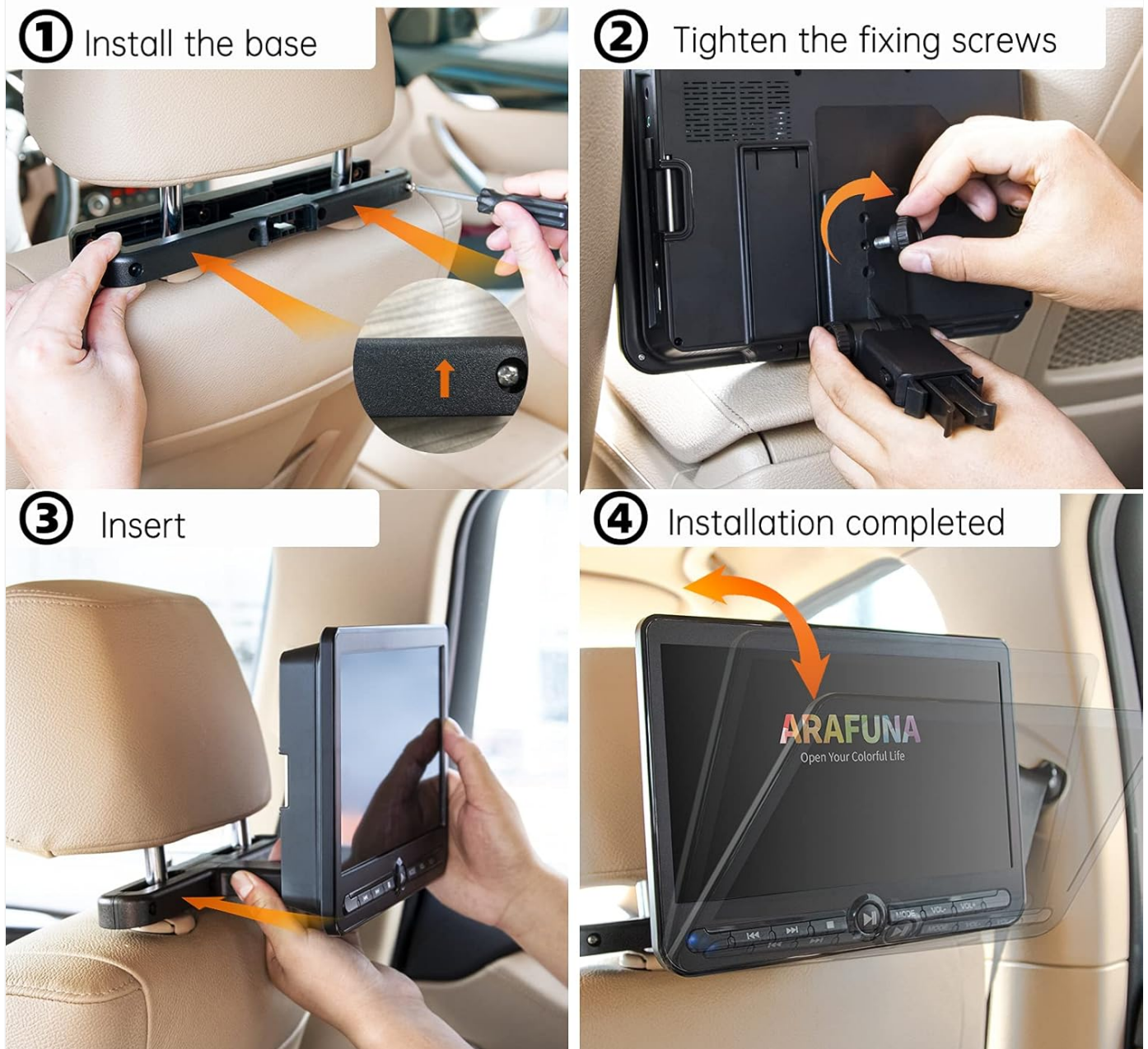
Figure 2: Step-by-step installation guide for the headrest mounting bracket.