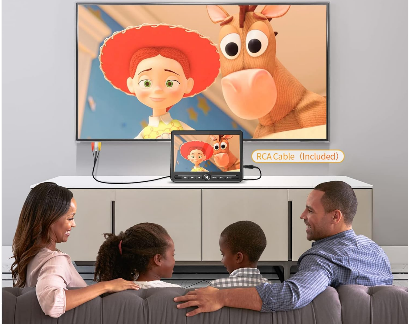
Figure 6: Connecting the portable DVD player to a TV using the RCA cable.