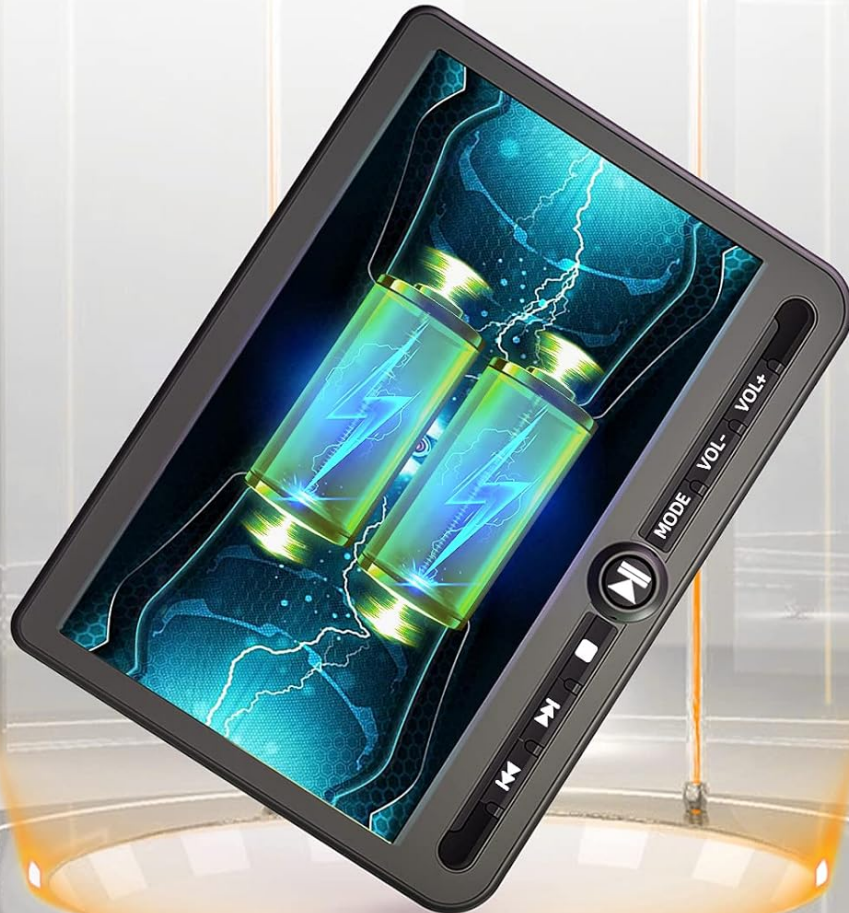
Figure 4: Power options including the 5000mAh battery, AC adapter, and car charger.