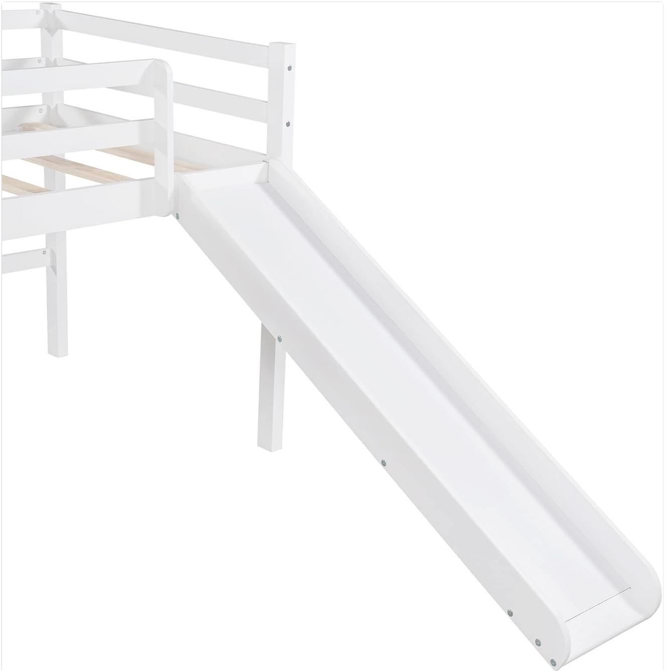
Image: Close-up of the white slide component, showing its smooth surface and attachment point to the loft bed frame.