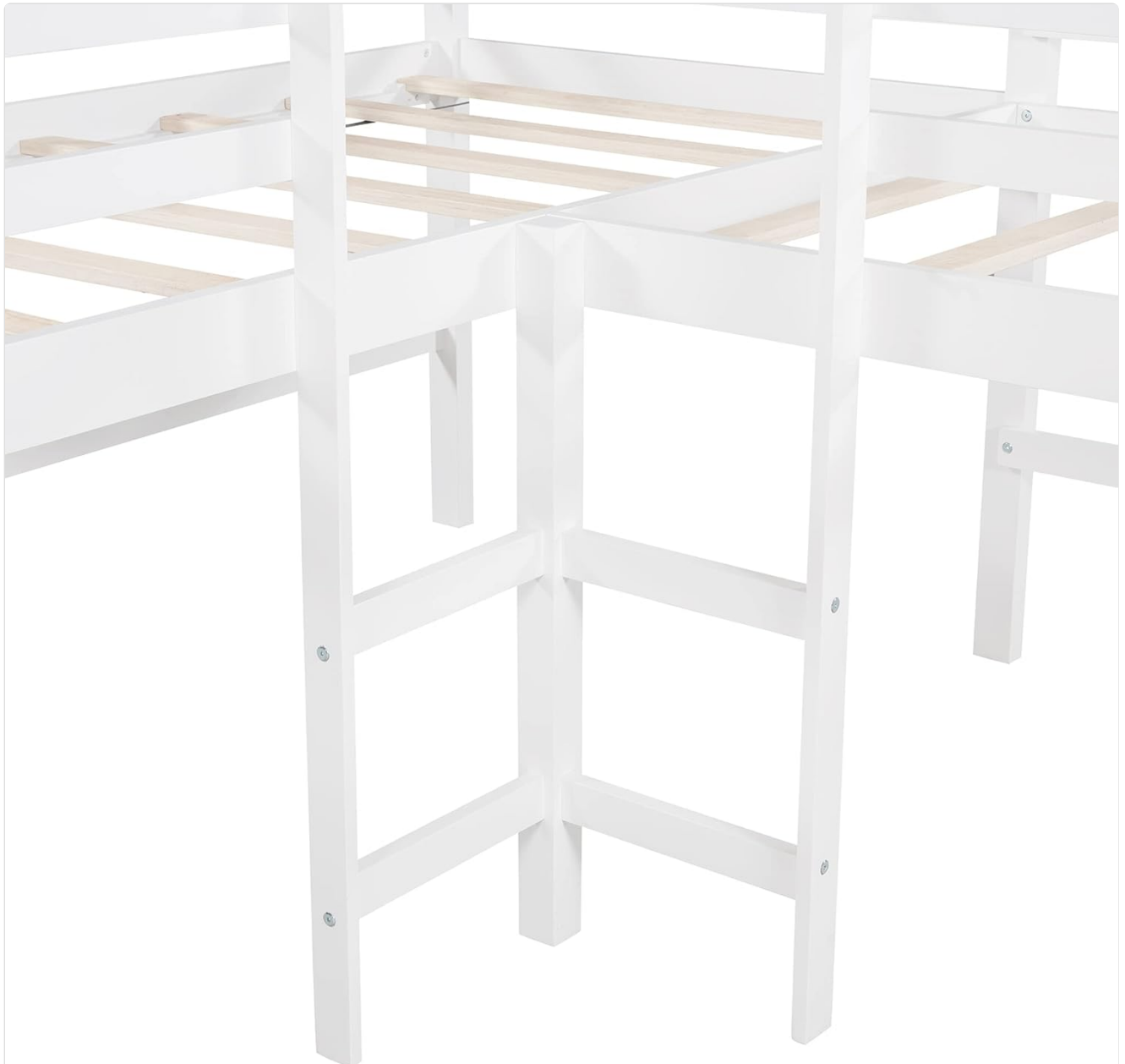
Image: Close-up of the integrated corner ladder, highlighting its sturdy construction and steps for safe access to the upper bed.