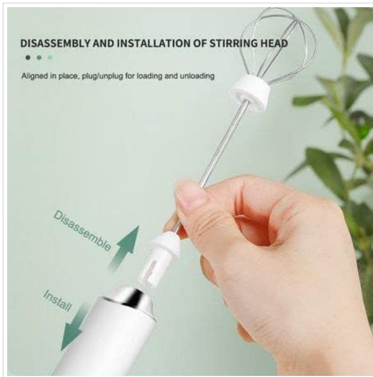
Image 4.1: Illustration demonstrating how to install and disassemble the whisk head by aligning and pushing/pulling it into the main unit.