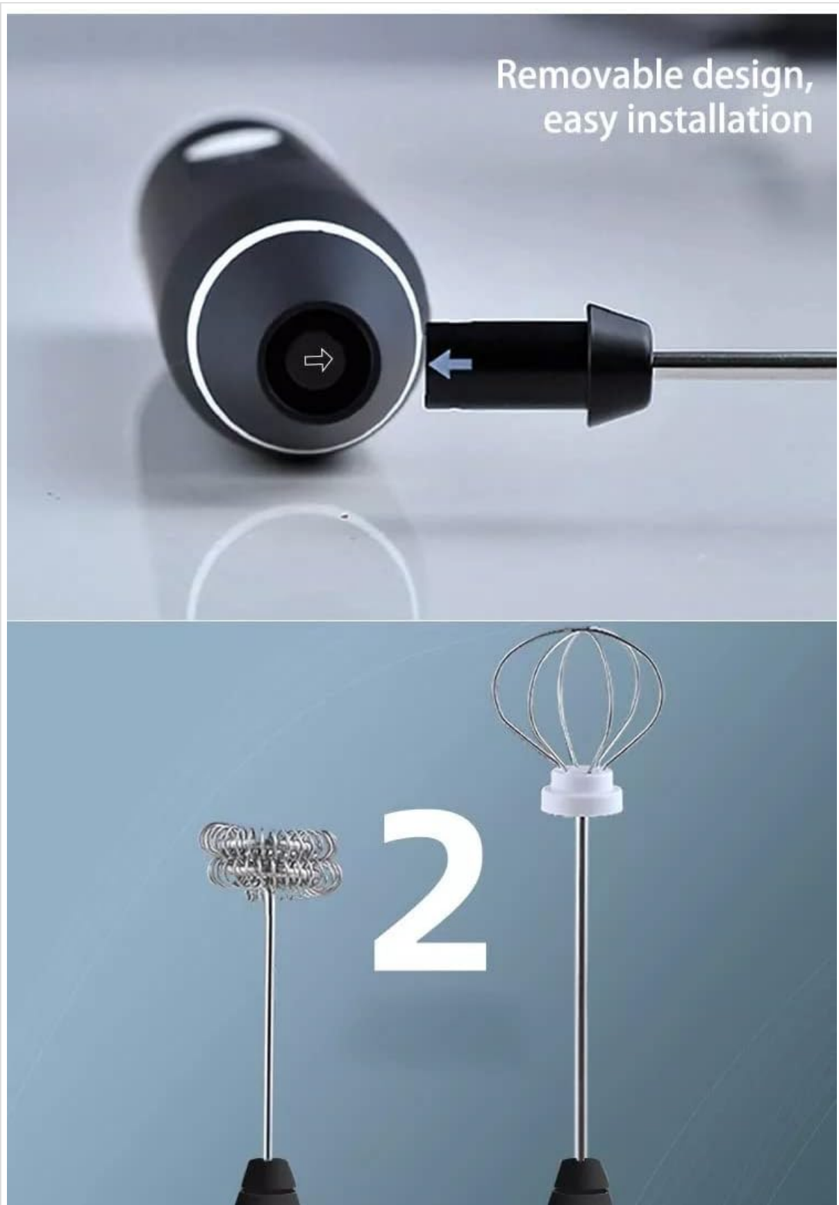
Image 4.2: Close-up view showing the removable design of the whisk attachment, highlighting the simple plug-in and pull-out mechanism for installation and removal.