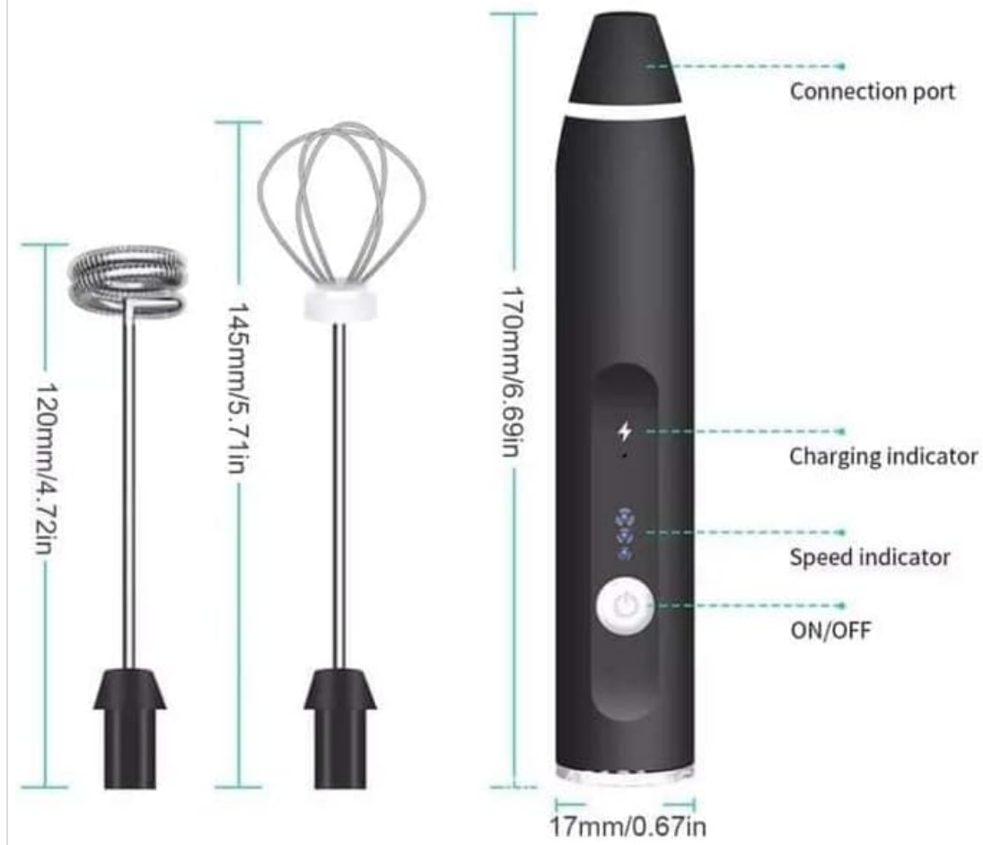
Image 3.2: Detailed diagram showing the dimensions of the frother and its whisks, along with labels for the connection port, charging indicator, speed indicator, and ON/OFF button.