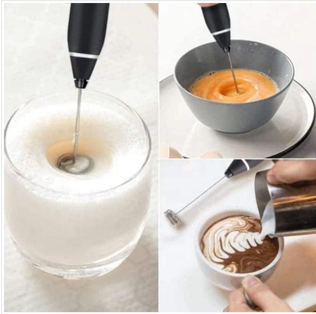
Image 5.2: A collage showing the frother in action: creating foam in a glass of milk, whisking eggs in a bowl, and assisting in pouring latte art, illustrating its practical applications.