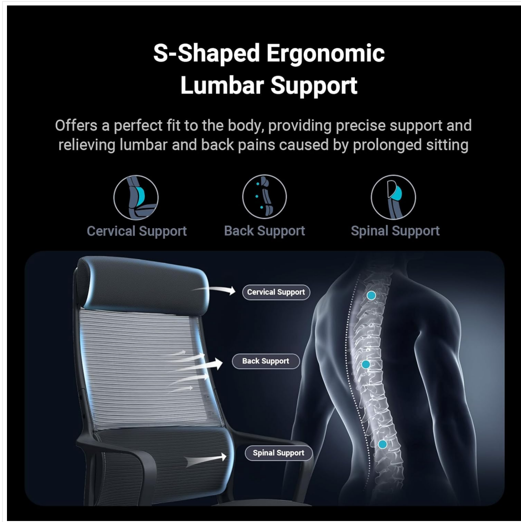
Figure 4: Detailed view of the S-shaped ergonomic design providing comprehensive back support.