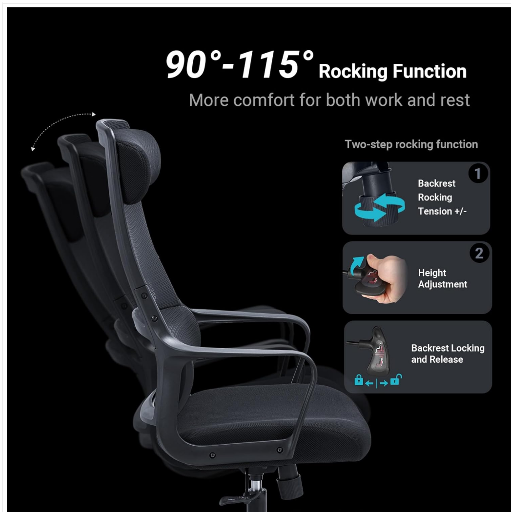
Figure 3: Visual guide to the chair's rocking function and height adjustment controls.