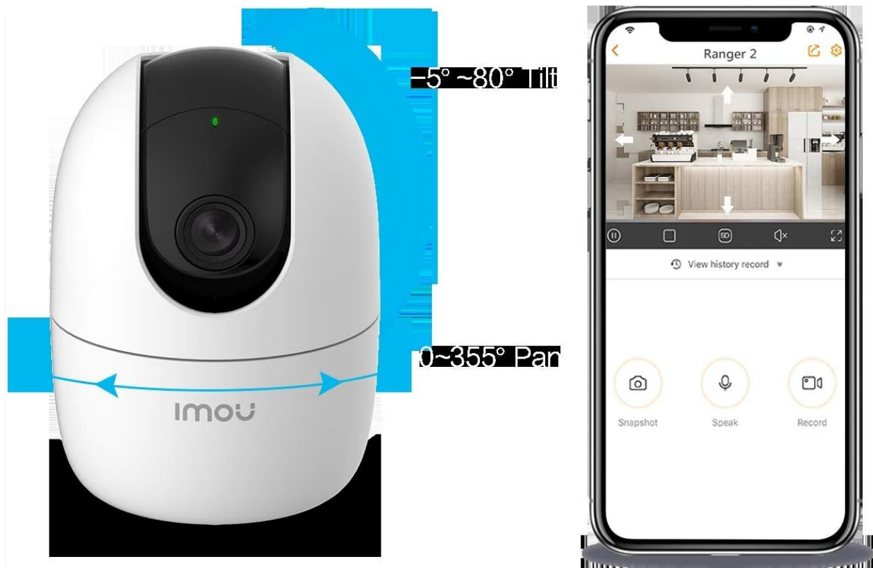
Image 5.1: Pan and tilt functionality controlled via the IMOU Life app.

From the IMOU Life app, select your camera to access the live view. You can control the camera's pan (horizontal) and tilt (vertical) movements directly from the app interface to adjust the viewing angle. The camera offers a 0-355° pan range and a -5° to 80° tilt range.