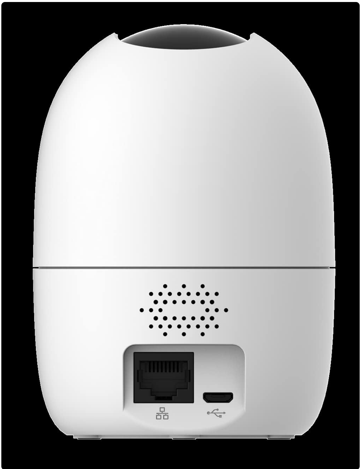
Image 1.1: The IMOU Ranger 2 camera, showcasing its compact and modern dome design.