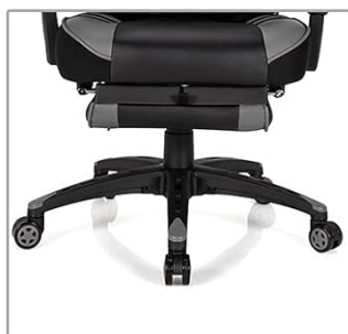
Stable 5-claw Base