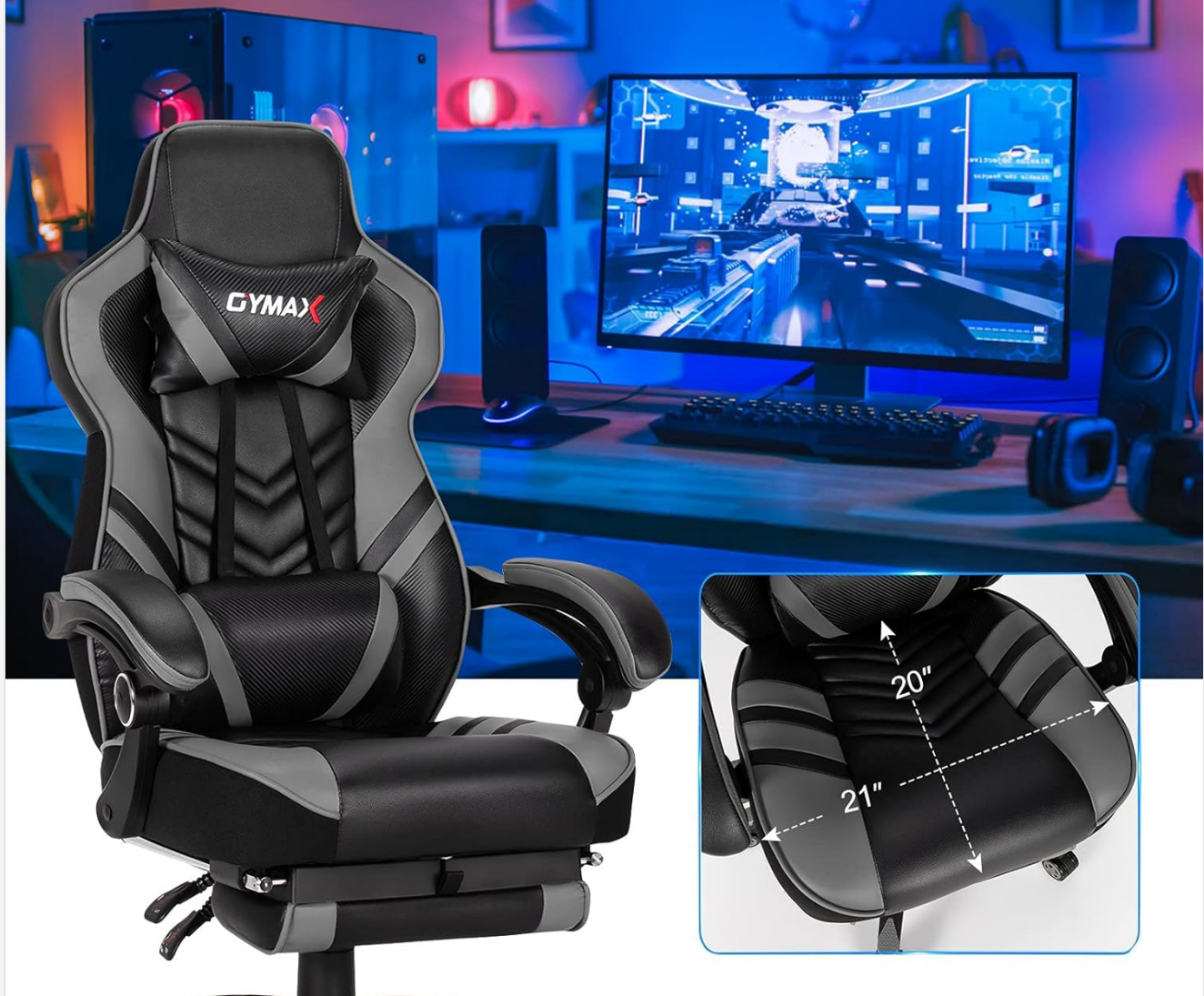
Figure 1: Product Details and Components. This image illustrates the key components of the chair, such as the adjustable headrest, comfy lumbar pillow, linkage armrests, thickened cushion, stable 5-claw base, and smooth rolling wheels, aiding in assembly identification.

Reduce fatigue and bring you an immersive gaming experience