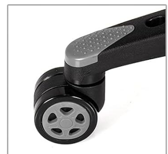
Smooth Rolling Wheels