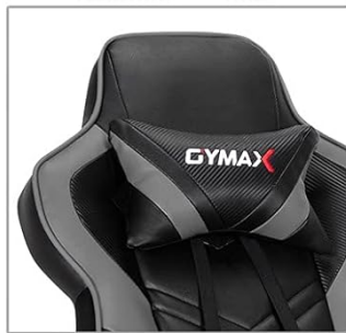
Adjustable & Soft Headrest