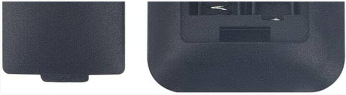
Figure 1: Rear view of the remote control with the battery compartment open, illustrating the correct orientation for AAA battery insertion.