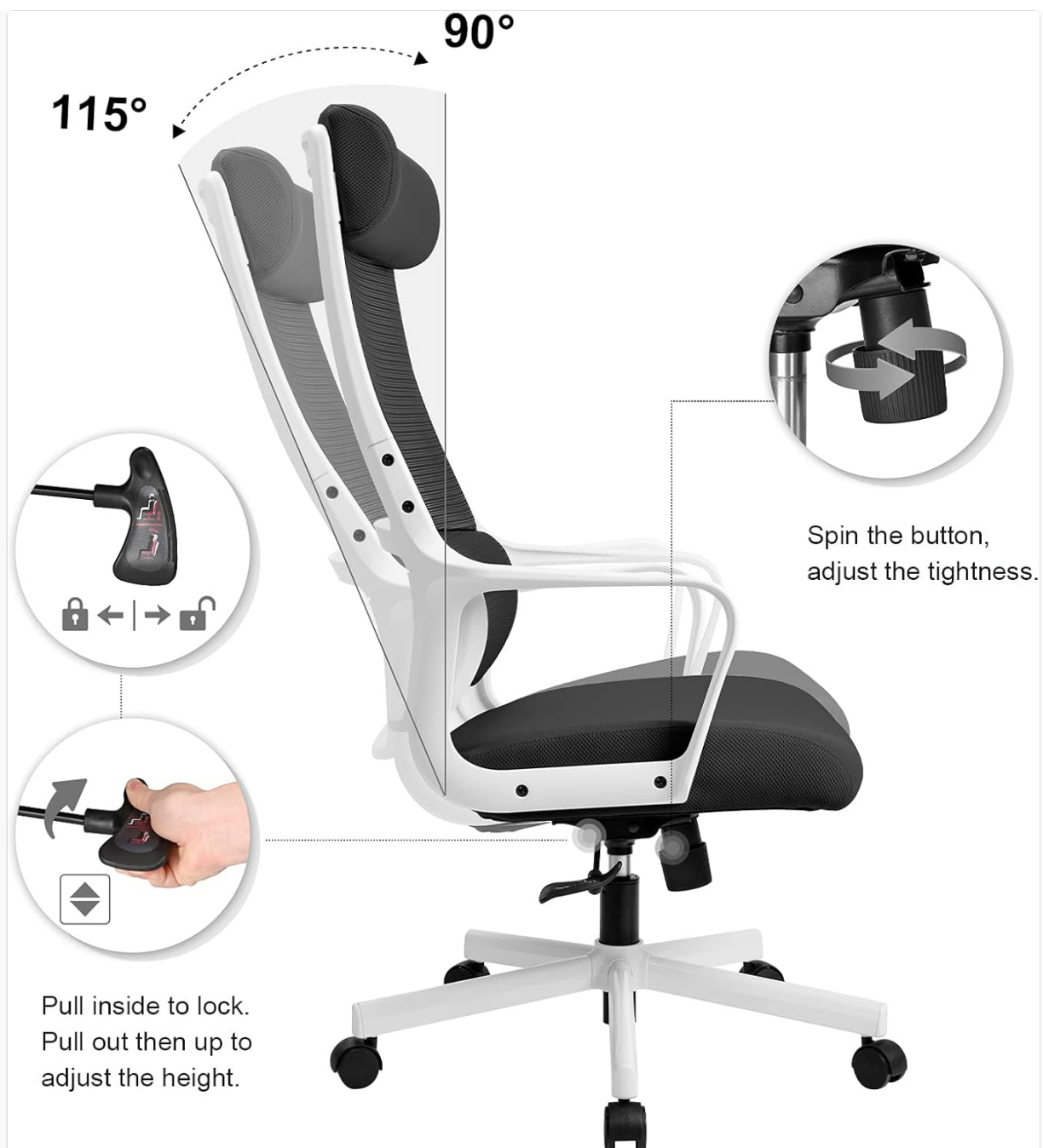
Image 5.1: Overview of key adjustable features including the headrest, lumbar support, seat cushion, and overall tilt and height adjustments.