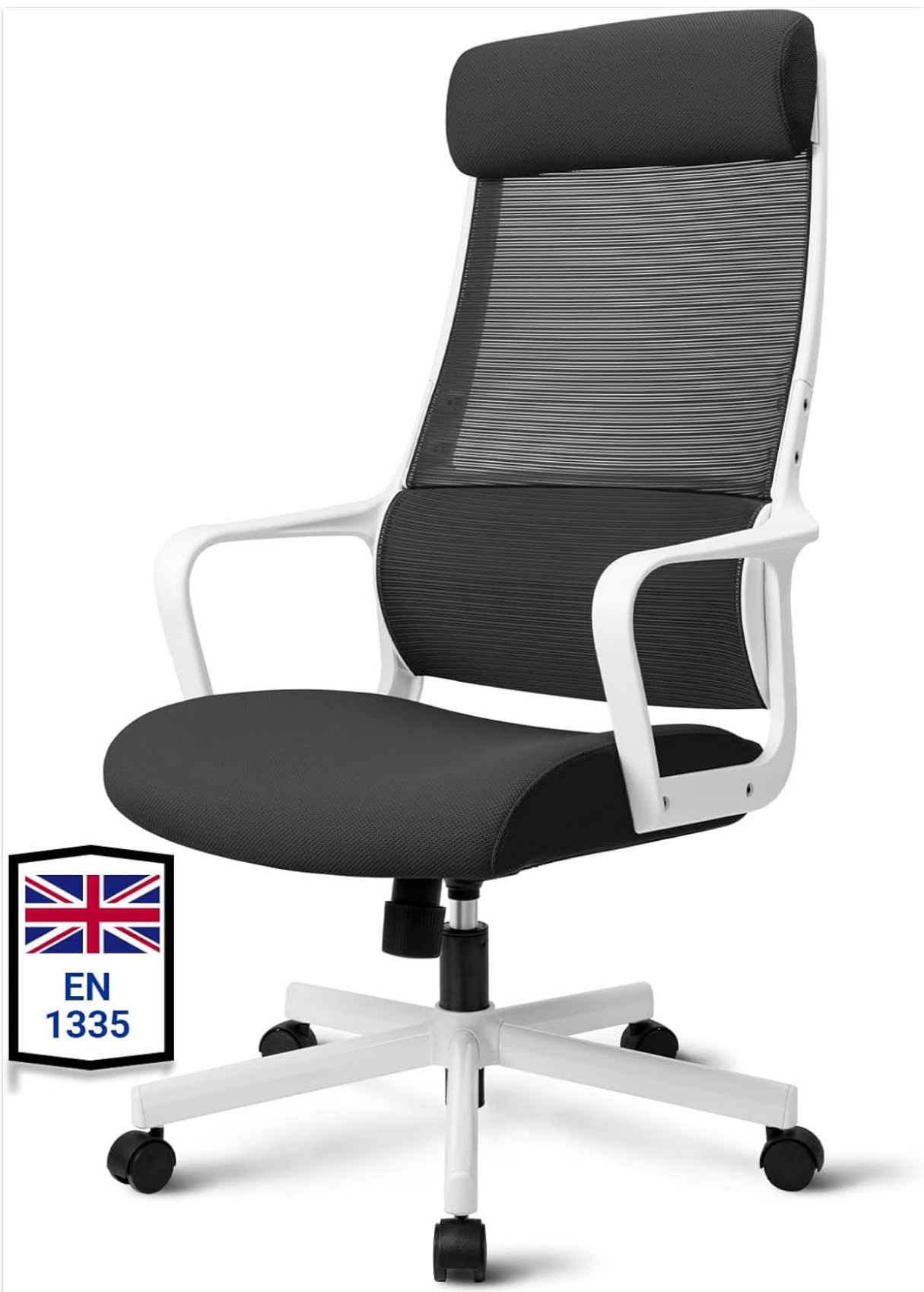
Image 1.1: The MELOKEA Ergonomic Office Chair, showcasing its black mesh back, black seat cushion, and white frame with a five-star base and casters.