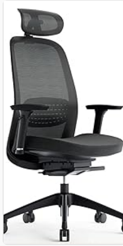
Image 5.3: The tilt tension knob, located beneath the seat, allows you to adjust the rocking resistance.