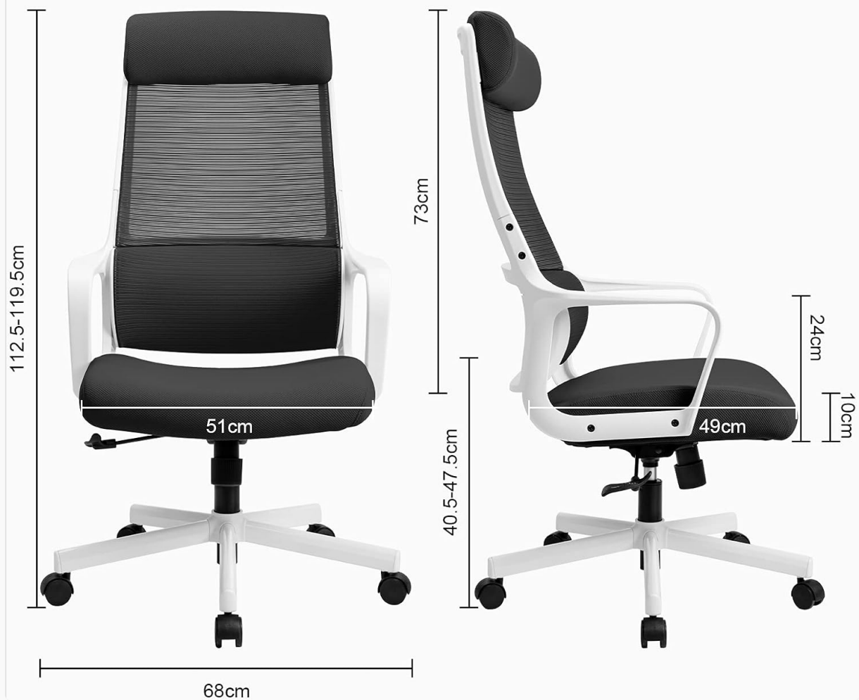
Image 5.5: This diagram highlights the ergonomic design of the chair, emphasizing the S-shaped lumbar support for spinal health.