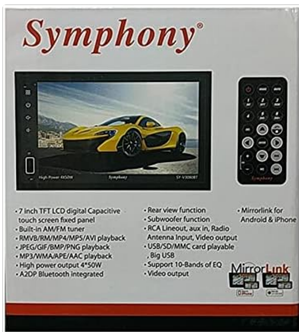
Image: The product packaging for the Symphony SY-V3080BT, highlighting key features such as 7-inch TFT LCD, AM/FM tuner, various playback formats, Bluetooth, and MirrorLink. A remote control is also visible.