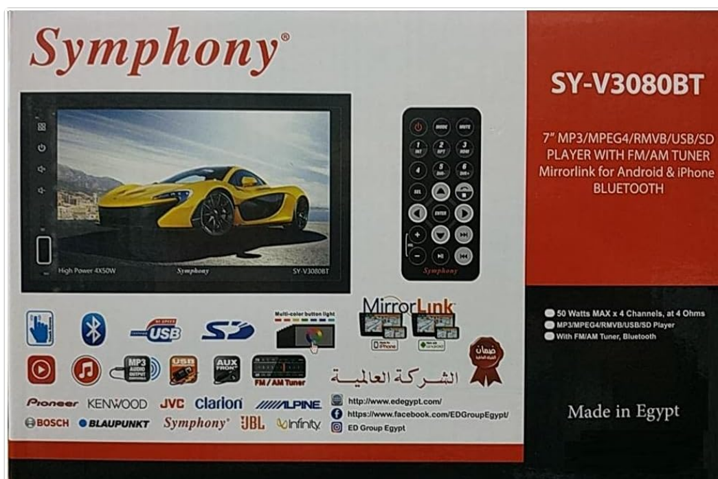
Image: Rear view of the Symphony SY-V3080BT car multimedia player, showing various input and output ports for power, speakers, antenna, and auxiliary connections.