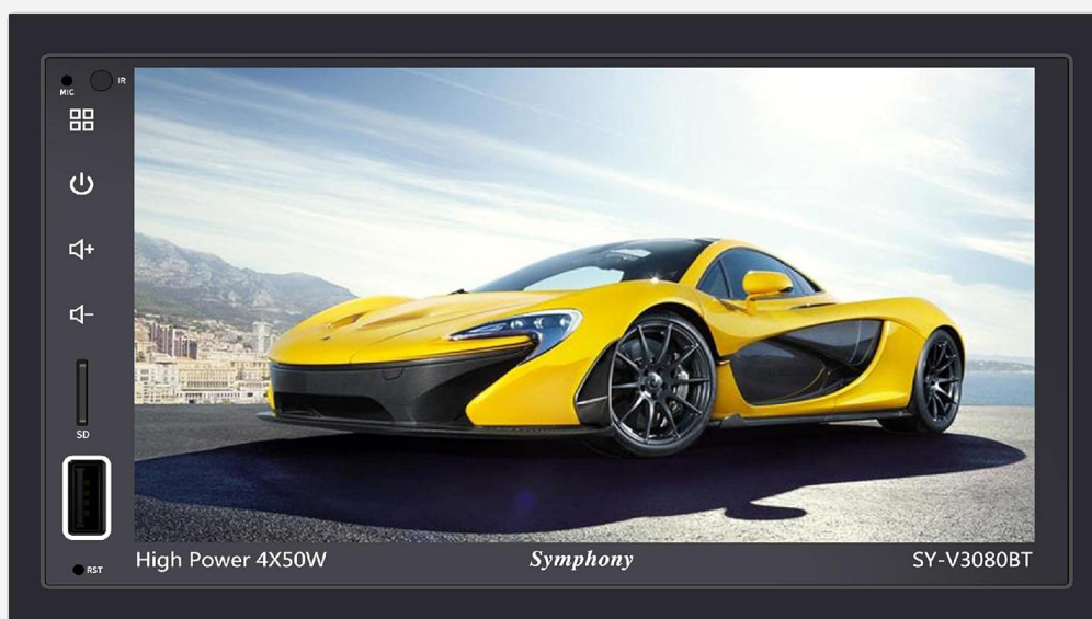
Image: Front view of the Symphony SY-V3080BT car multimedia player, displaying a car on its 7.2-inch touch screen. The unit features control buttons on the left side and a USB port.