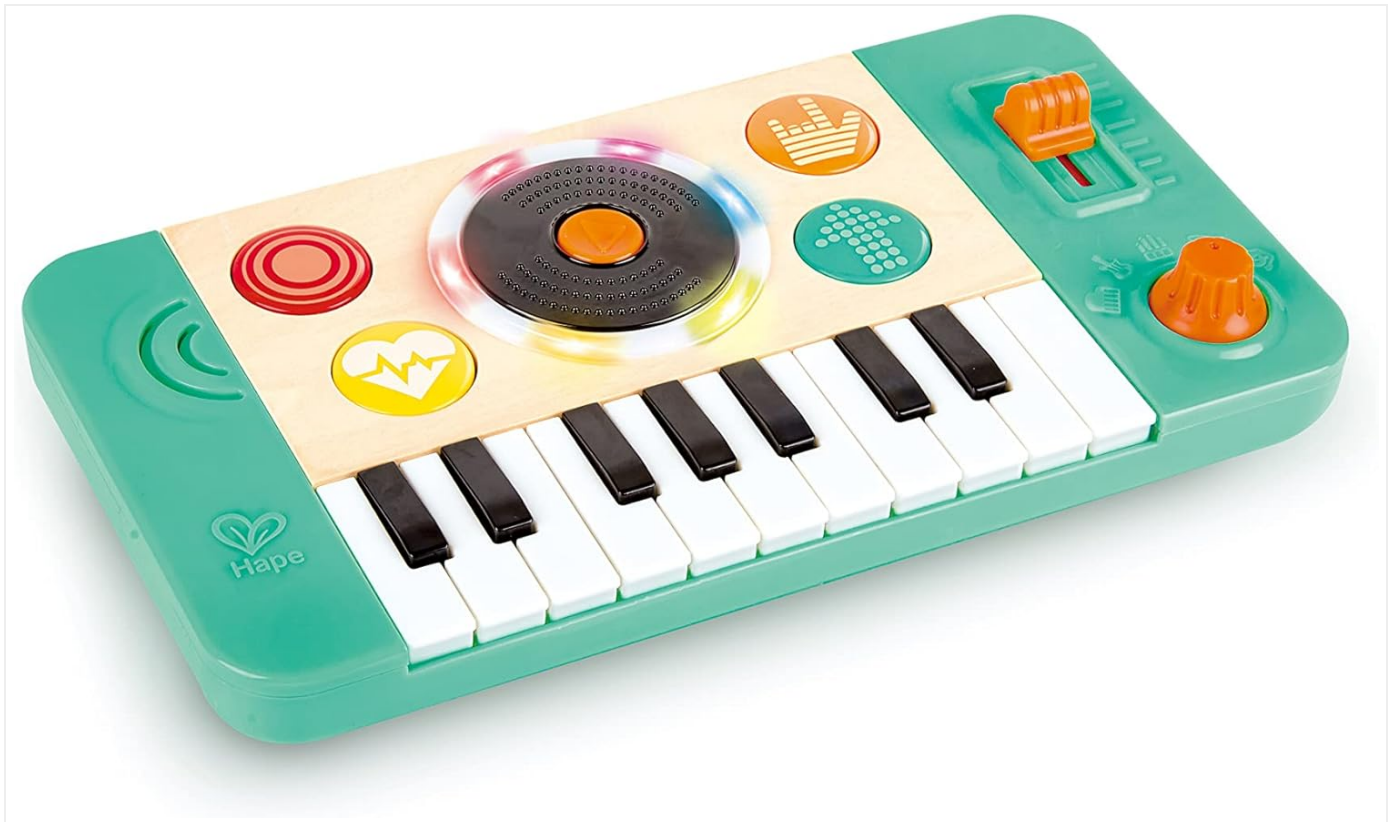
Image: The Hape DJ Mix & Spin Studio Musical Toy in blue, showcasing its compact design and various interactive elements.

This manual provides essential information for the safe and effective use of your Hape DJ Mix & Spin Studio Musical Toy. Please read it thoroughly before use and retain it for future reference.