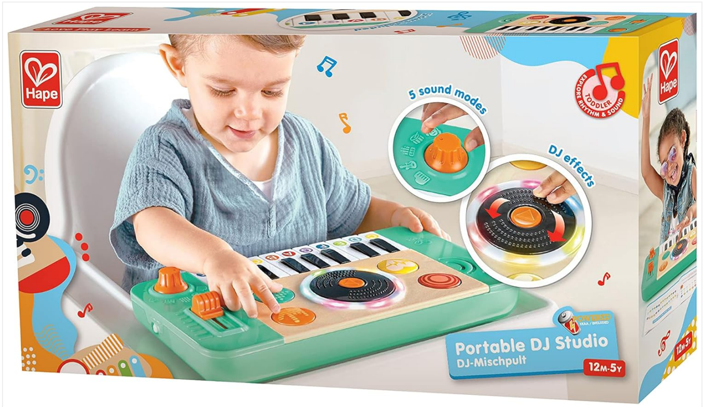
Image: The retail packaging for the Hape DJ Mix & Spin Studio, indicating the product contents.