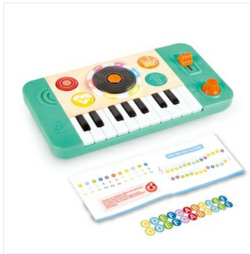
Image: The Hape DJ Mix & Spin Studio shown with its accompanying songbook and key stickers, which can be applied to the piano keys for learning.