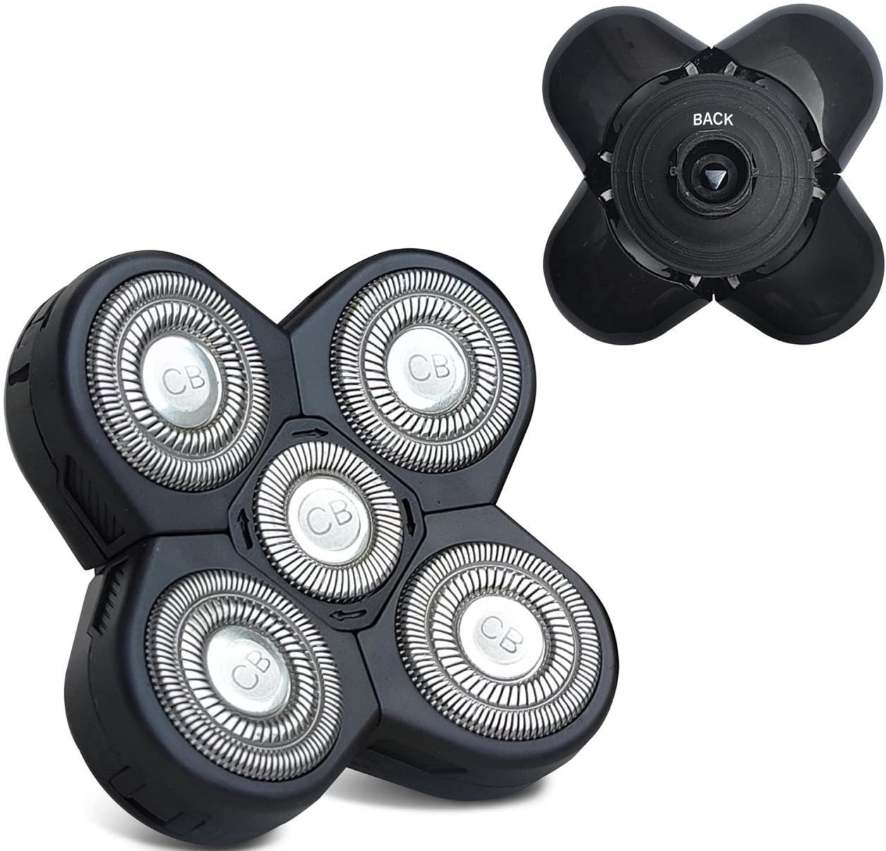
The Bald Buddy 5-Blade Replacement Shaving Head, designed for a close and comfortable shave.