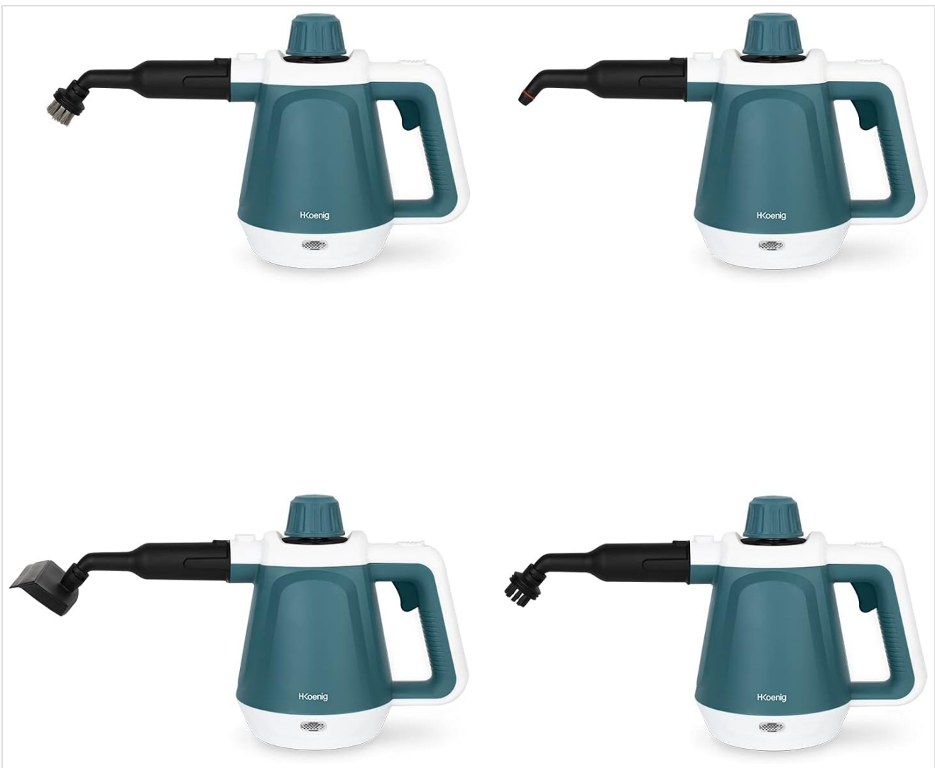
Image: Close-up view of the different nozzles and brushes that can be attached to the steam cleaner for various cleaning tasks.