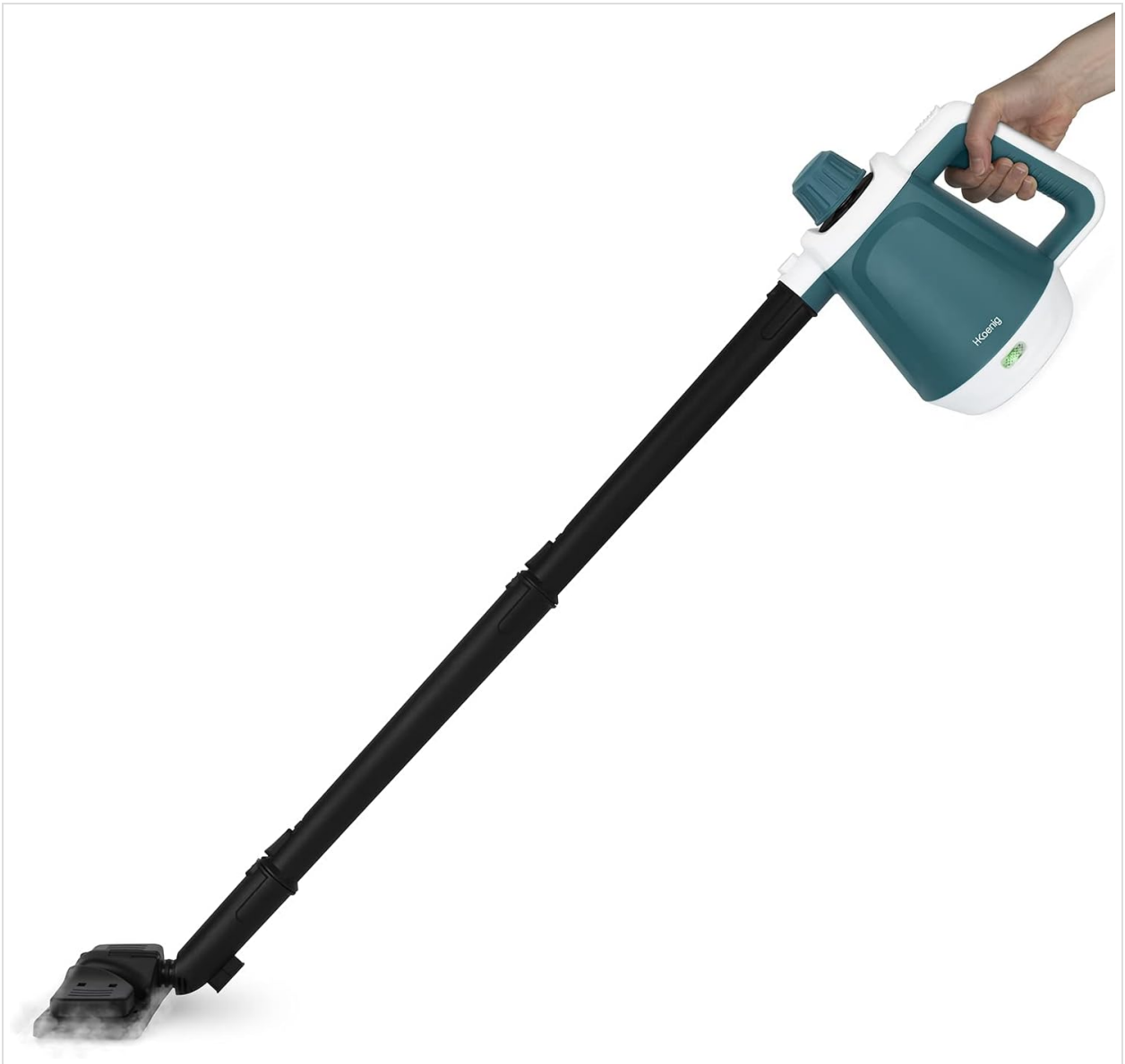
Image: The steam cleaner assembled with extension tubes and the floor cleaning attachment.