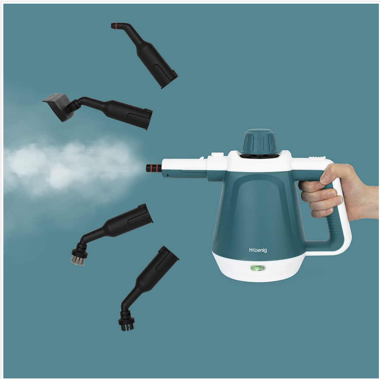
Image: The handheld steam cleaner in operation, demonstrating steam output with different nozzle attachments.