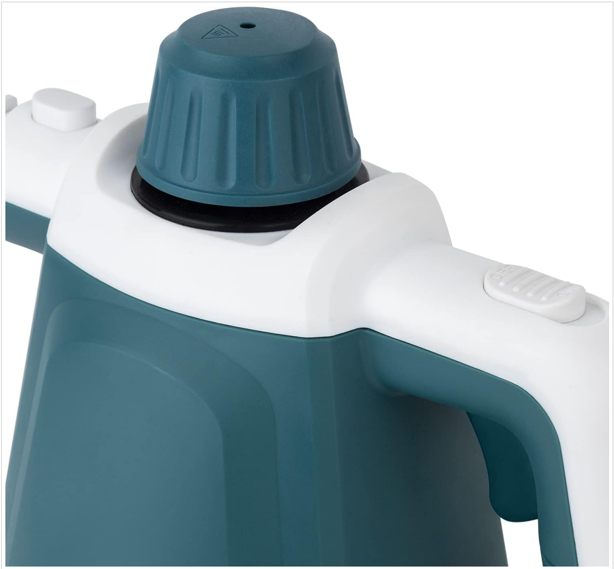
Image: Detail of the water tank cap, indicating where to fill the water.