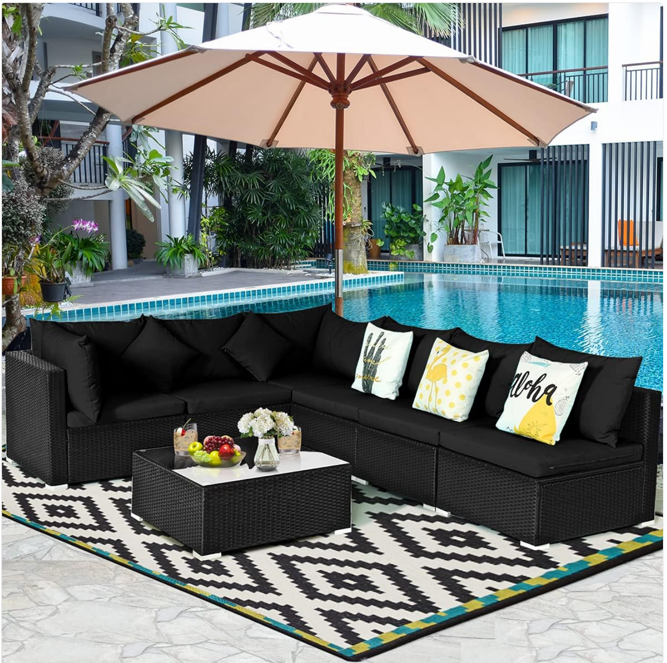
A complete view of the Tangkula 7 Piece Patio Furniture Set, featuring a black wicker sectional sofa with black cushions, a coffee table, and decorative pillows, arranged on an outdoor patio with an umbrella and pool in the background.