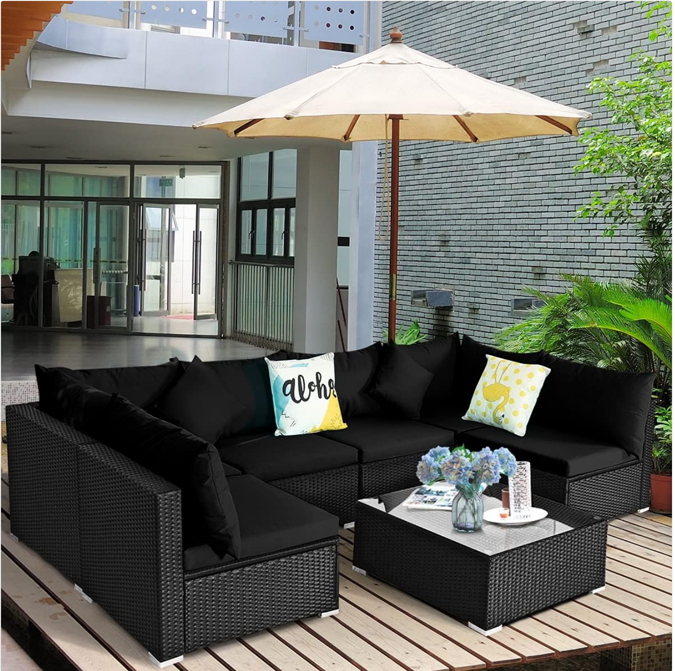
The Tangkula 7 Piece Patio Furniture Set with black cushions and a coffee table, positioned on a wooden deck in an outdoor setting, demonstrating its aesthetic appeal.