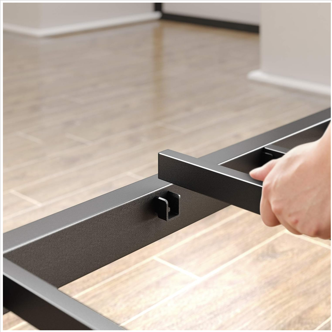
Figure 5: Installing a metal slat.