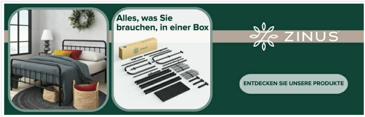
Figure 2: All components included in the package.