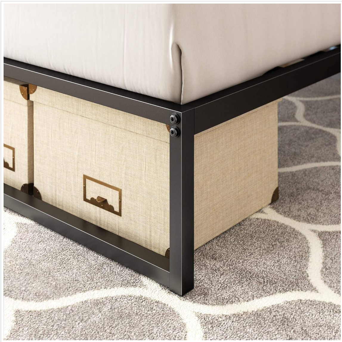
Figure 6: Example of under-bed storage utilization.