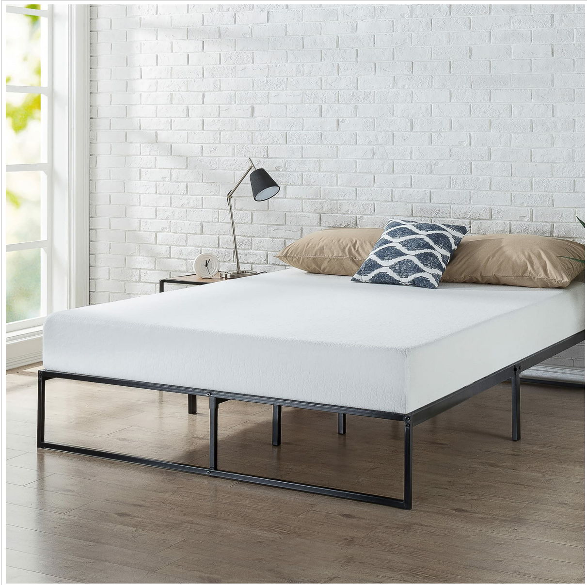
Figure 1: Zinus Lorelai Metal Bed Frame.