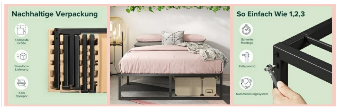
Figure 3: Visual guide for quick assembly steps.