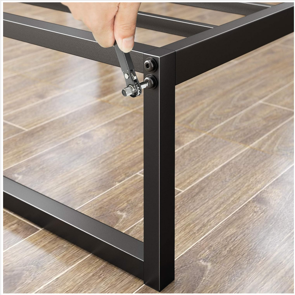
Figure 4: Tightening a bolt on the bed frame.