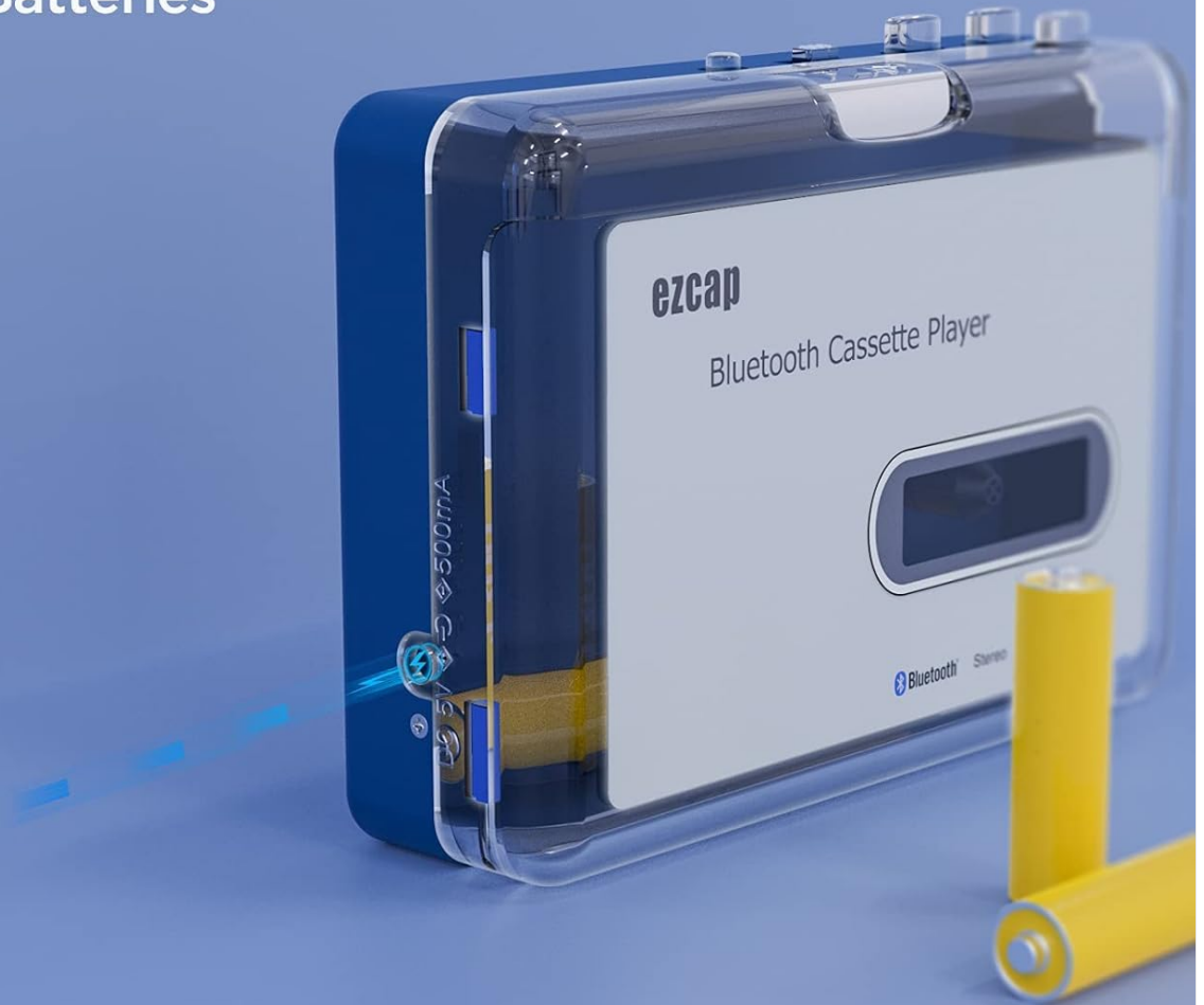
Image: Illustration of the two power options for the cassette player: using a DC adapter connected via USB cable or inserting two AA batteries.