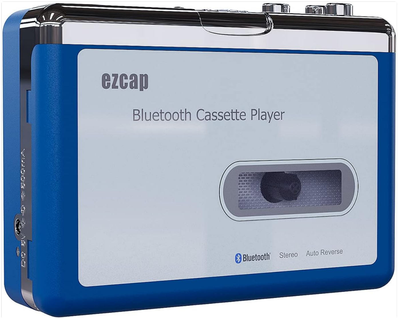
Image: Front view of the Ezcap Bluetooth Cassette Player, highlighting its compact design and the transparent window for viewing the cassette tape.