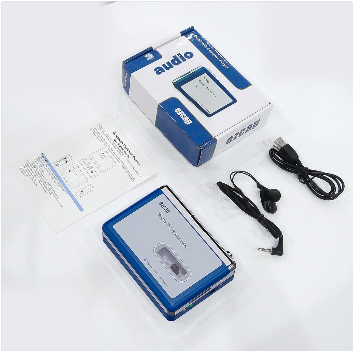
Image: Contents of the Ezcap Bluetooth Cassette Player package, showing the player, wired earbuds, a USB power cable, and the instruction manual.