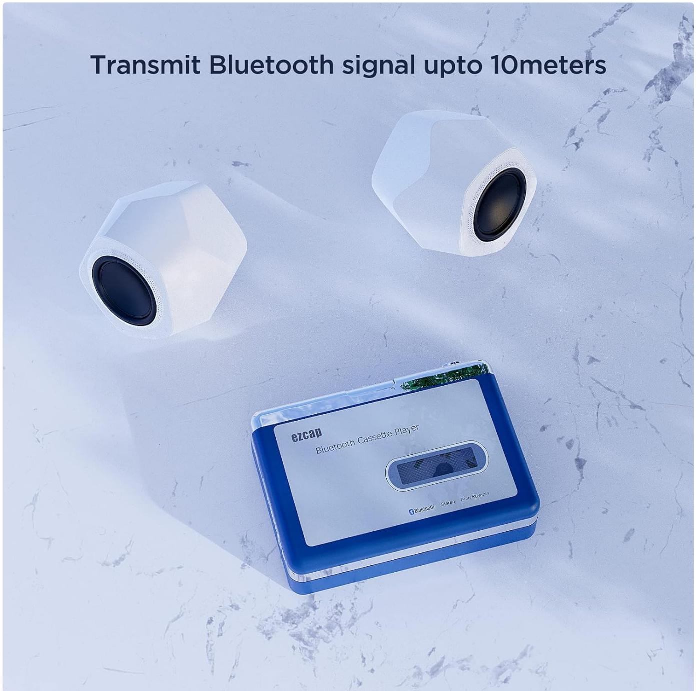
Image: The cassette player wirelessly transmitting audio to two Bluetooth speakers, illustrating its capability to send audio signals up to 10 meters.