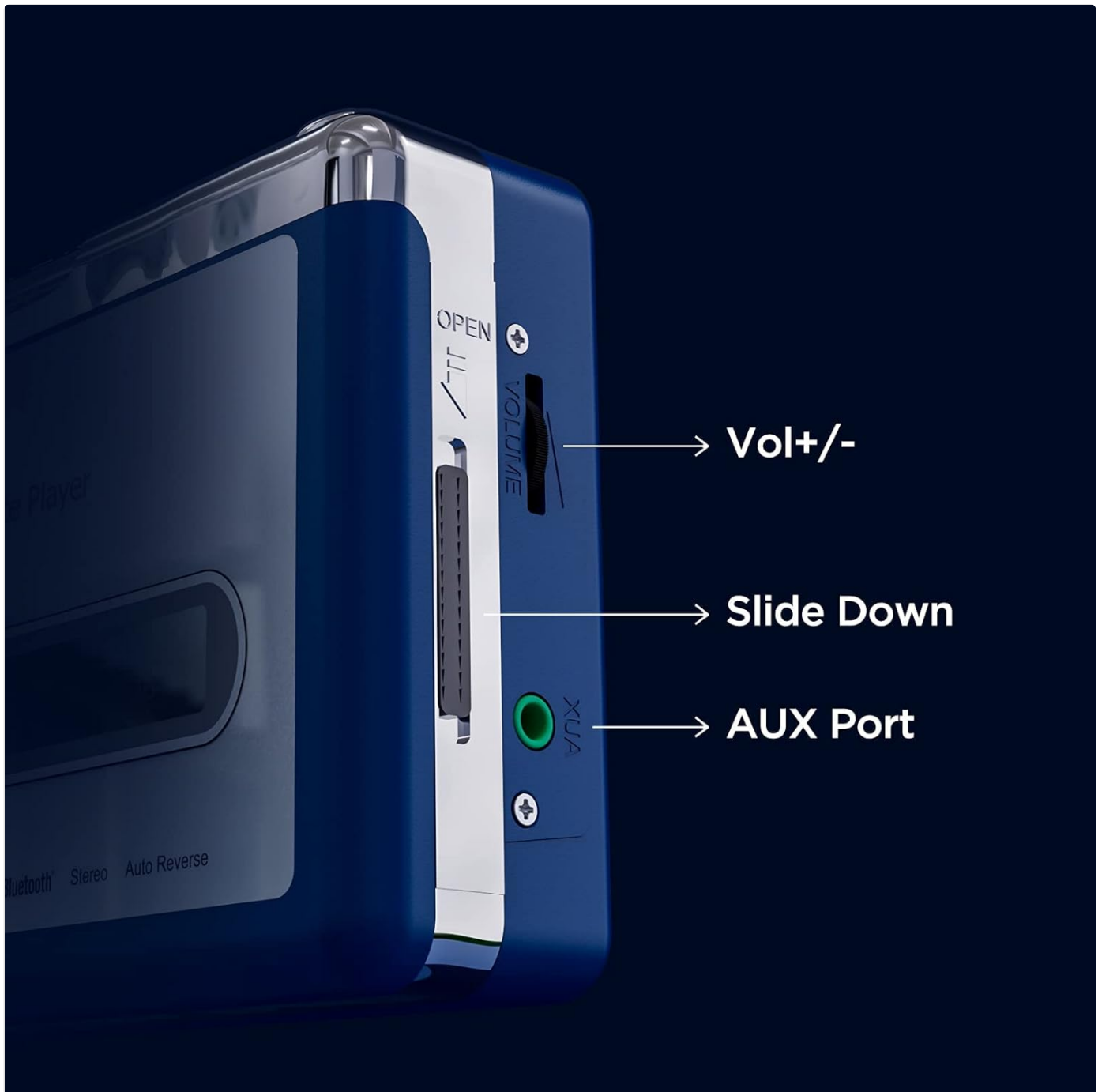
Image: Side view of the cassette player, indicating the location of the volume control dial, the slide-down mechanism to open the cassette compartment, and the 3.5mm AUX port for headphones or external speakers.