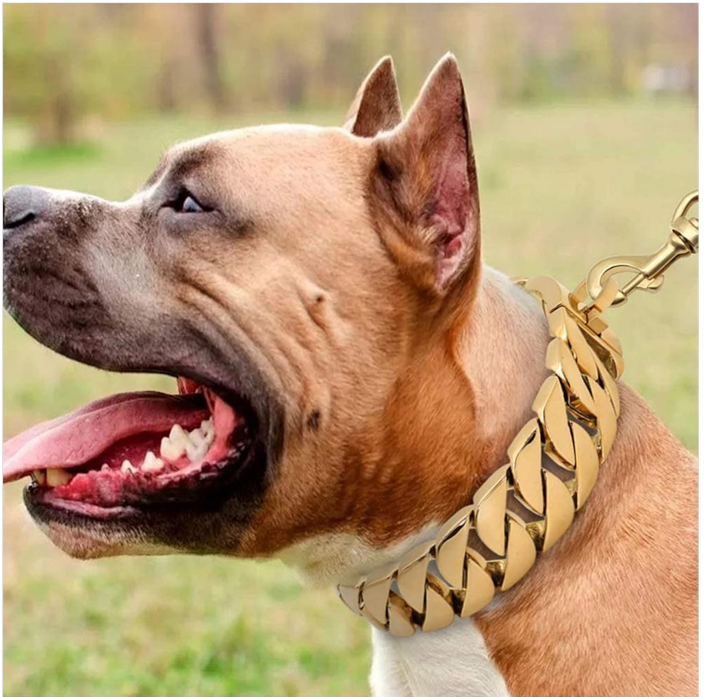
Image 5.2: A dog demonstrating the collar in use with a leash attached.