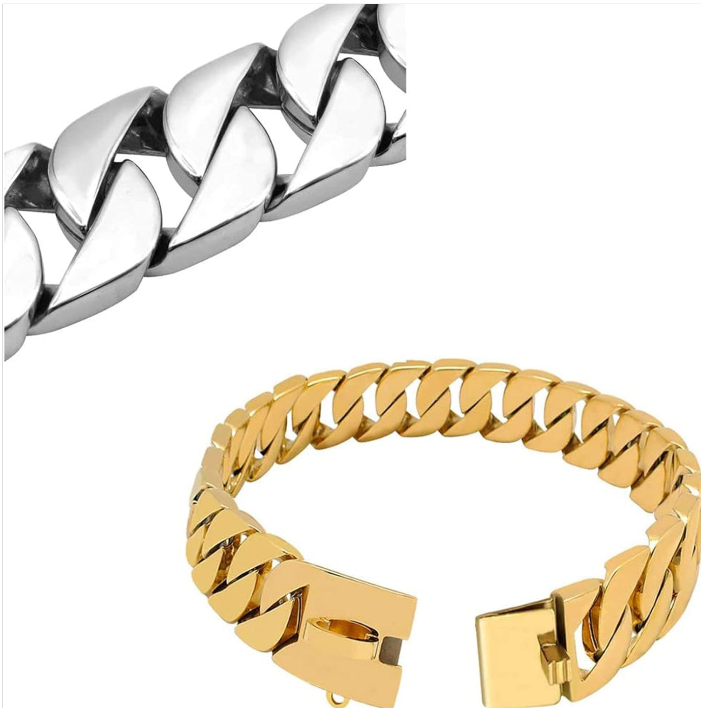
Image 6.1: Close-up of the stainless steel chain links, highlighting the material quality.