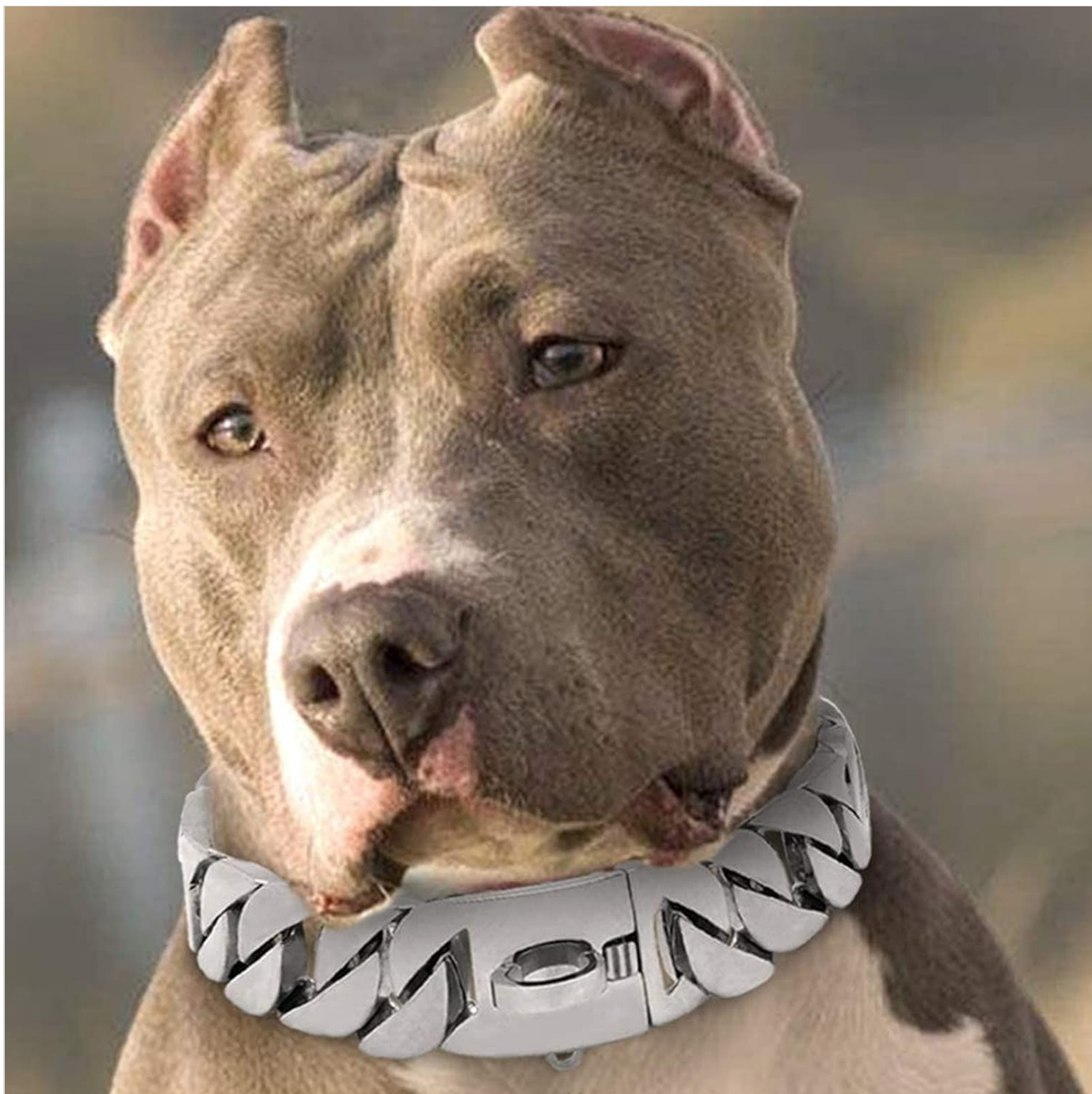
Image 1.2: A dog wearing the silver EMPESTAR collar, demonstrating its appearance when worn.