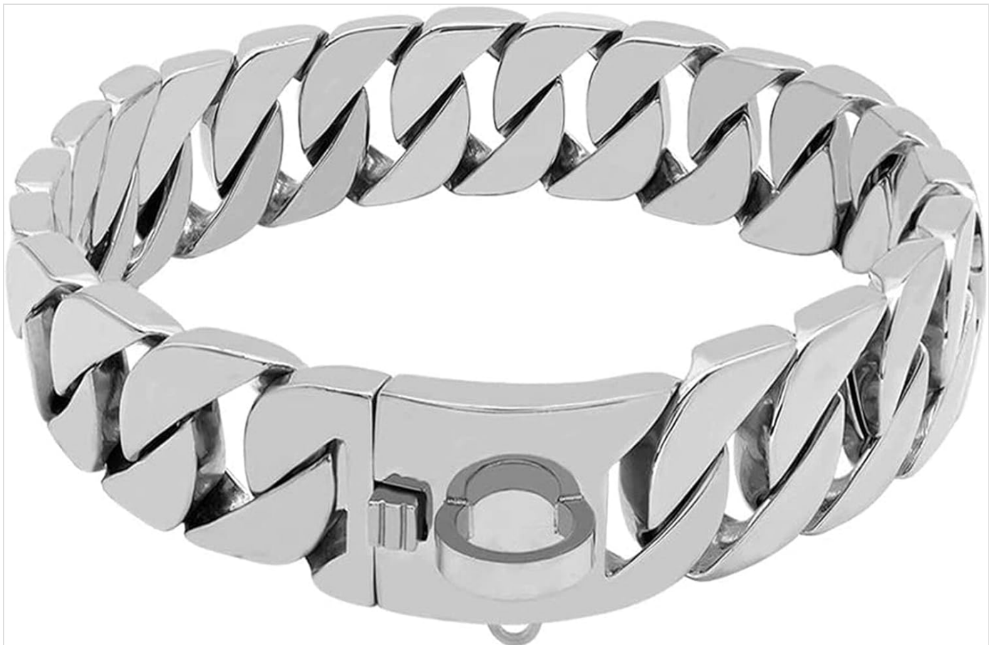
Image 1.1: The EMPERSTAR Heavy Duty 32mm Wide Stainless Steel Dog Collar in Silver.

Thank you for choosing the EMPERSTAR Heavy Duty 32mm Wide Stainless Steel Dog Collar. This collar is designed for strength and durability, featuring a stainless steel construction and a secure safety lock mechanism. This manual provides essential information for the proper setup, operation, and maintenance of your dog collar to ensure its effective and safe use.