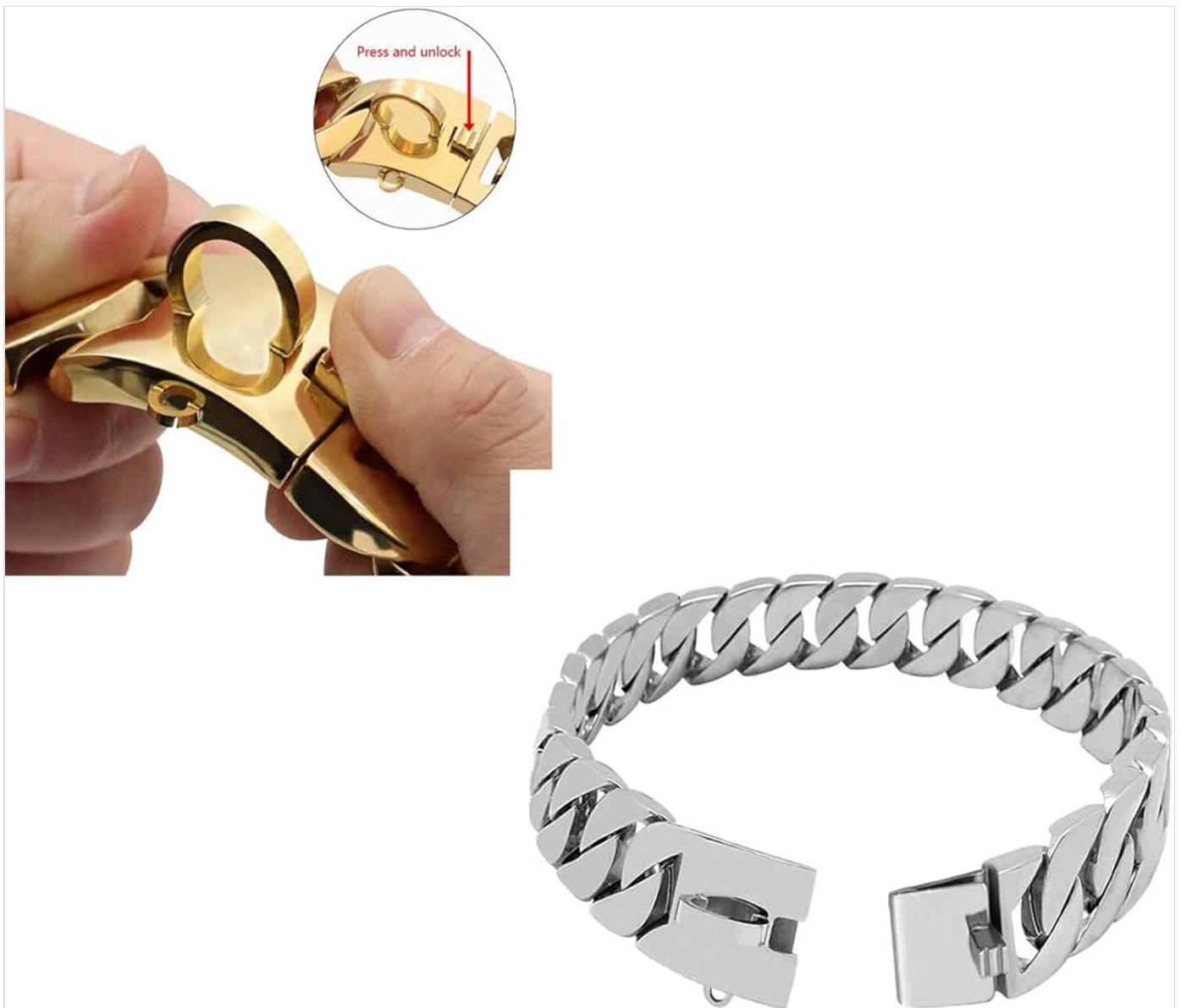
Image 5.1: Illustration of the safety lock mechanism, showing how to press to unlock.