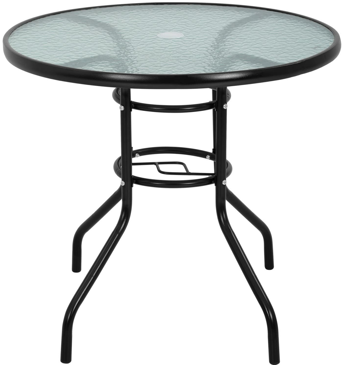
Image 1.1: The FDW 32-inch Round Outdoor Patio Dining Table, showcasing its design suitable for outdoor spaces.