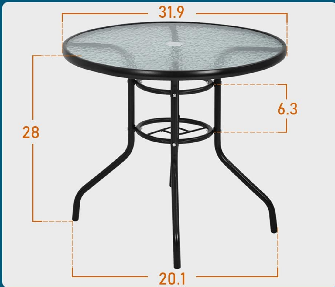
Image 4.2: Detailed dimensions of the table, including height and diameter.