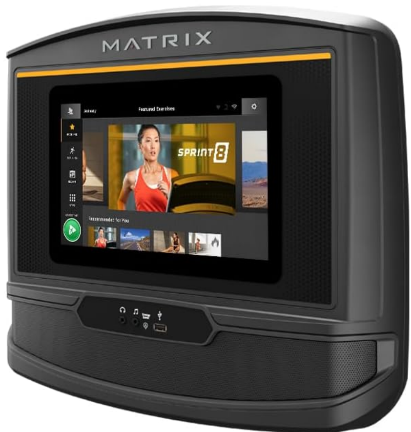
Figure 5: The XER Console, highlighting its 10-inch touchscreen and integrated apps for entertainment and diverse workouts.