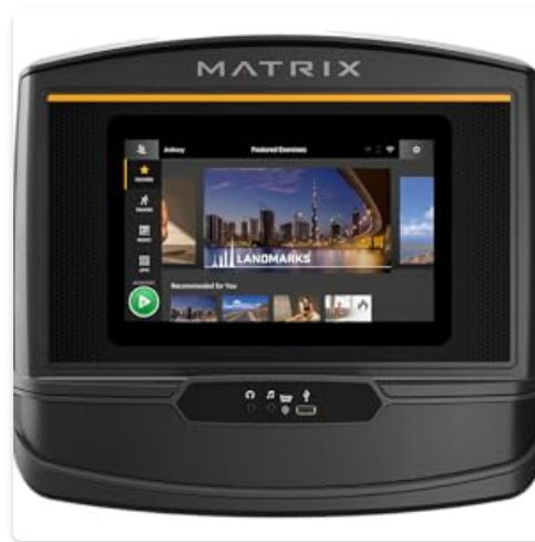
Figure 7: The XER Console displaying a virtual active scenic route, enhancing the immersive workout experience.