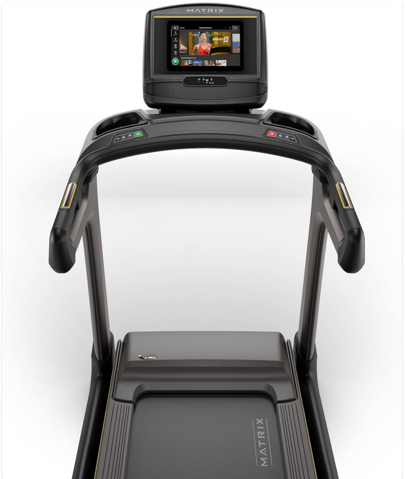
Figure 2: Close-up of the XER Console, highlighting the emergency stop button and safety key attachment point.