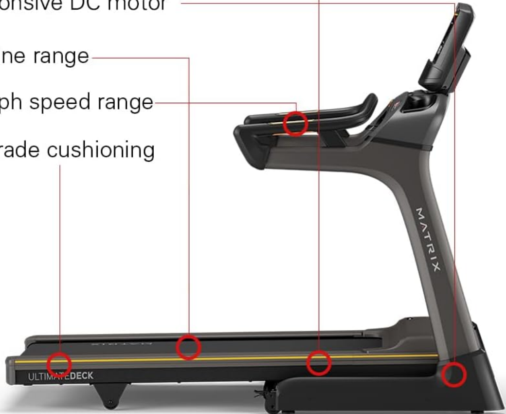
Figure 3: Diagram illustrating key features of the TF30 Treadmill, including its folding design, running surface, motor, incline, speed, and cushioning.