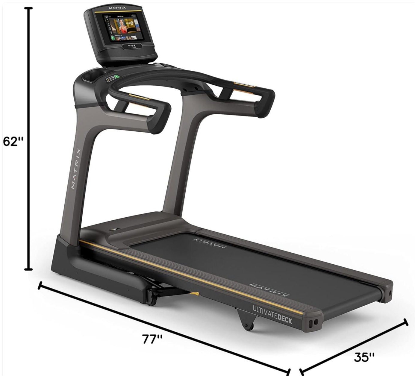
Figure 8: Dimensions of the Matrix Fitness TF30 Treadmill.