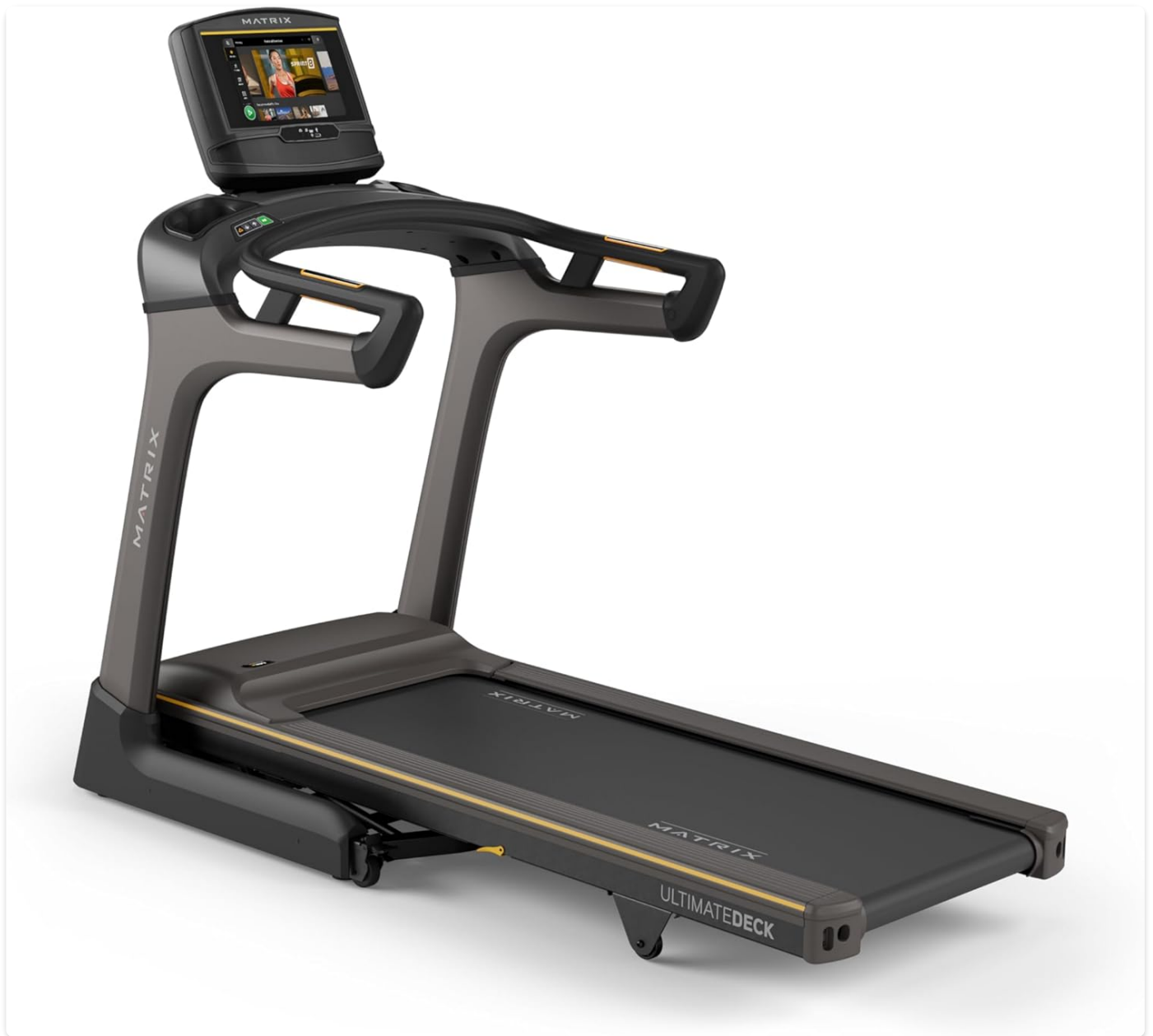
Figure 1: Matrix Fitness TF30 Treadmill with XER Console, showcasing its sleek design and integrated console.