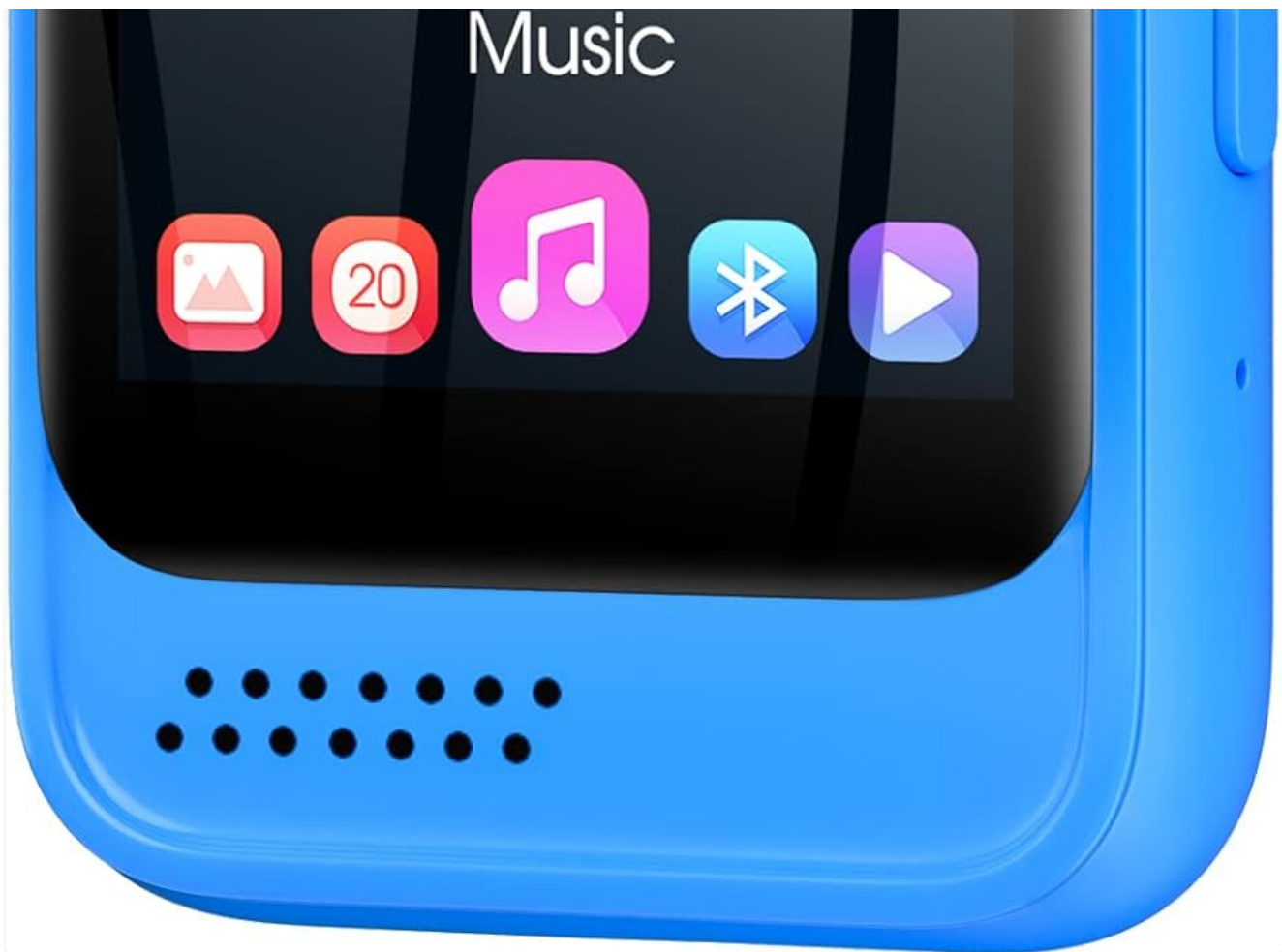
Image: Front view of the Jolike Bluetooth 5.0 MP3 Player, showcasing its compact design and touch screen interface.