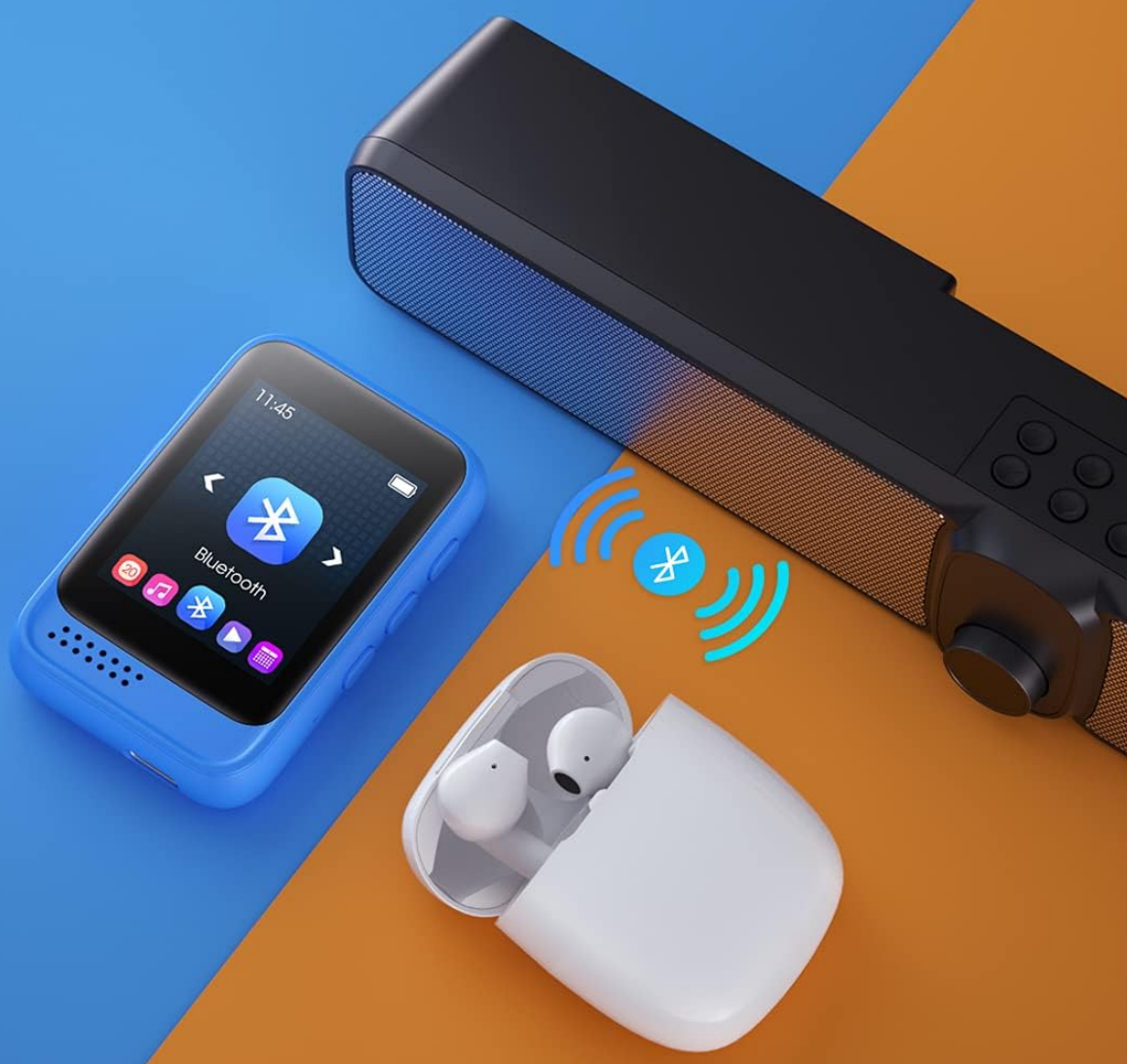
Image: The MP3 player displaying its Bluetooth menu, with icons representing connection to a Bluetooth speaker and wireless earbuds.