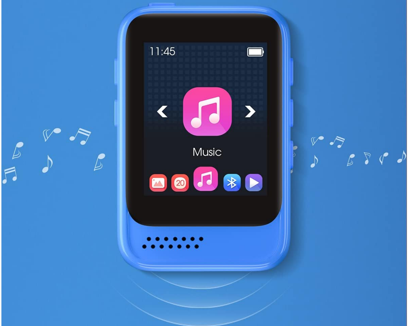
Image: The MP3 player showing its music interface, highlighting the built-in speaker feature, with musical notes floating around.