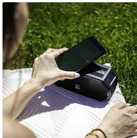
Figure 3: Wireless charging a smartphone on the speaker's top surface.

Built-in Phone Charger: Features both wireless (Qi) charging and wired USB-C output to charge your devices.