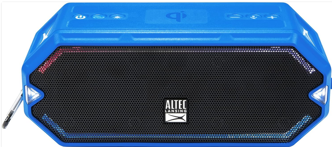
Figure 1: Front view of the Altec Lansing HydraBlast speaker in Royal Blue.

The Altec Lansing HydraBlast is a robust and versatile wireless portable Bluetooth speaker designed for various environments, from outdoor parties to everyday use. It features IP67 Everything Proof protection, ensuring it is waterproof, shockproof, snowproof, and dustproof. With a long-lasting battery, built-in phone charging capabilities, and dynamic LED lights, the HydraBlast delivers powerful audio and convenience wherever you go.