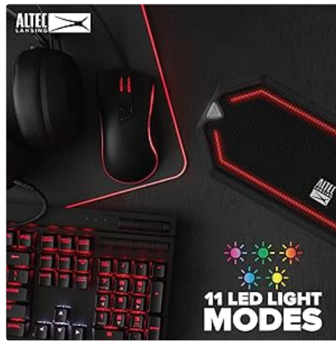
Figure 4: The speaker features 11 distinct LED light modes, including strobe effects.

Portable Design: Lightweight and includes a built-in carabiner hook for easy transport and attachment.