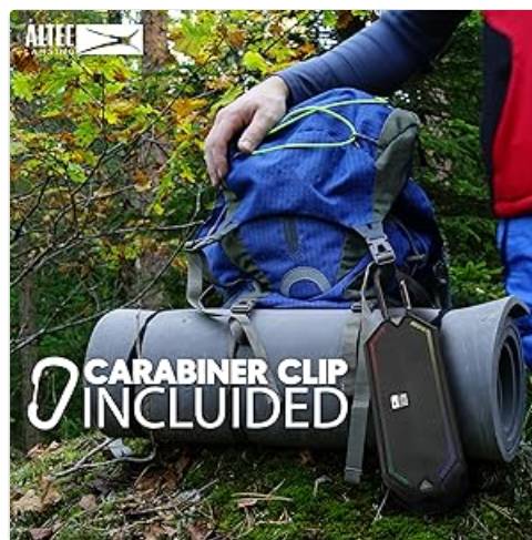
Figure 5: The included carabiner clip allows for easy portability, attaching to bags or gear.

Portable Design: Lightweight and includes a built-in carabiner hook for easy transport and attachment.