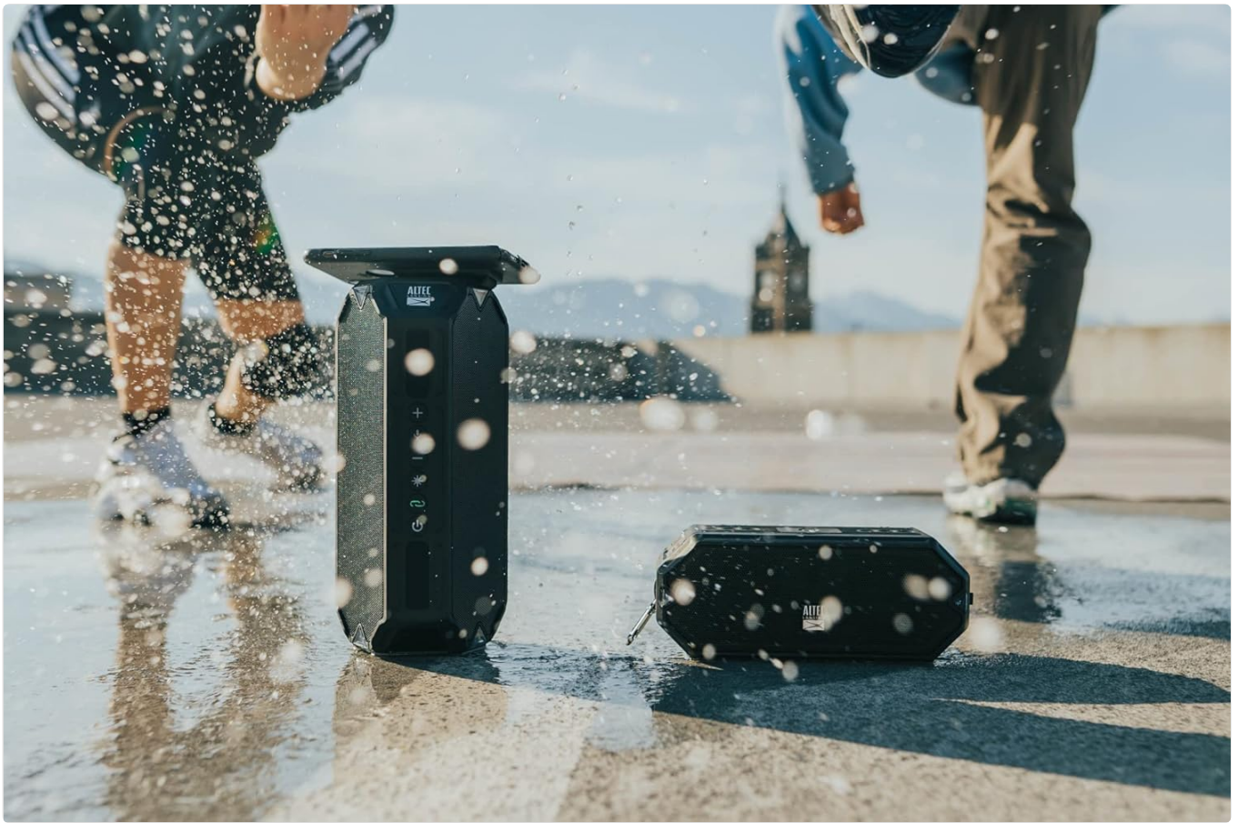
Figure 2: The HydraBlast speaker demonstrating its water resistance.

IP67 Everything Proof: Designed to be waterproof, shockproof, snowproof, and dustproof, making it suitable for any environment.