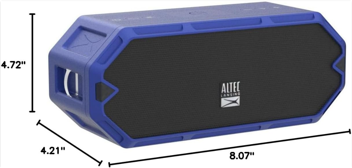
Figure 7: Dimensions of the HydraBlast speaker.