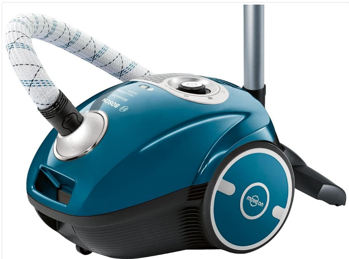
A side view of the Bosch BGL35MOV27 vacuum cleaner, highlighting the flexible hose connection and the 'MoveOn' branding on the wheel.