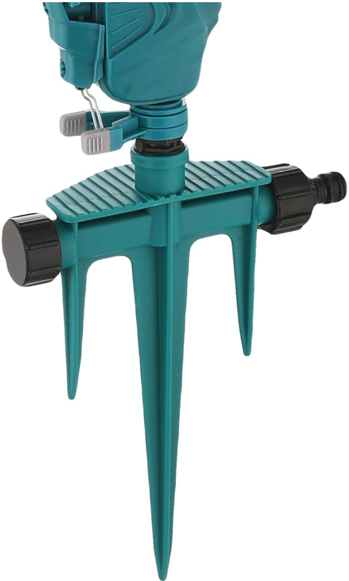
Figure 1: Overview of the TOTAL Automatic Plastic Water Sprinkler.