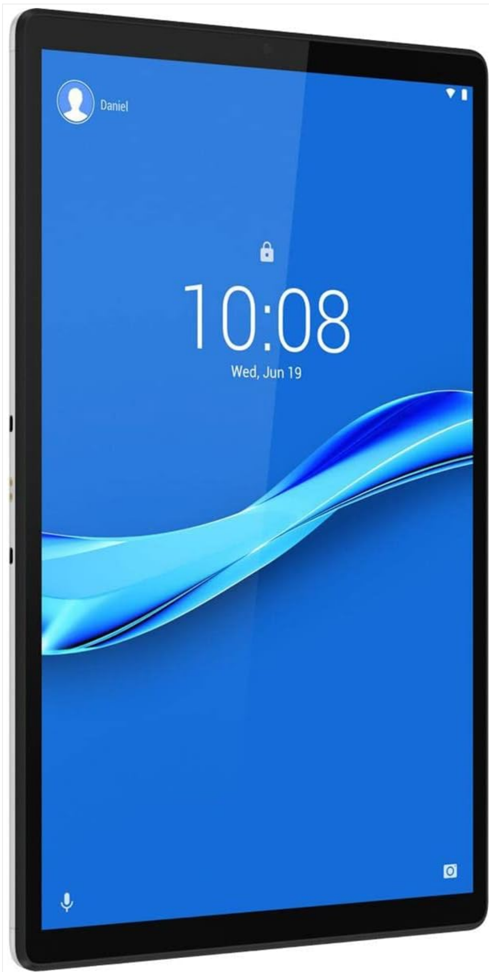
Image: Tablet lock screen during initial setup.