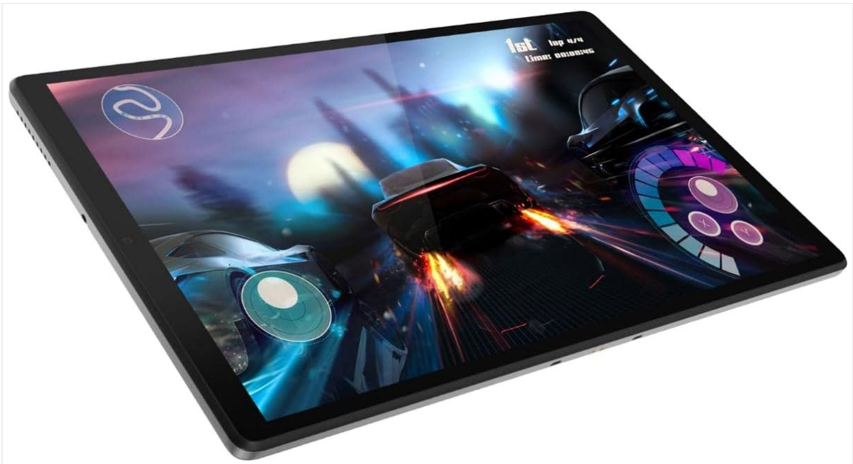
Image: Tablet displaying a racing game.

The tablet features dual speakers tuned with Dolby Atmos for an enhanced audio experience. Use the tablet for watching videos, listening to music, or playing games.