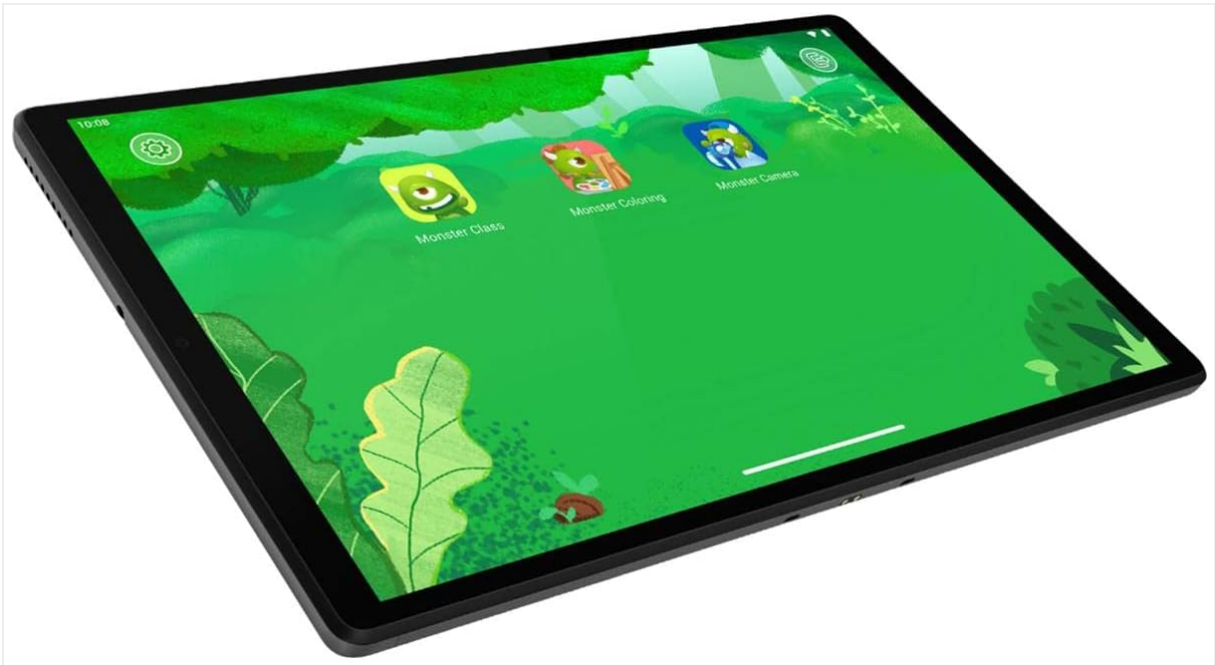
Image: Tablet displaying the Kid's Mode interface.