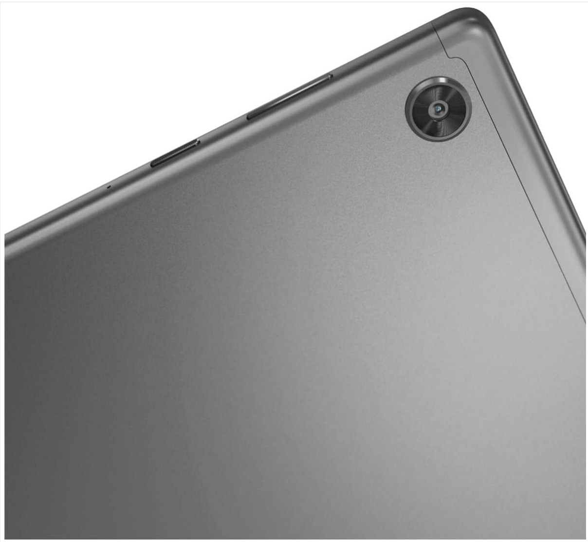
Image: Rear camera and side buttons (power, volume) on the Lenovo Tab M10 FHD Plus (2nd Gen).