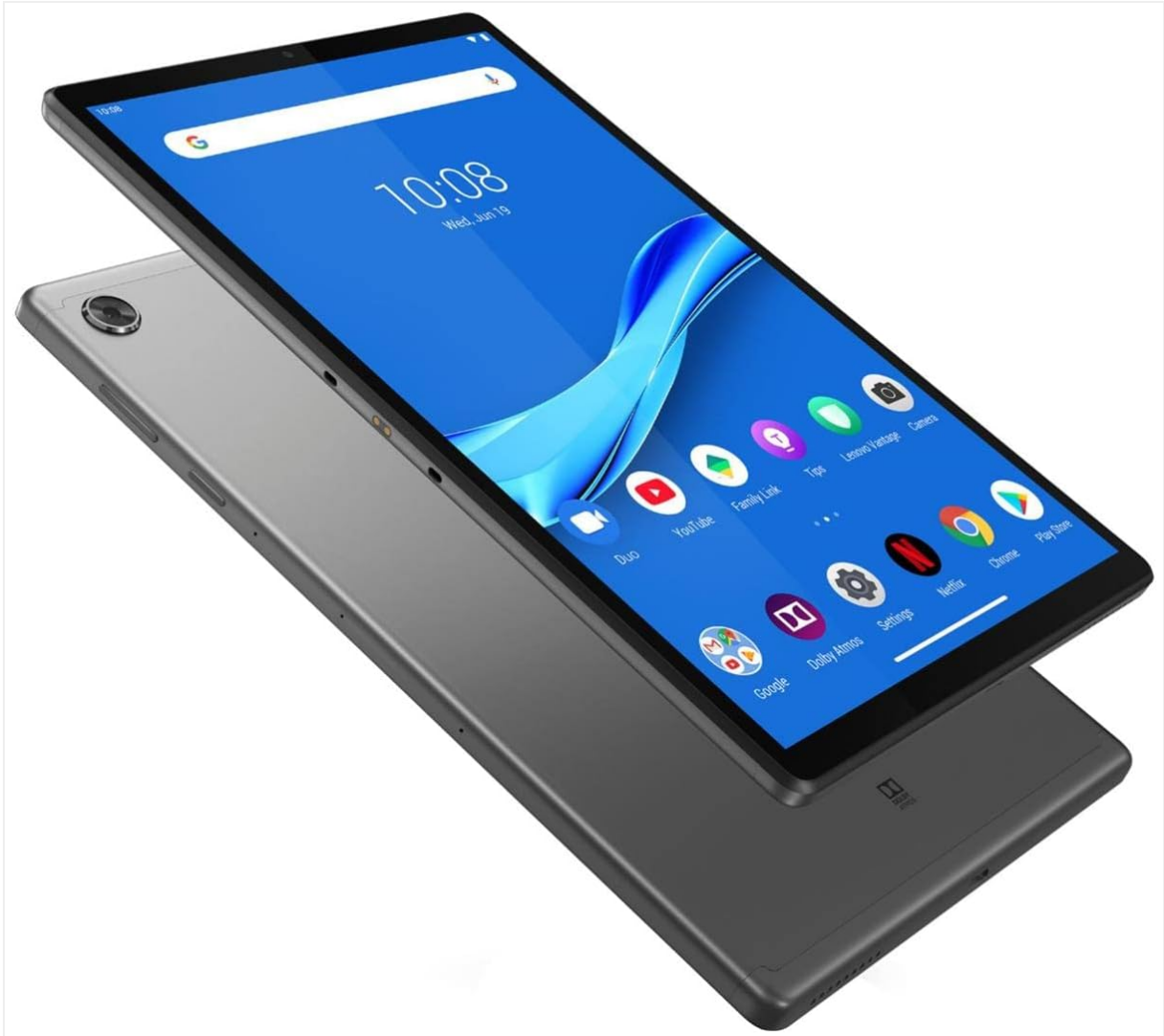
Image: Tablet home screen displaying various application icons.