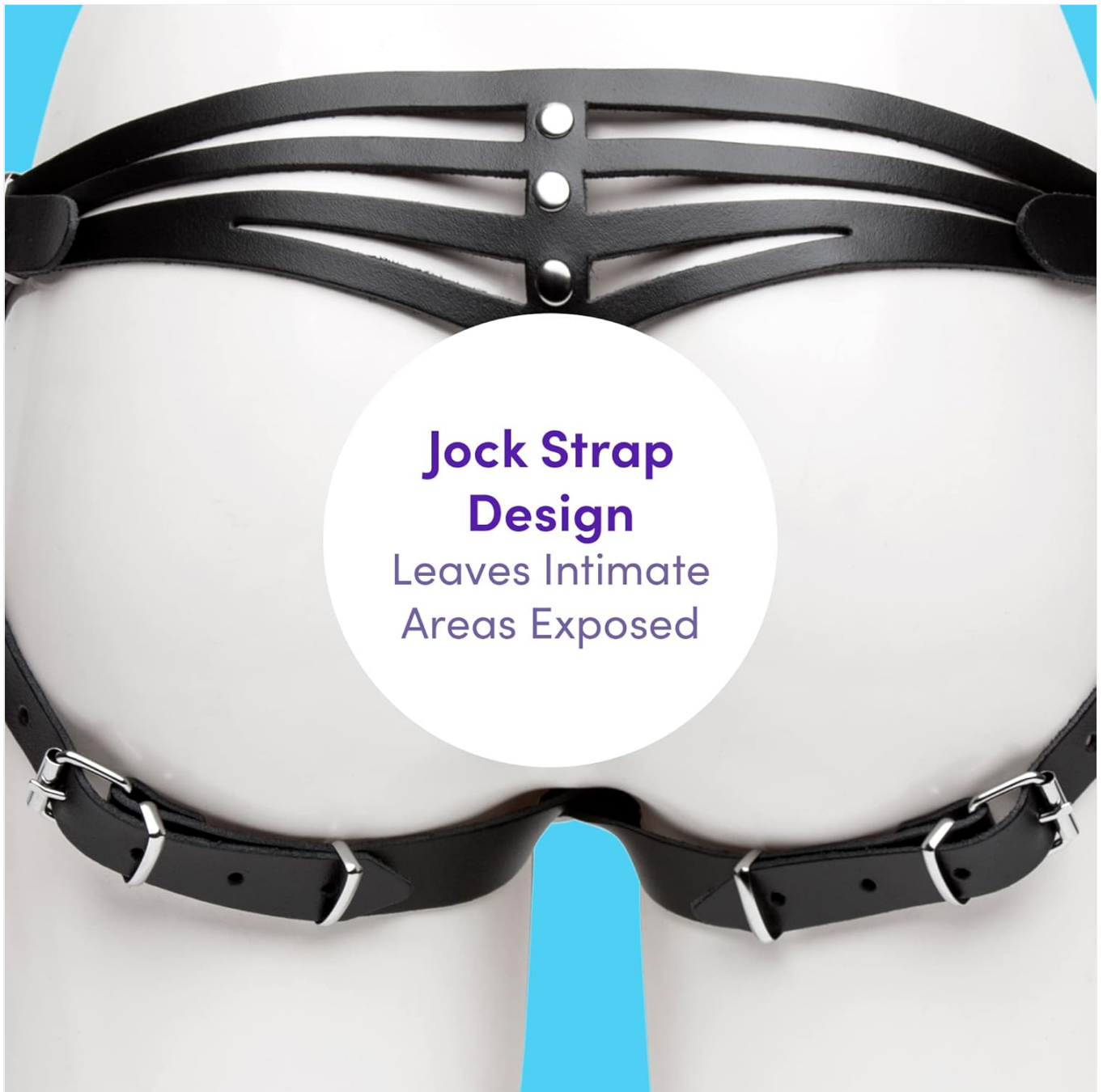
Image: Rear view of the harness, demonstrating the jock strap design that exposes the buttocks.