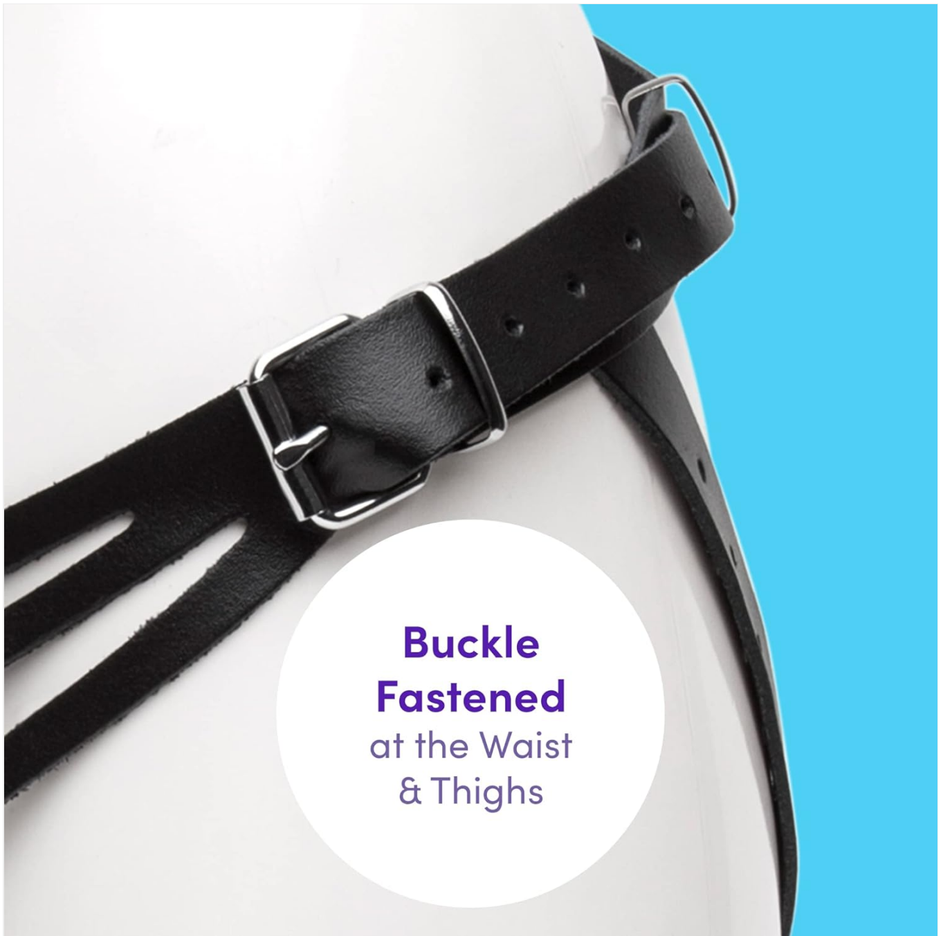
Image: Close-up view of the adjustable buckle fastening on the waist strap of the harness.