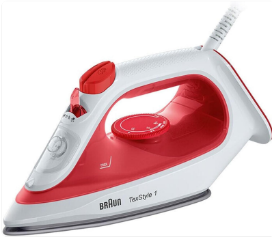
Front view of the Braun TexStyle 1 SI 1019 Steam Iron, showcasing its red and white design and controls.