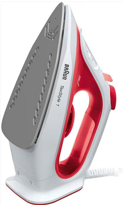
View of the iron's soleplate, highlighting its non-stick surface and steam vents.