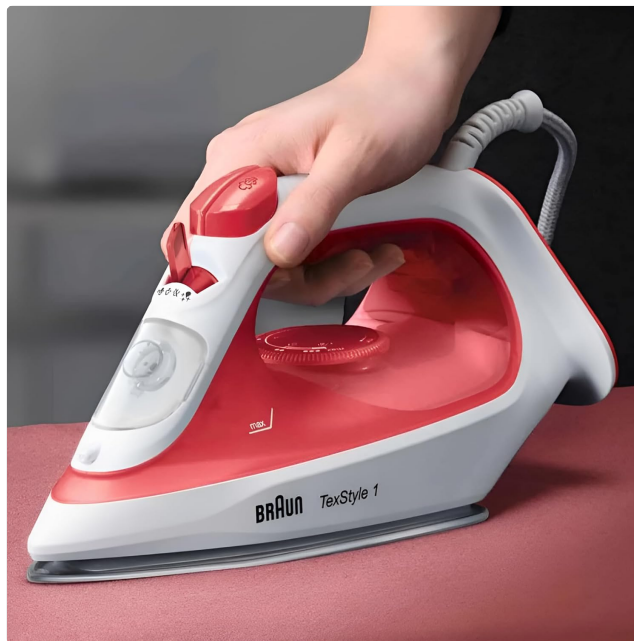
A hand demonstrating the use of the Braun TexStyle 1 SI 1019 steam iron on fabric.