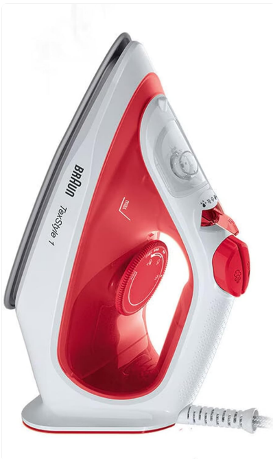
Side profile of the iron, showing its ergonomic handle and water tank.