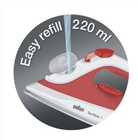
Illustration of the easy refill process for the 220 ml water tank.