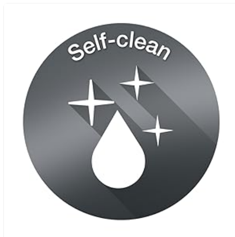
Icon representing the self-clean function of the iron.

To maintain optimal performance and prevent mineral build-up, use the self-clean function regularly, especially if you use tap water frequently. Refer to the specific instructions for activating the self-clean cycle in your iron's full manual.