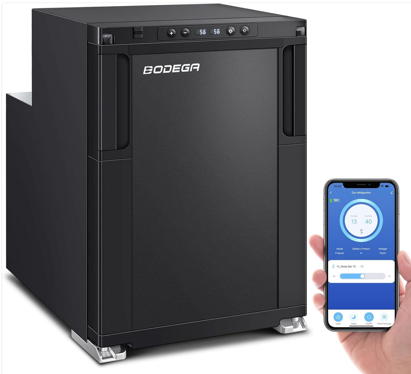
Image: The refrigerator can be controlled via a mobile application, allowing precise temperature adjustments.