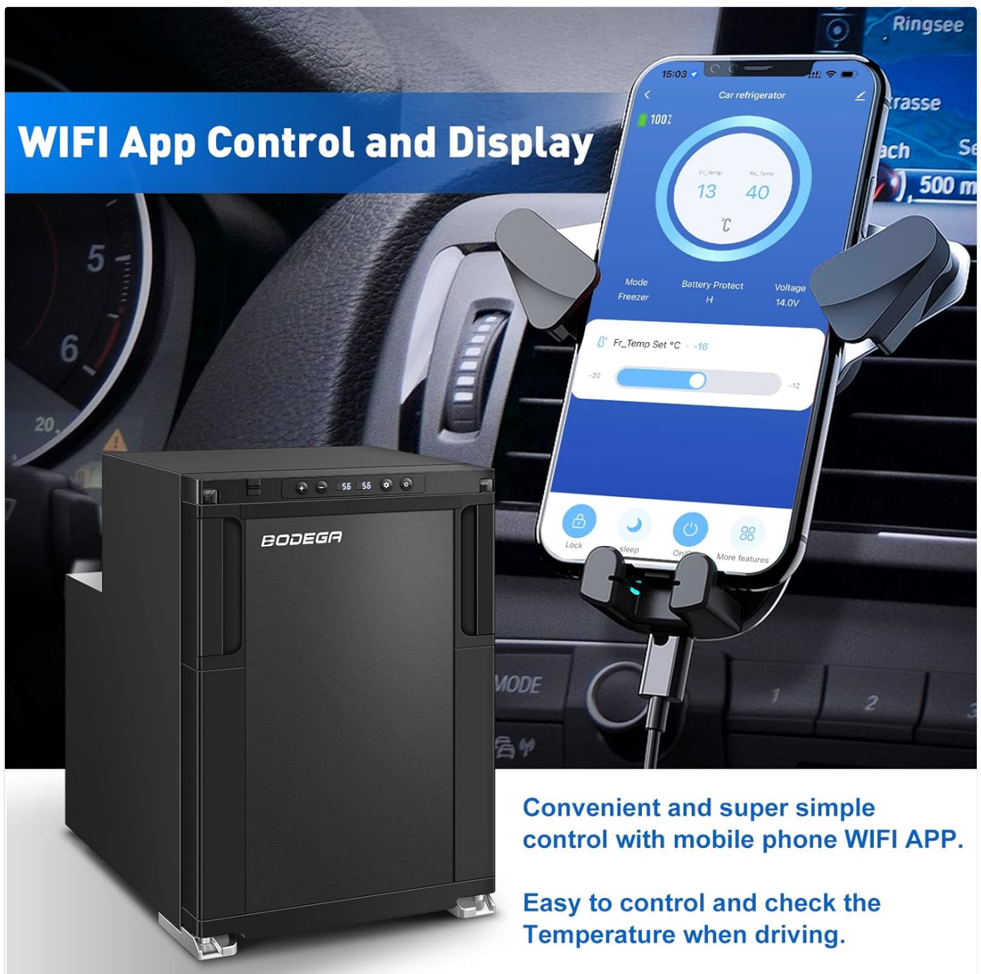
Image: The mobile app provides convenient control and monitoring, even while driving.