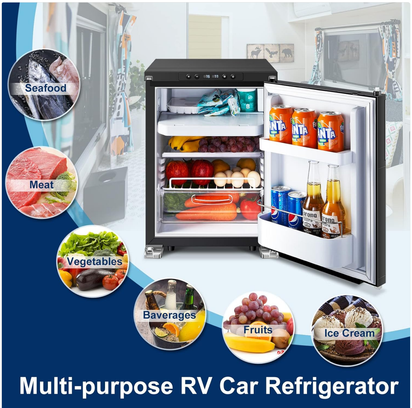
Image: The spacious interior with organized compartments for various food types.