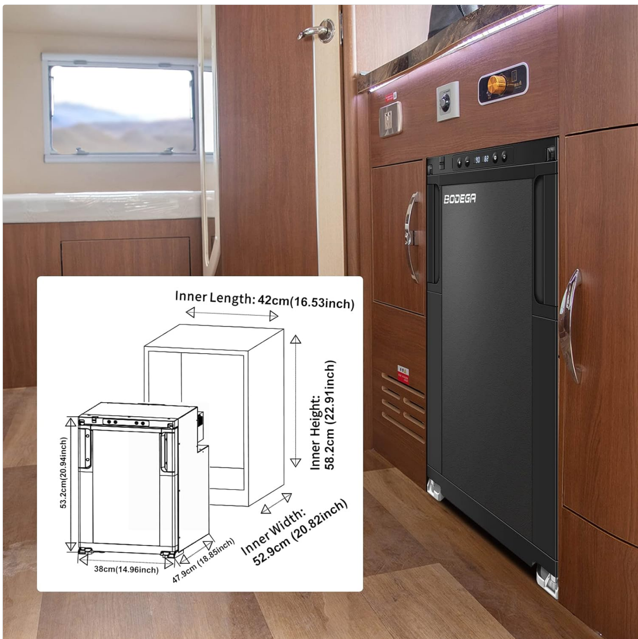
Image: The refrigerator's quiet operation ensures minimal disturbance.