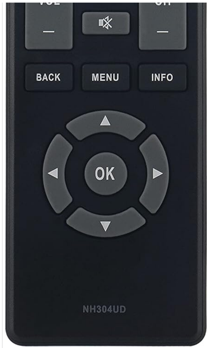
Image: Front view of the NH304UD remote control, displaying all functional buttons.