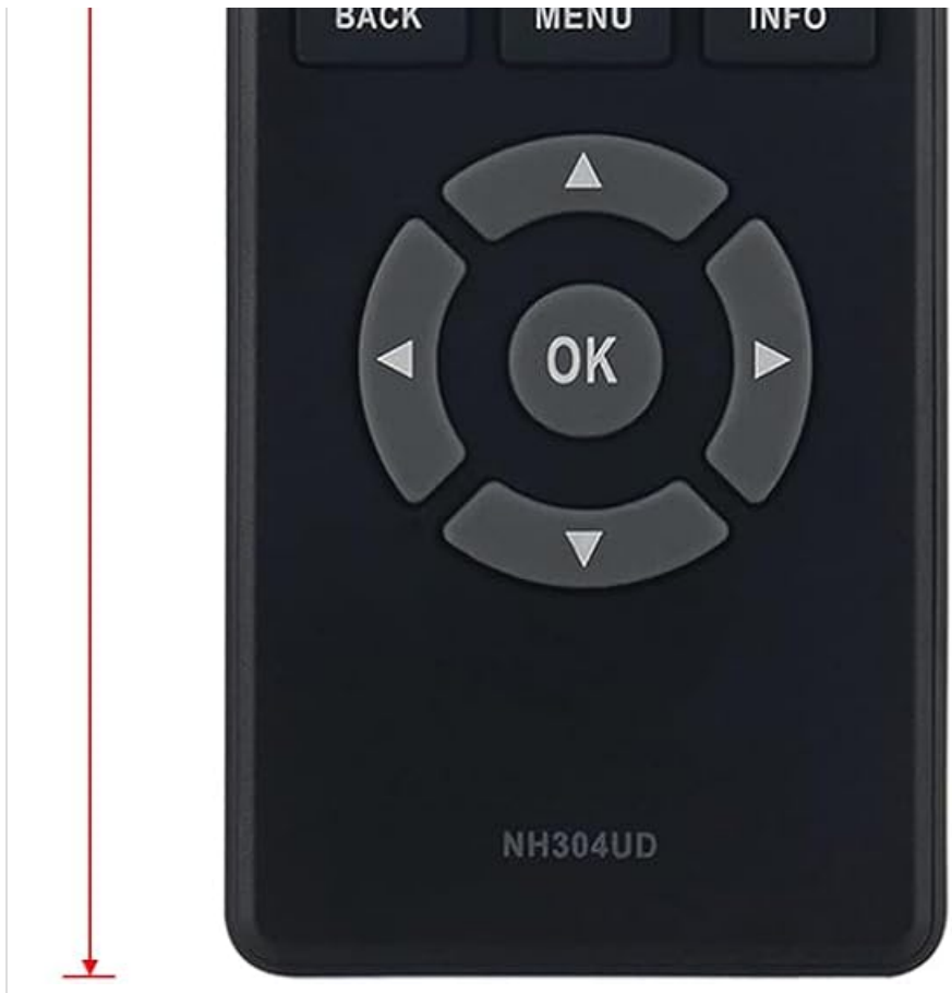
Image: NH304UD remote control with approximate dimensions indicated.