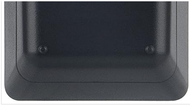
Image: Back of the NH304UD remote control, illustrating the battery compartment location and the notice regarding battery usage.