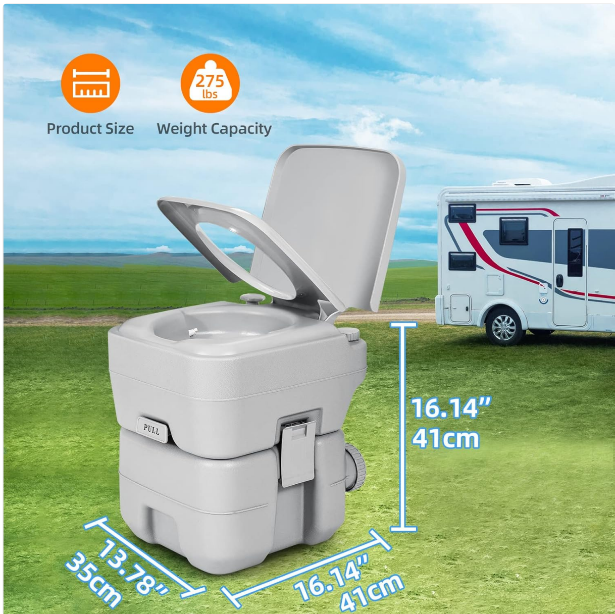
Figure 6.1: Product dimensions and weight capacity of the YITAHOME Portable Toilet.