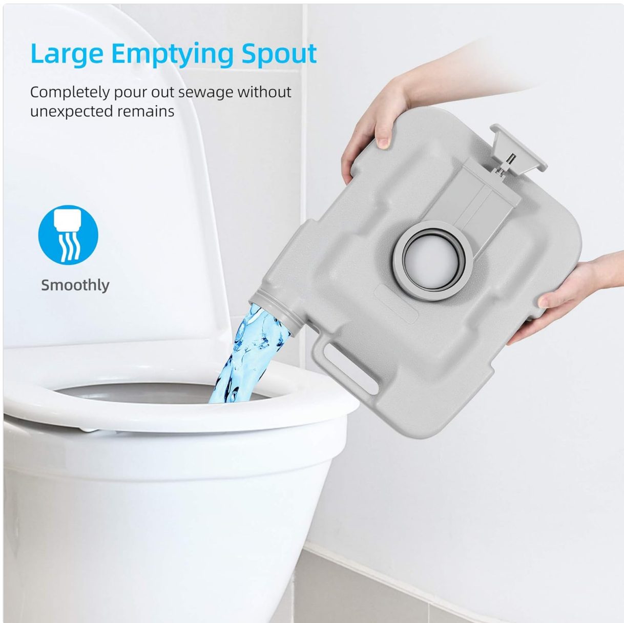
Figure 4.1: The large emptying spout facilitates smooth and complete disposal of sewage without unexpected remains.