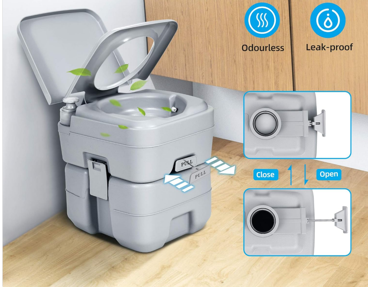
Figure 3.2: The instant sealing slide valve effectively prevents leakage and peculiar smells when closed.

Effectively prevent against leakage and peculiar smell