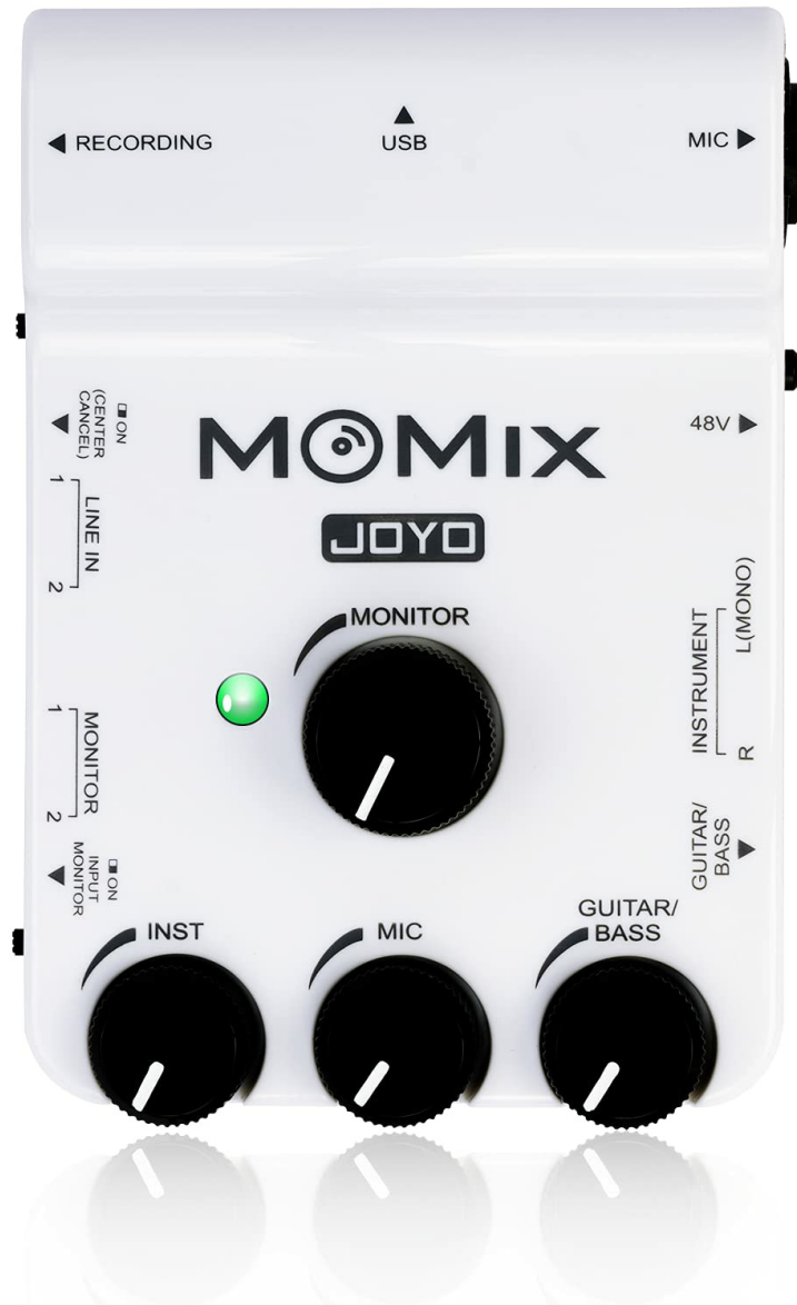
Image: The JOYO MOMIX device, showing its compact size and USB-C port for power and data.

The MOMIX can be powered directly by your smartphone or tablet via the USB-C connection, eliminating the need for an external power adapter.