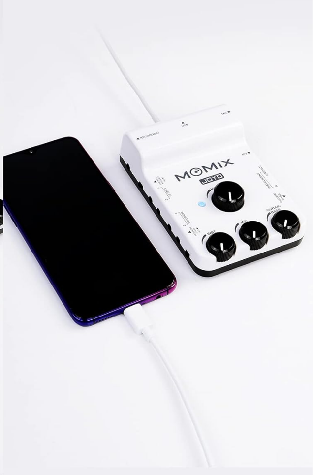
Image: The MOMIX connected to both an iPhone and an Android phone, illustrating the use of an OTG adapter for iOS devices.