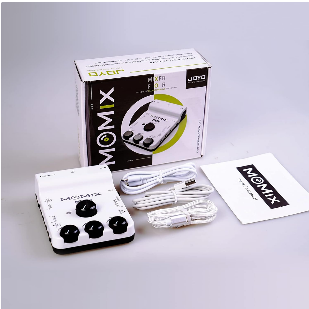
Image: The JOYO MOMIX package contents, showing the device, USB-C cable, OTG adapter, and user manual.