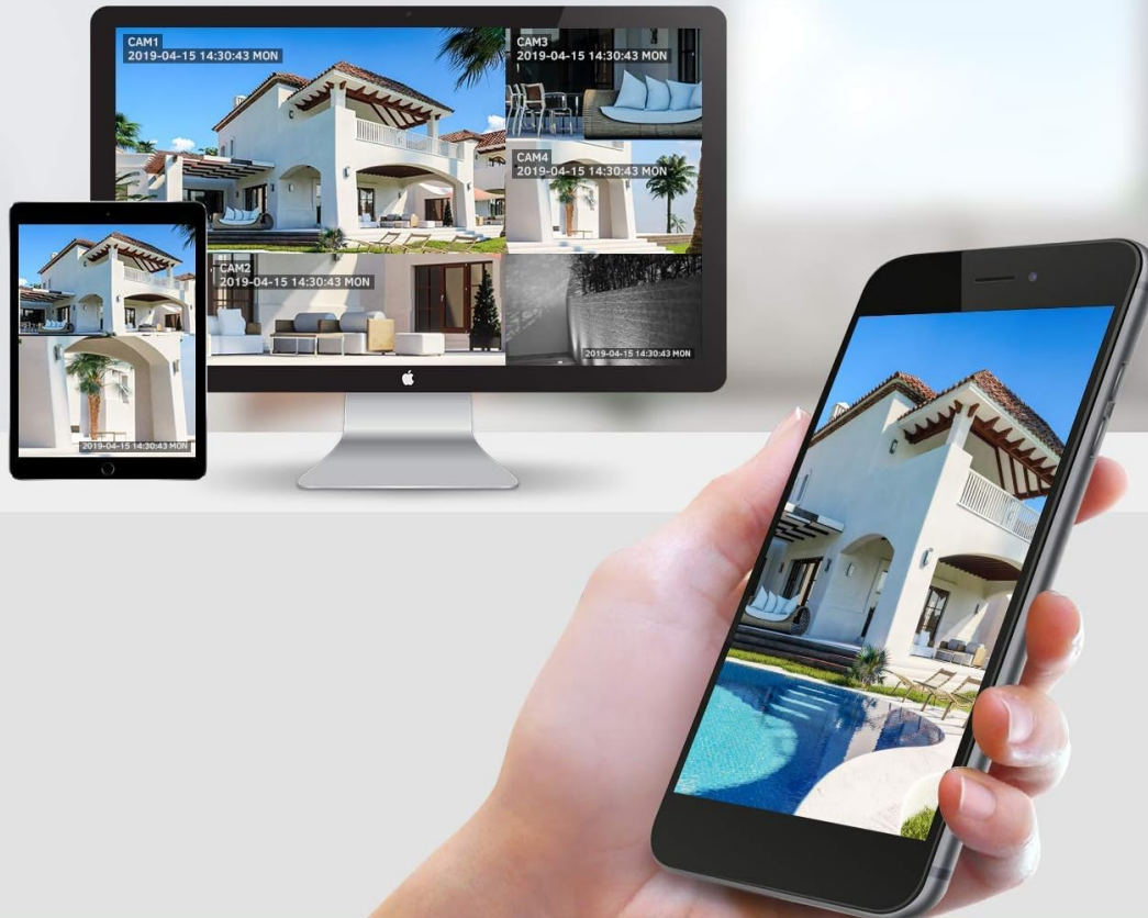
Figure 4: The system supports viewing on PC and mobile devices, allowing flexible access to your surveillance feeds.