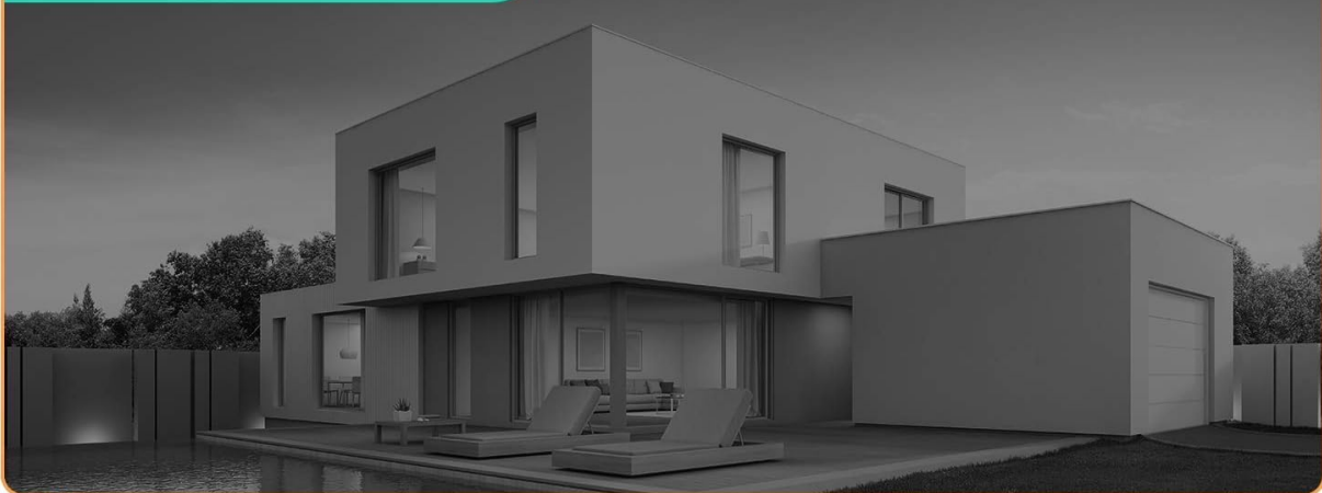
Figure 6: Comparison of colorful day vision and clear night vision, demonstrating the camera's ability to provide surveillance around the clock.