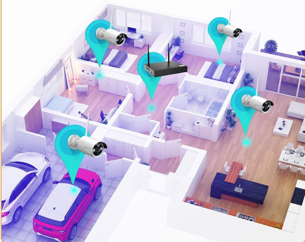
Figure 1: Overview of a typical wireless security camera system setup, illustrating how multiple cameras connect wirelessly to a central recording unit (NVR) to cover various areas of a property.