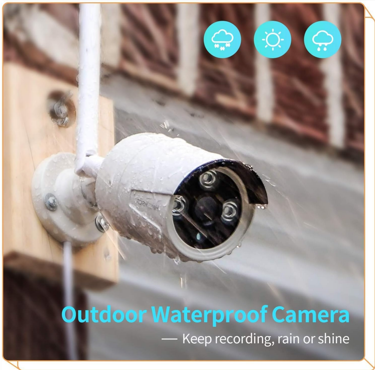
Figure 3: The camera's IP66 waterproof design, ensuring reliable operation in various outdoor weather conditions.