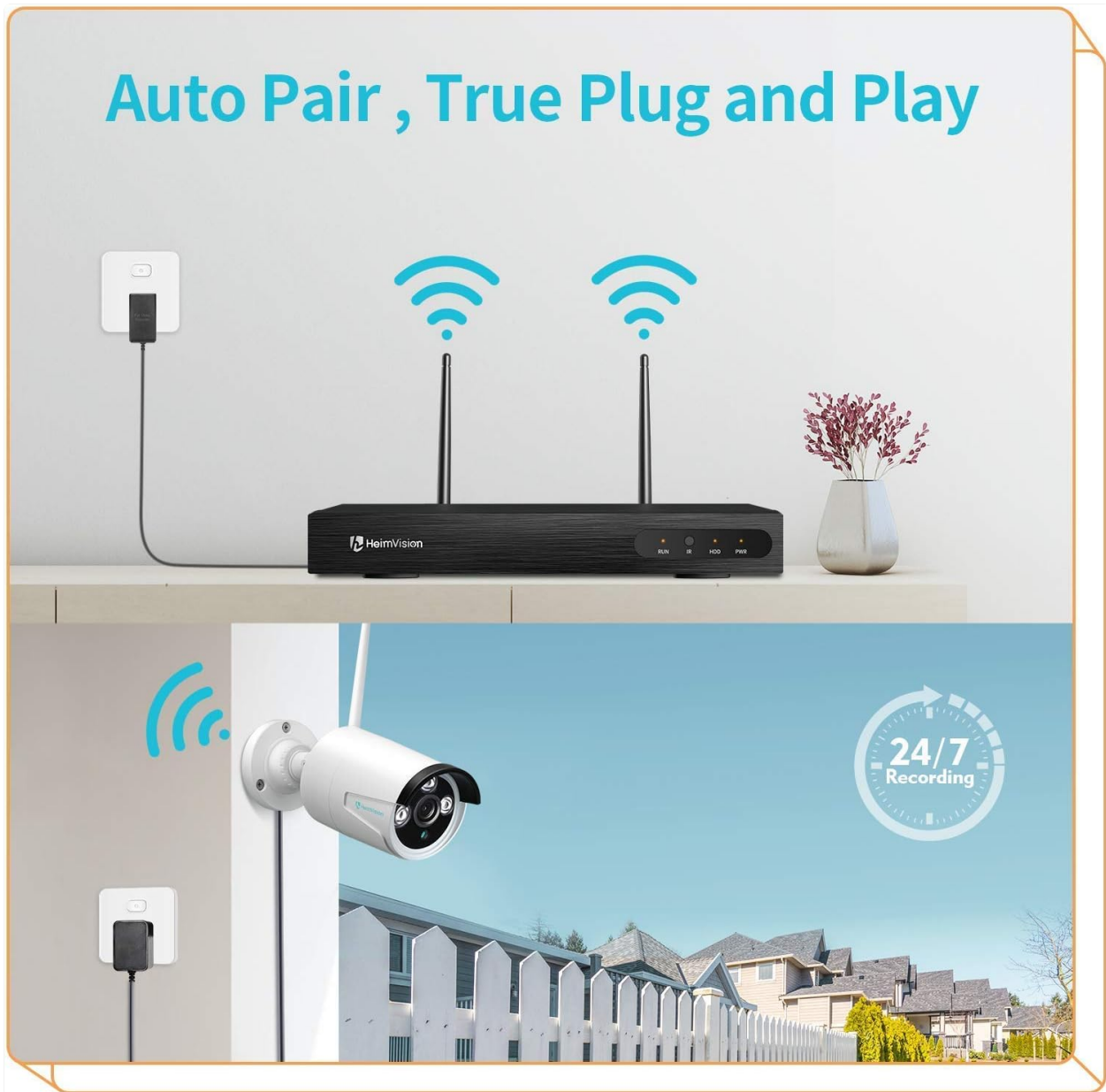
Figure 2: The 'Auto Pair, True Plug and Play' functionality, demonstrating the simple wireless connection between the camera and the NVR.