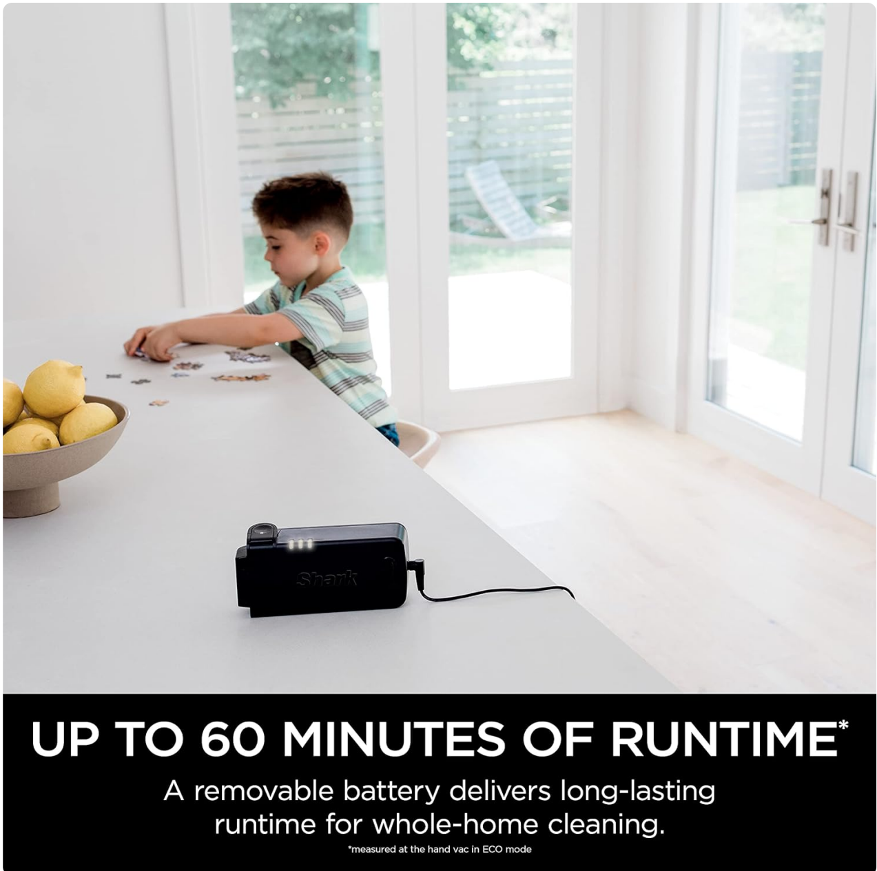
Figure 3: Battery Charging. The removable battery can be charged independently, providing flexibility and ensuring the vacuum is always ready for use.