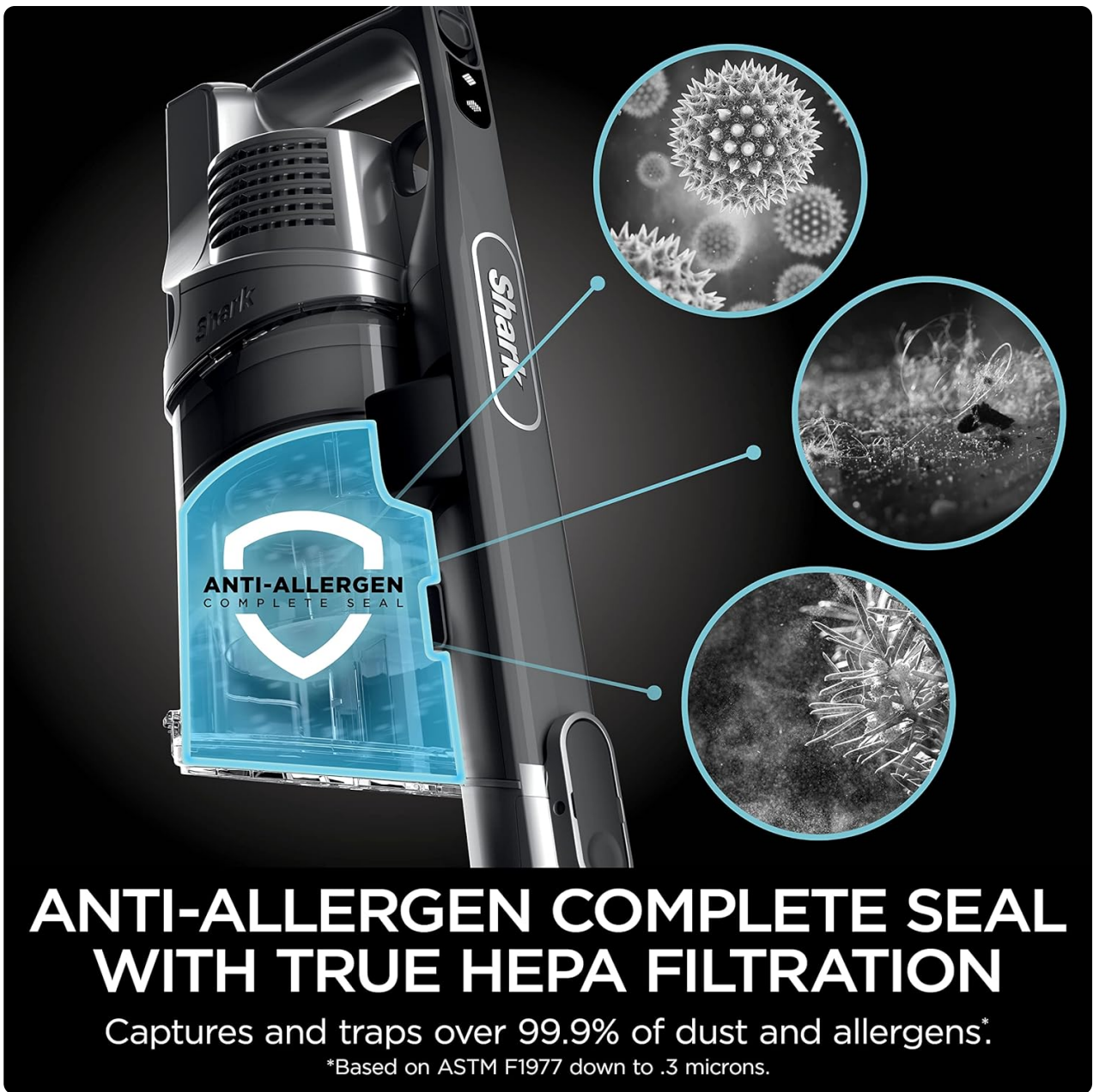
Figure 12: Anti-Allergen Complete Seal. This system, combined with a HEPA filter, captures and traps over 99.9% of dust and allergens inside the vacuum.