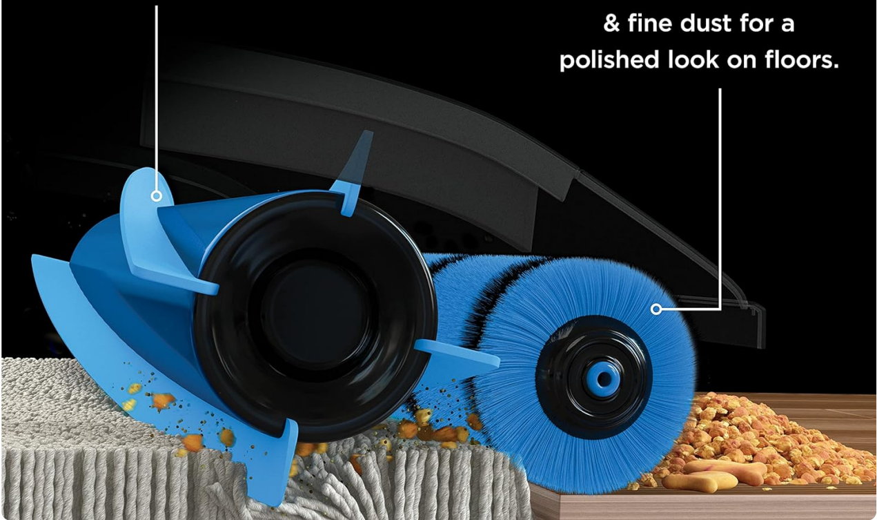
Figure 2: DuoClean PowerFins. This image highlights the innovative PowerFins and soft roller brushrolls, designed for effective cleaning on both carpets and hard floors without hair wrap.

Soft Roller Pulls in large particles & fine dust for a polished look on floors.