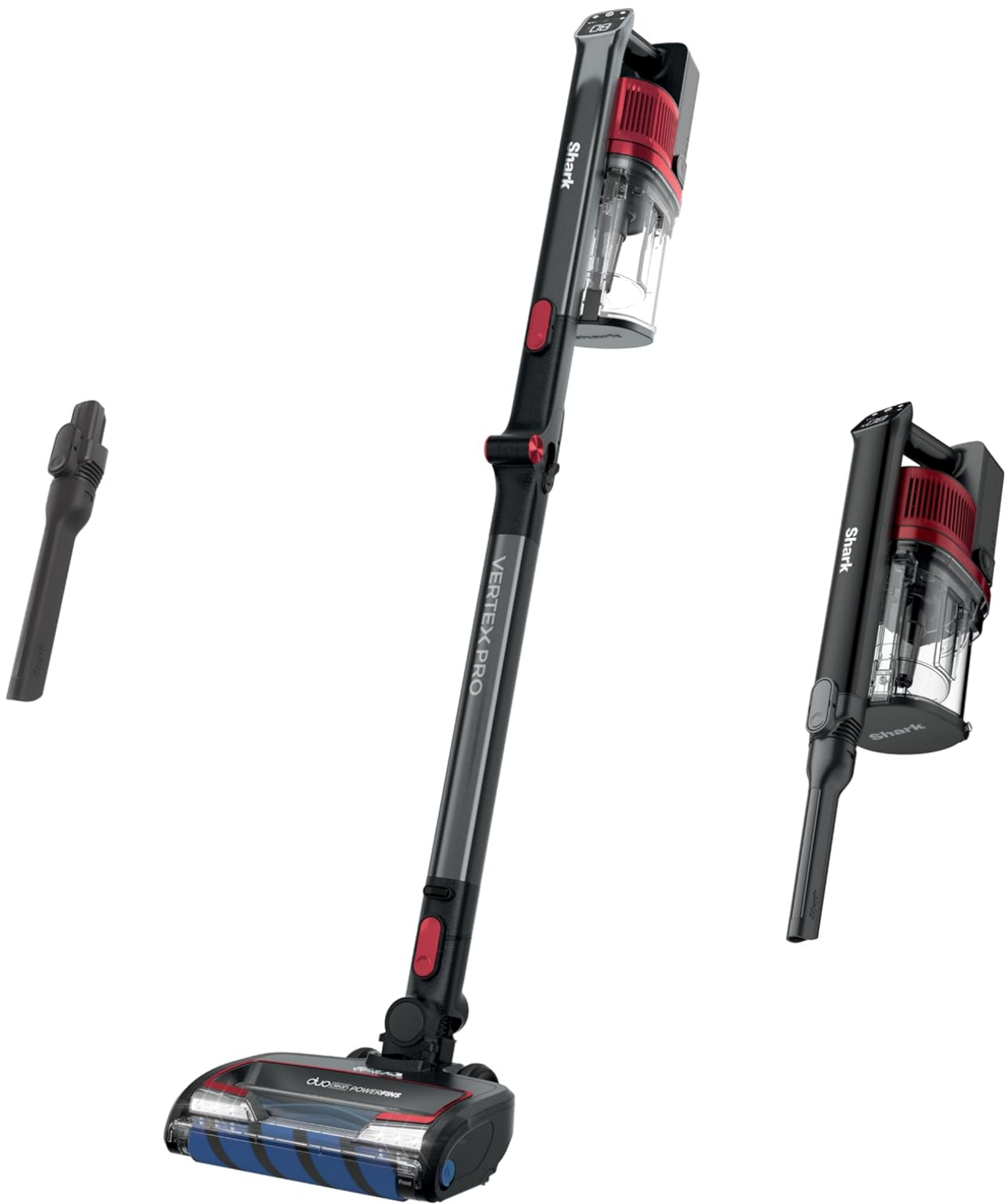
Figure 1: Shark Cordless Vertex Pro Vacuum and Components. This image displays the full vacuum assembly, including the main unit, wand, and floor nozzle, alongside a detached handheld unit and crevice tool, illustrating its versatile configurations.