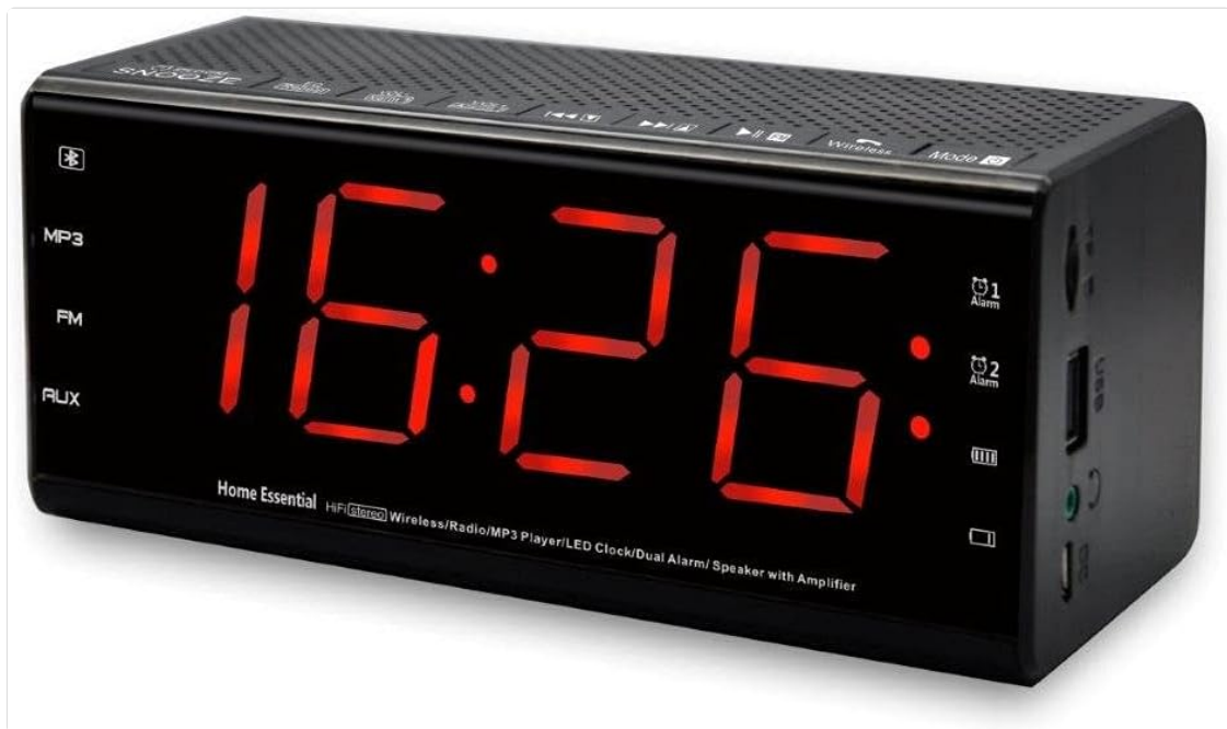
Figure 4.1: Front View of the Falcon YM-200

This image displays the front of the Falcon YM-200 Bluetooth Alarm Clock. It features a large red LED display showing the time "16:26". To the left of the display are indicators for MP3, FM, and AUX modes. To the right, there are indicators for Alarm 1 and Alarm 2, and a battery icon. The top panel shows various control buttons, including snooze, volume, and mode selection.