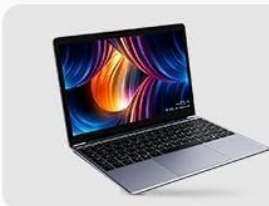
PC USB Port