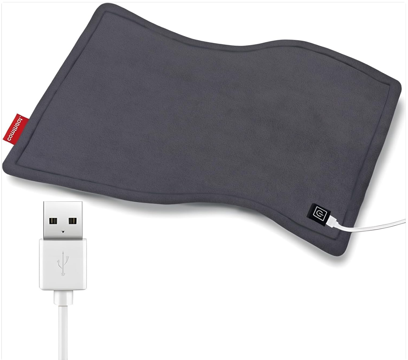
Image: The Comfheat USB Heating Pad in grey, showing its compact size and attached USB power cable.