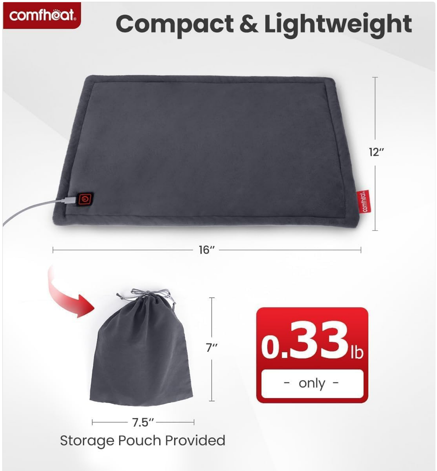
Image: The heating pad's compact size and the included storage pouch for portability.

Note: Power bank and USB adapter are not included and must be purchased separately.