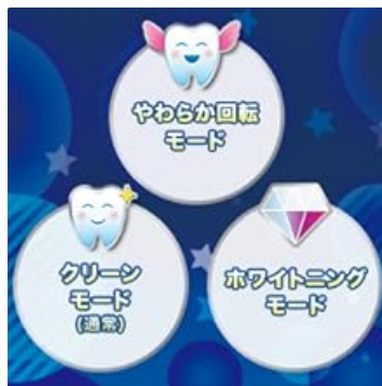
Image: Visual representation of the three available brushing modes.