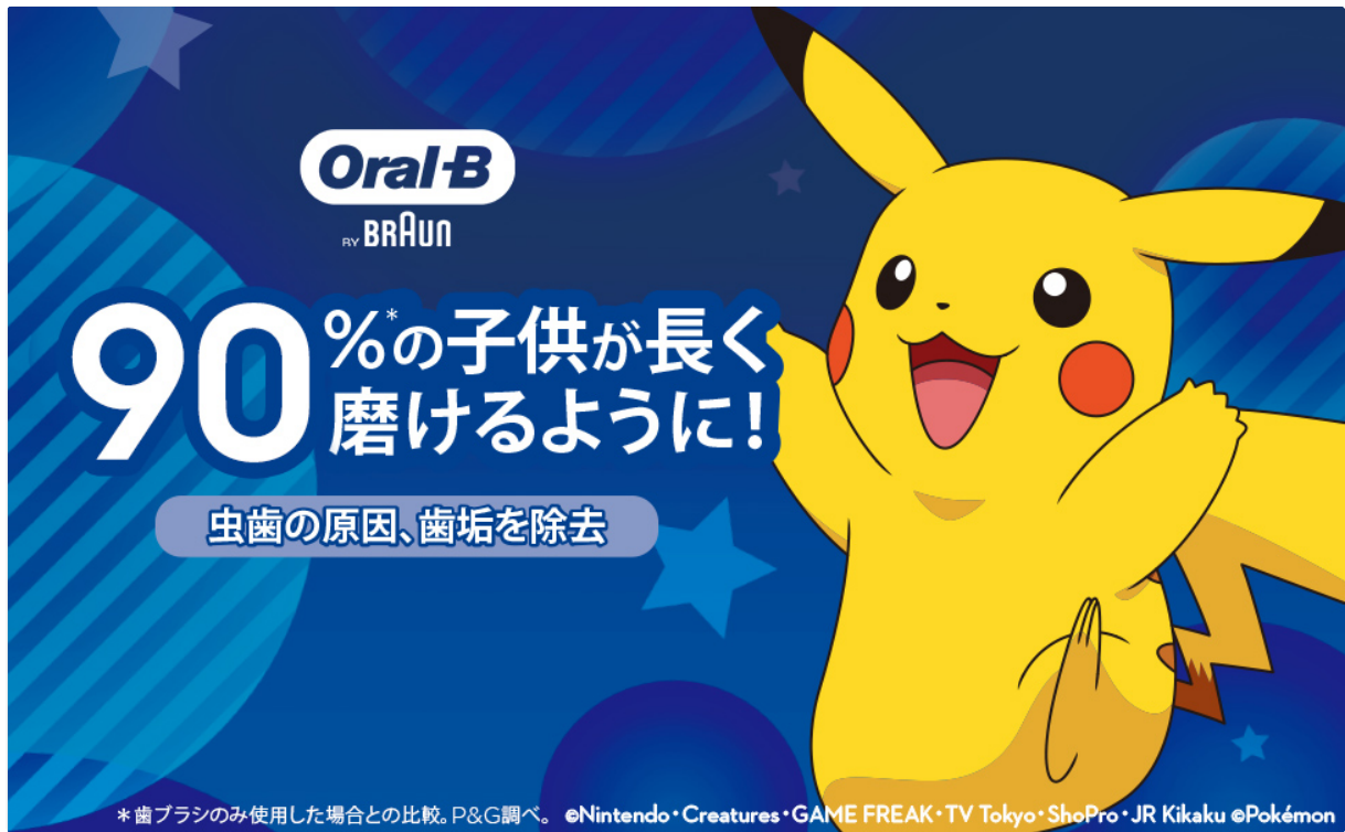
Image: Oral-B Kids PRO Electric Toothbrush with Pokemon design, emphasizing extended brushing time for children.