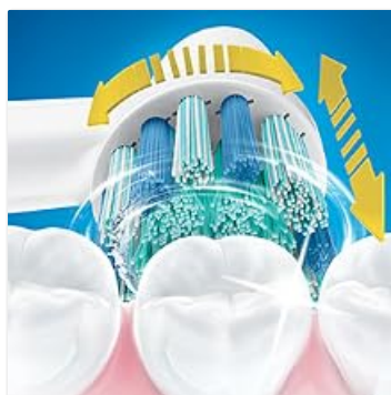
Image: The 3D round rotation brush head in action, demonstrating plaque removal.