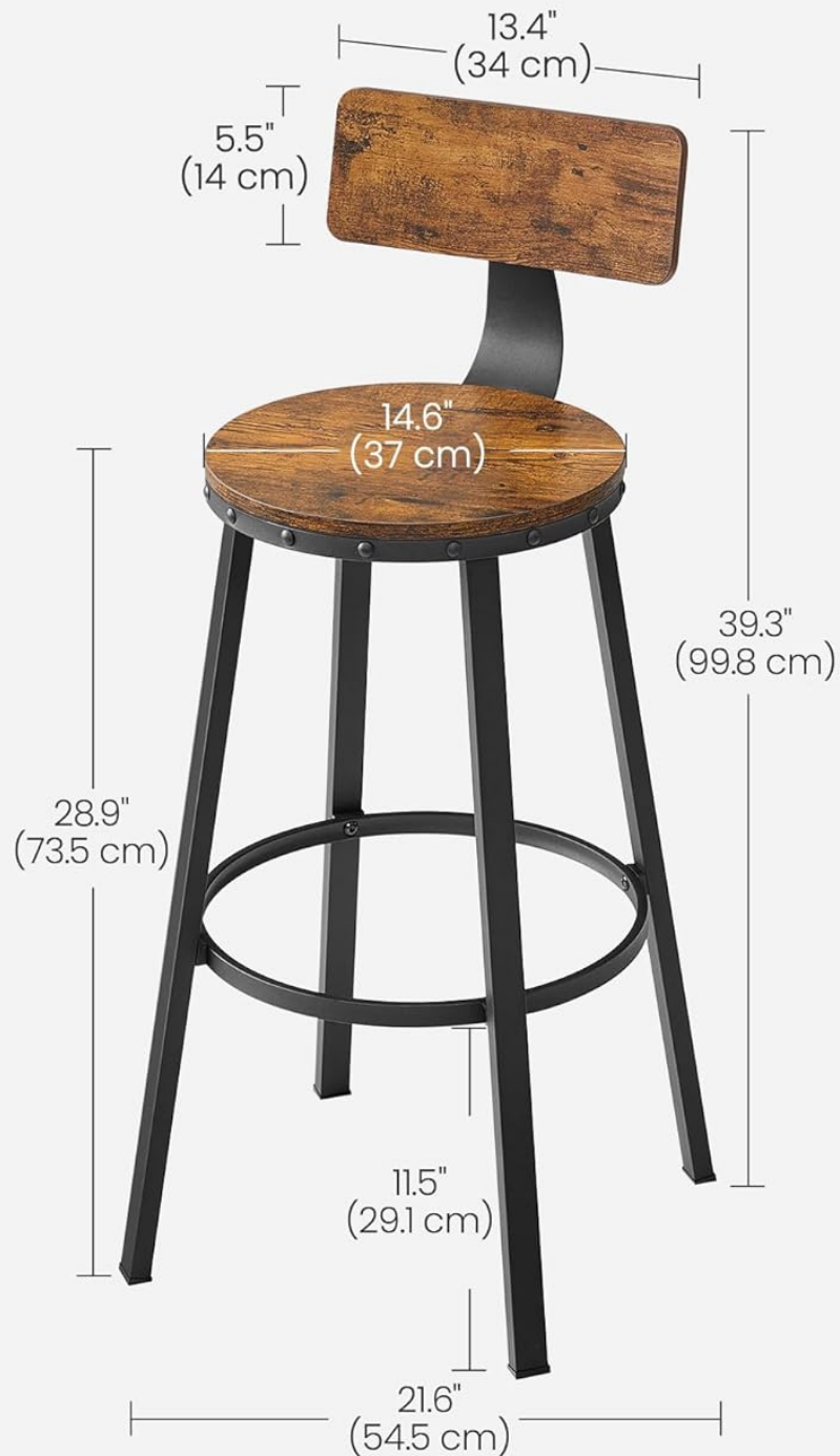
Image: Detailed dimensional drawing of the bar stool, indicating measurements for height, seat diameter, and base footprint, along with the maximum weight capacity.