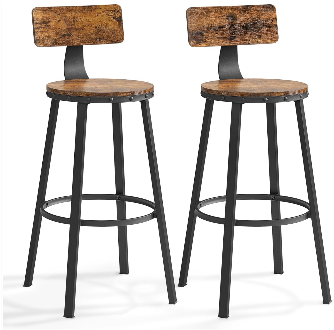
Image: Two VASAGLE bar stools, featuring rustic brown wooden seats and backrests, supported by sturdy black steel frames. These stools are designed for bar height counters.