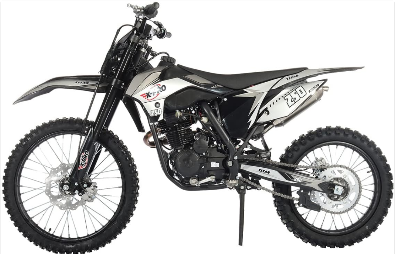
Image description: A side view of the X-PRO Titan 250cc Dirt Bike in black and silver, showcasing its design and large wheels.