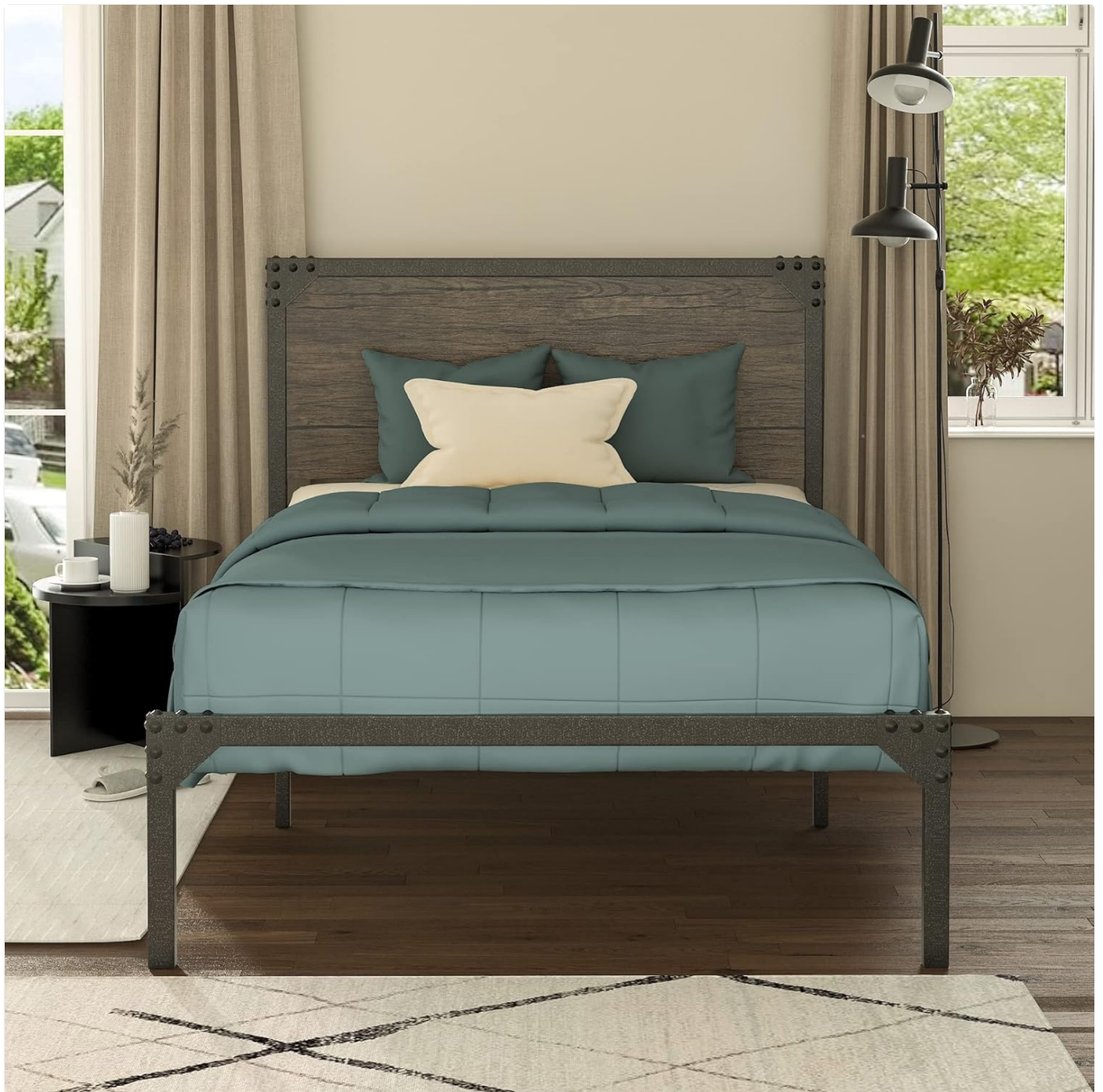
Image: Full view of the assembled IMUsee Twin Size Platform Metal Bed Frame with a mattress and bedding, showcasing its rustic brown wood headboard and metal frame.