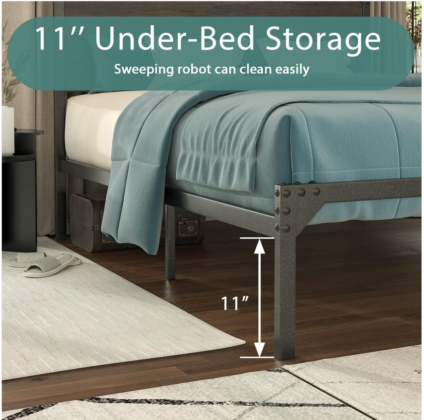
Image: Illustration showing the 11-inch under-bed clearance, indicating ample space for storage and ease of cleaning by a sweeping robot.