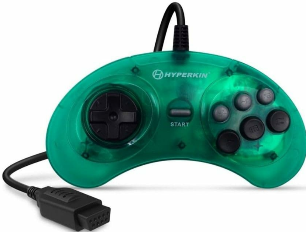
Image: A detailed view of the Hyperkin GN6 Premium Controller. This image highlights the controller's layout, including the eight-way directional pad, six primary action buttons, and the Start button. The attached cable with its Genesis-compatible connector is also visible, demonstrating the connection point.