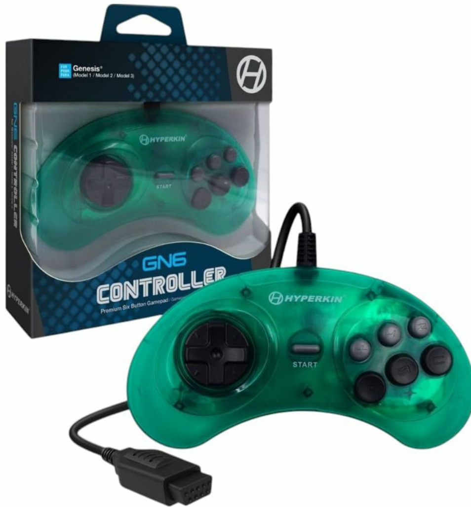
Image: The Hyperkin GN6 Premium Controller, translucent green, displayed alongside its retail packaging. The packaging clearly shows the product name and compatibility with Genesis systems. This image illustrates the complete product as it would appear when unboxed.