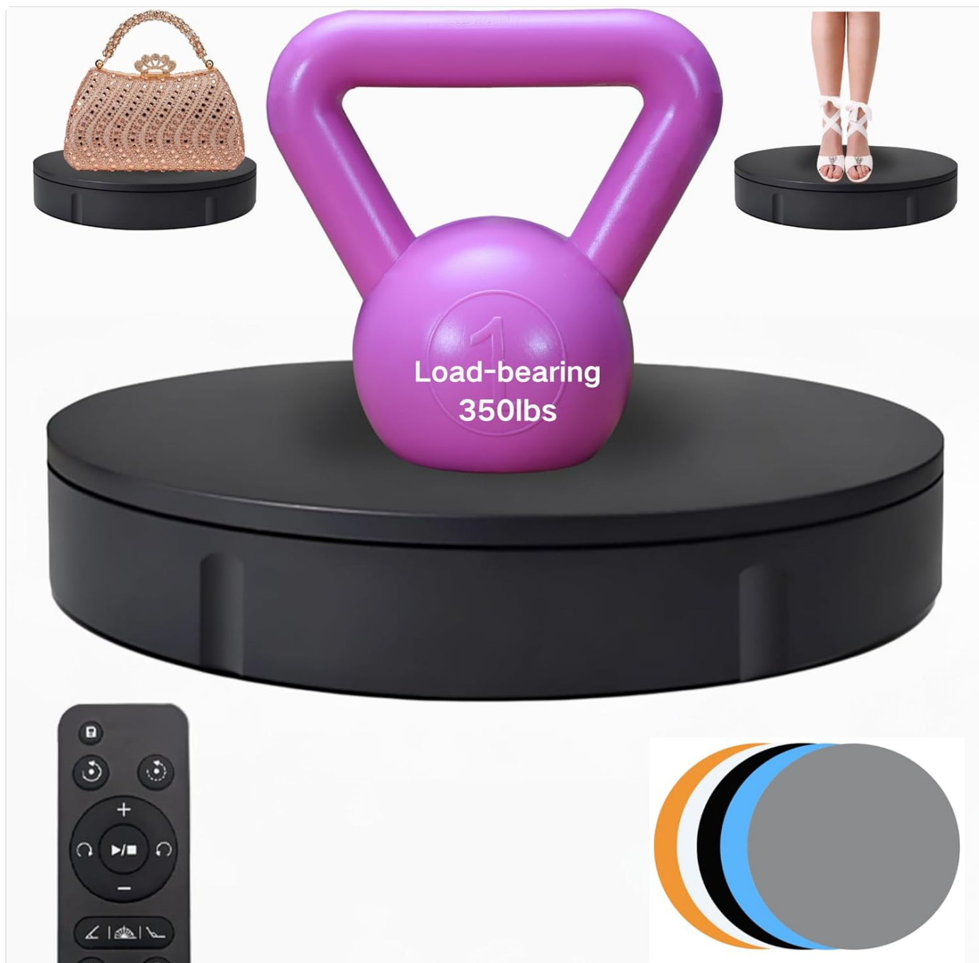
Figure 4.1: The JAYEGT Motorized Rotating Display Stand with its remote control, showcasing its ability to hold various items like a handbag, kettlebell, and shoes.