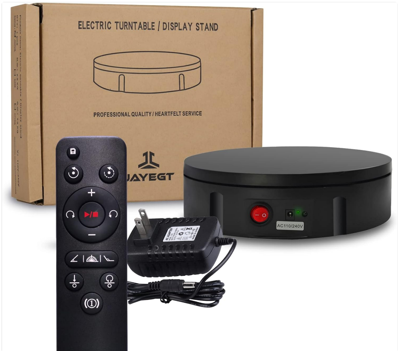
Figure 4.3: Detailed view of the turntable's underside, highlighting the non-slip feet, and close-ups of the power switch, power socket, and remote control sensor light.