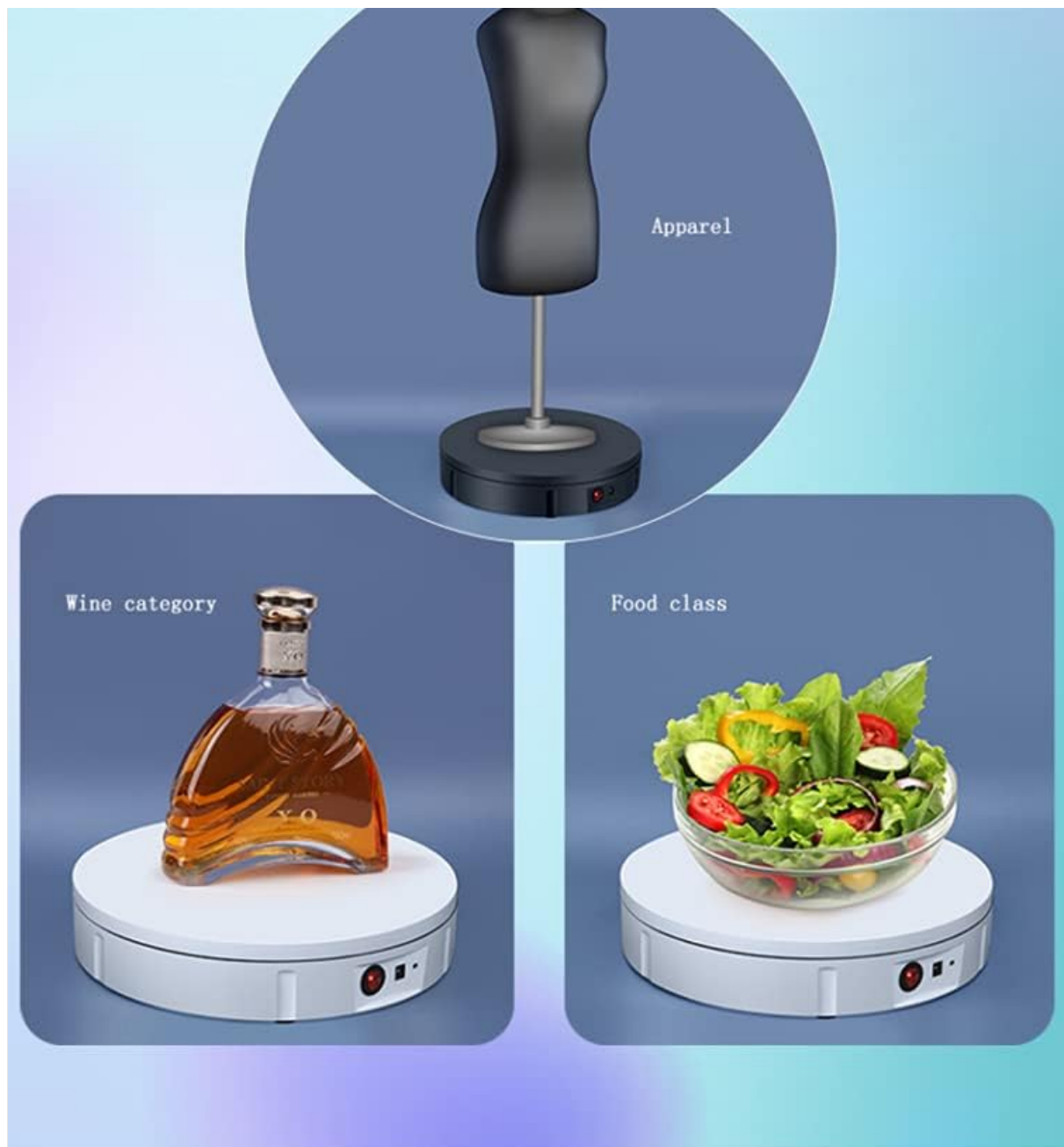
Figure 6.1: Examples of how the JAYEGT display stand can be used for various products, such as shoes, cosmetics, clothing, beverages, and food, in different display scenarios.