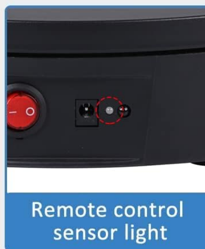
Remote control sensor light