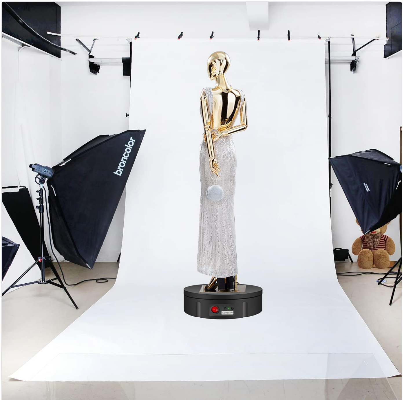
Figure 6.2: The JAYEGT display stand in a professional photography studio, showcasing a mannequin, demonstrating its utility for high-quality product visuals.