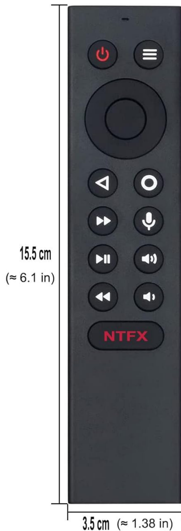
Figure 6.1: Product dimensions of the ALLIMITY P3700 remote. The remote measures approximately 15.5 cm (6.1 inches) in length and 3.5 cm (1.38 inches) in width.

Note: we sold is REPLACEMENT remote, the size of product will be more bigger than original one. Kindly please do not order if you care the size.